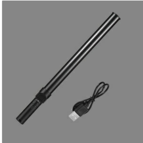
Image: The Andoer D2 light wand shown alongside its USB Type-C charging cable, illustrating the charging setup.