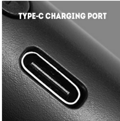
Image: A close-up view of the Type-C charging port, indicating where to connect the charging cable.

Before first use, fully charge the light wand. Connect the provided USB Type-C cable to the charging port on the device and the other end to a USB power adapter (not included) or a computer USB port. The power indicator light will show charging status.