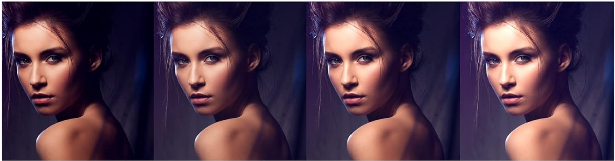
Image: Visual representation of the adjustable color temperatures, ranging from warm (2500K) to neutral (5500K) to cool (8500K) light.