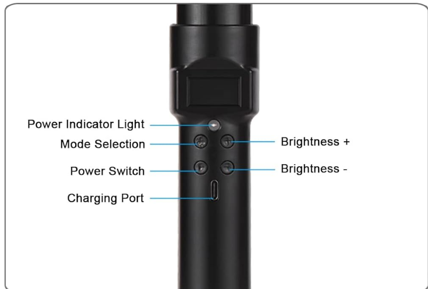
Image: Overview of the Andoer D2 light wand, showing its dimensions (approximately 49.5cm / 19.5in long and 3.8cm / 1.5in diameter) and control panel. The control panel includes a Power Indicator Light, Mode Selection button, Power Switch, Brightness + button, Brightness - button, and a Charging Port.