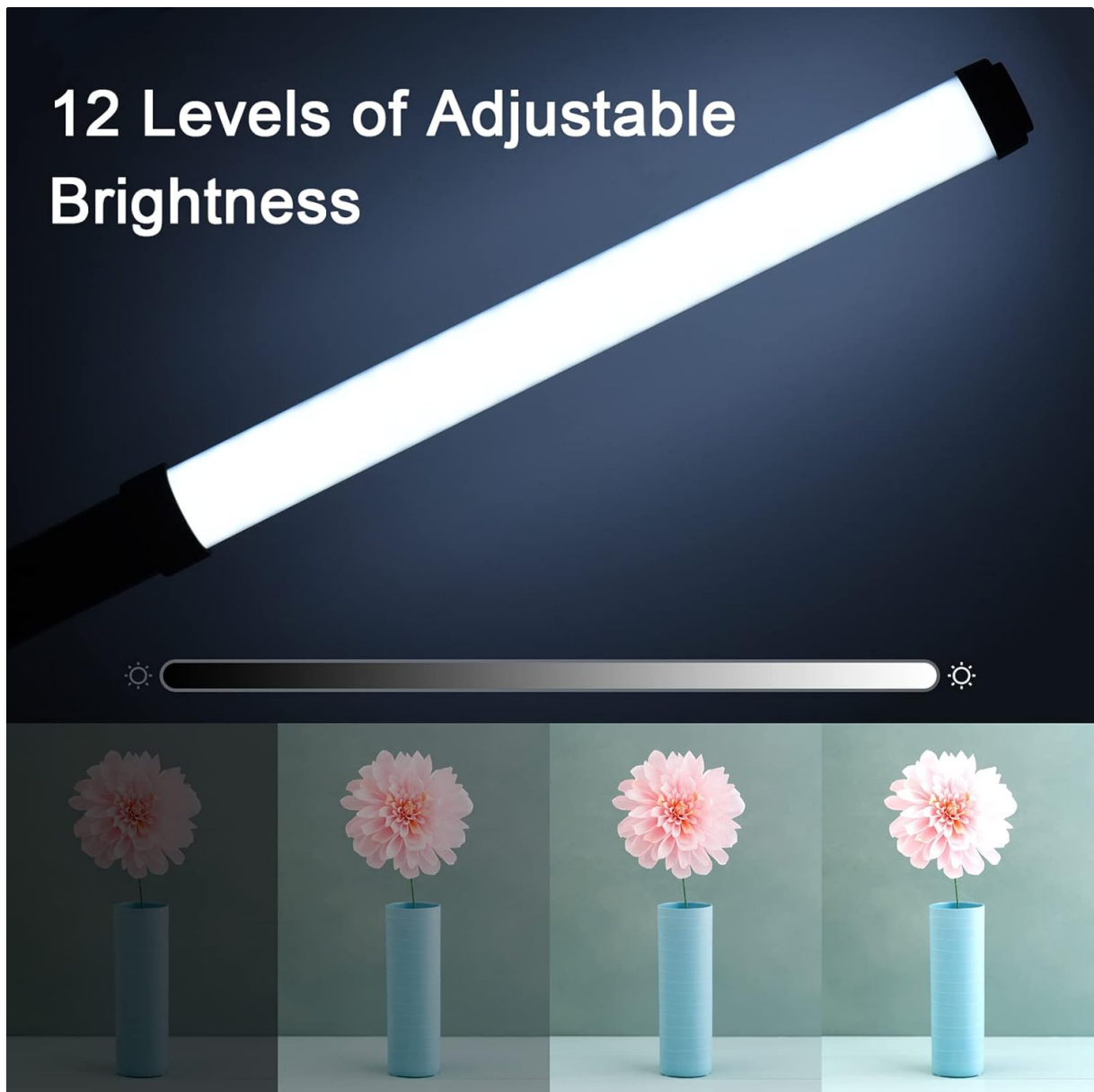
Image: Illustration of the 12 levels of adjustable brightness, demonstrating the range from dim to bright light output.