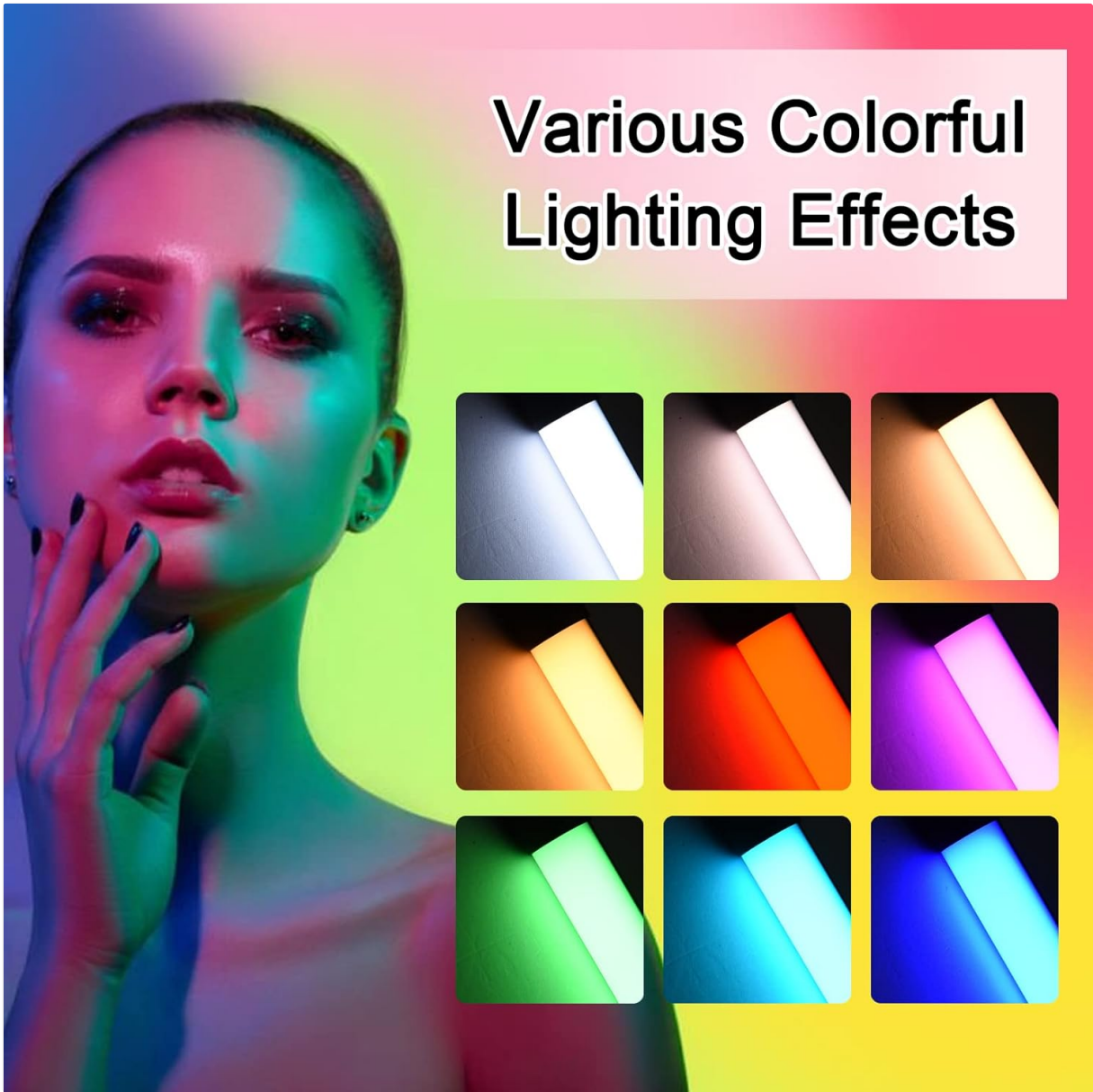
Image: A visual guide to the 7 colorful light effects available, showcasing the vibrant range of colors the light wand can produce.