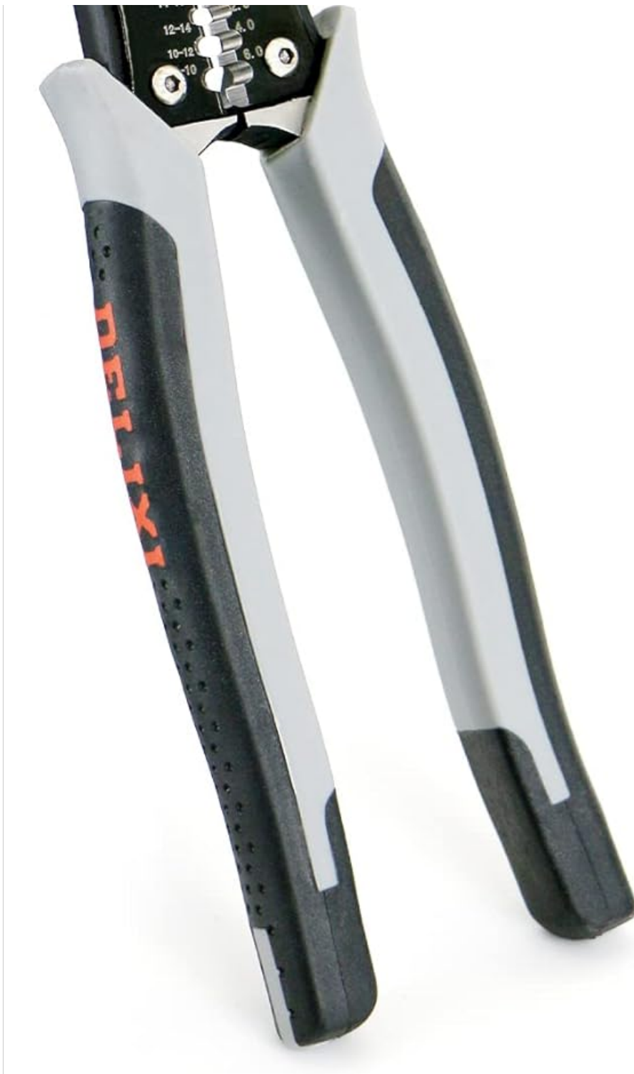
Image: DELIXI Multi-function Wire Stripping Needle Nose Pliers, showing the main tool design.