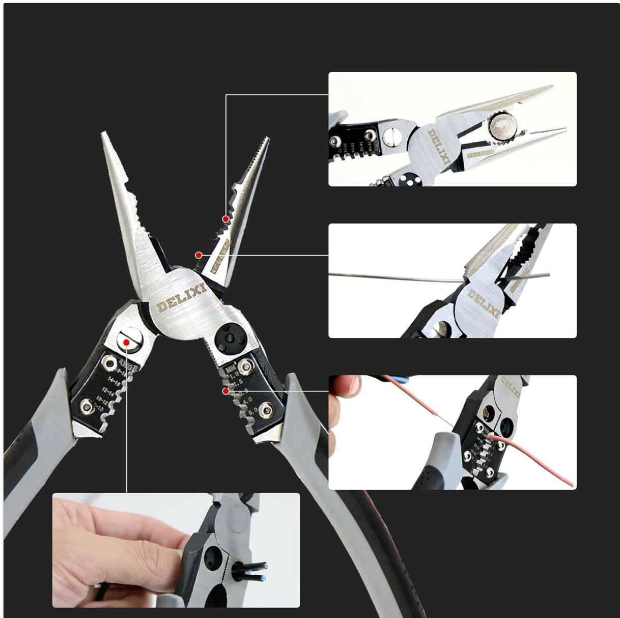
Image: A composite image illustrating the cutting, stripping, and crimping capabilities of the pliers.