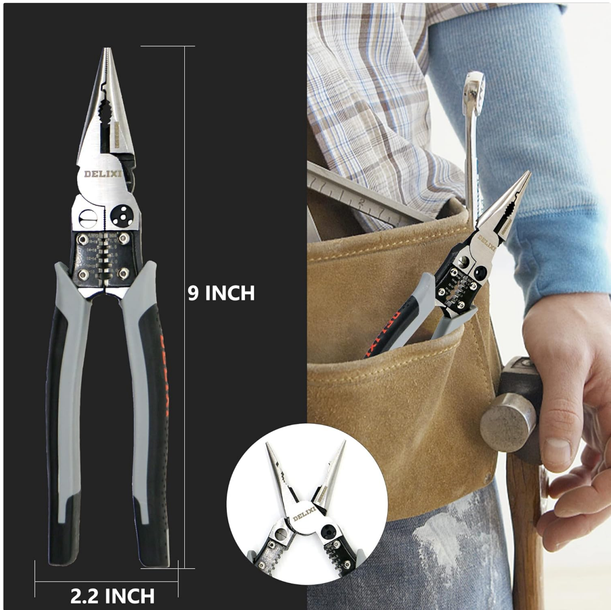
Image: The pliers shown with their key dimensions (9 inches length, 2.2 inches width).