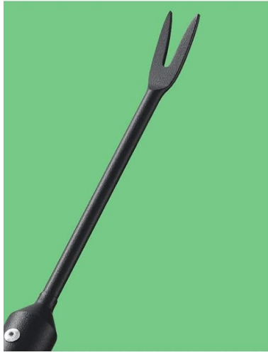
No Falling Apart