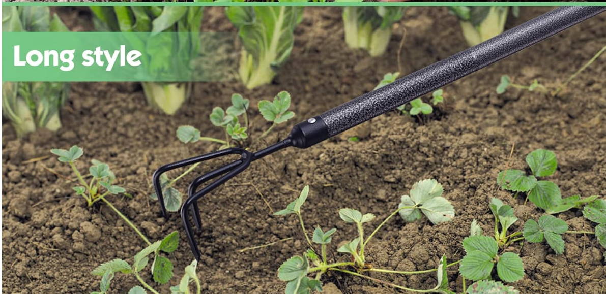
Image 3: Comparison demonstrating the use of a garden tool in its short style for close-up work and with an extended handle for reaching further without bending.