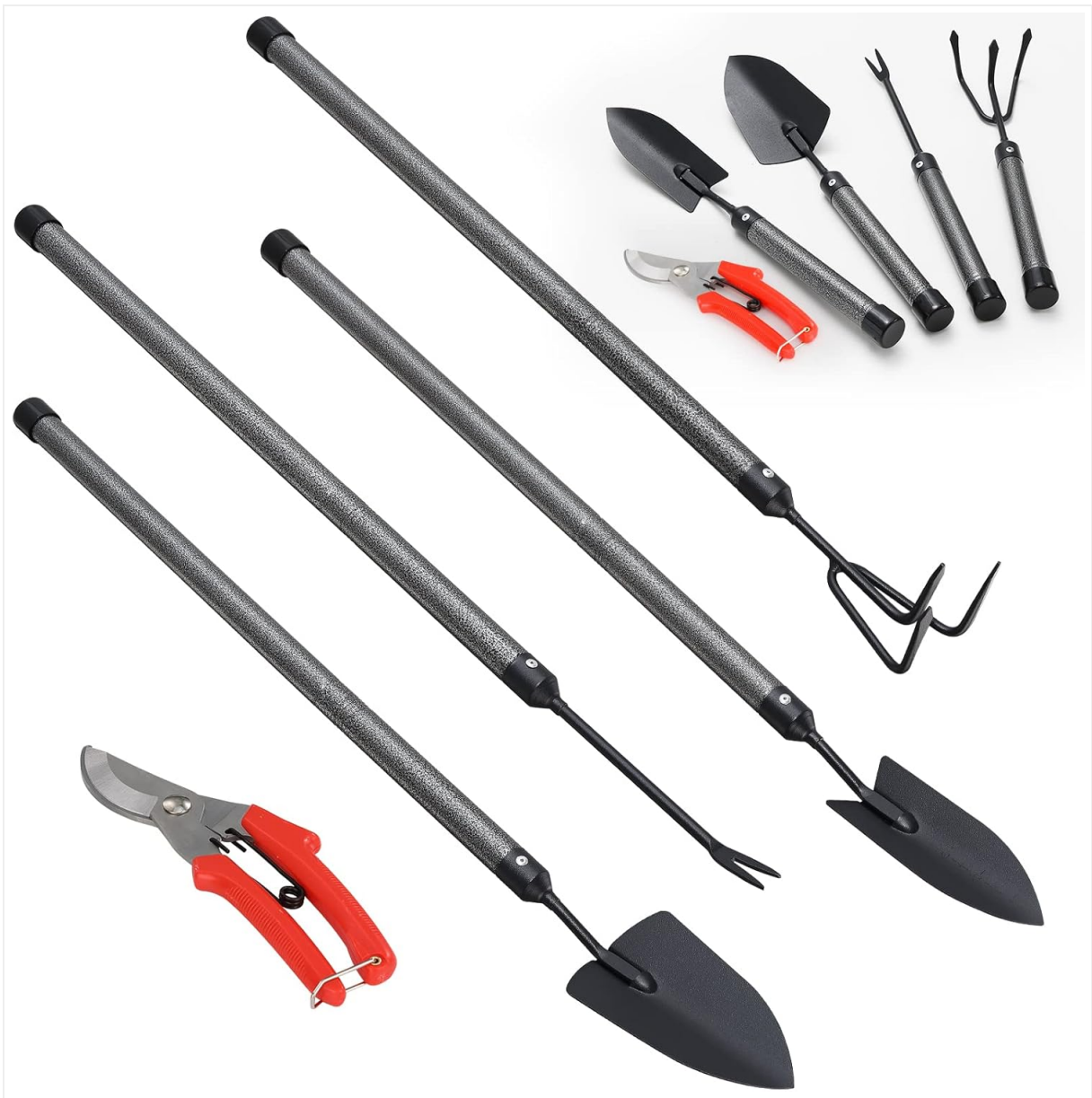
Image 1: Overview of the INFLATION 5-piece garden tool set, including the large trowel, small trowel, cultivator, weeder, pruning shears, and four extension rods.