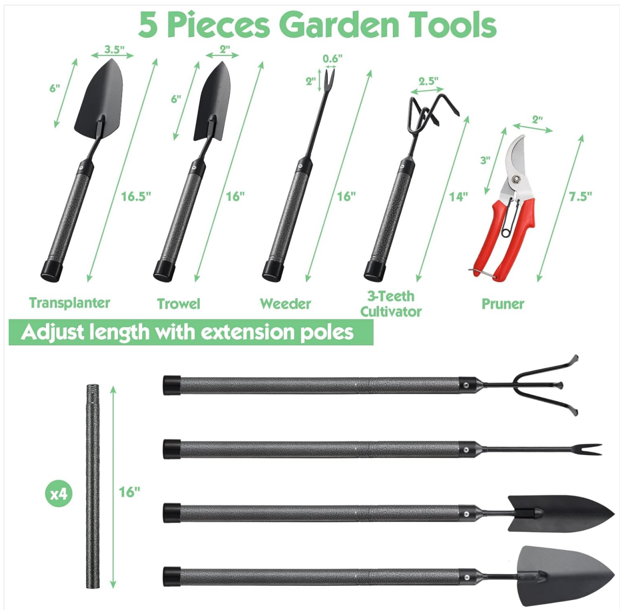
Image 6: A diagram detailing the dimensions of each individual garden tool (transplanter, trowel, weeder, 3-teeth cultivator, pruner) and the extension rods.