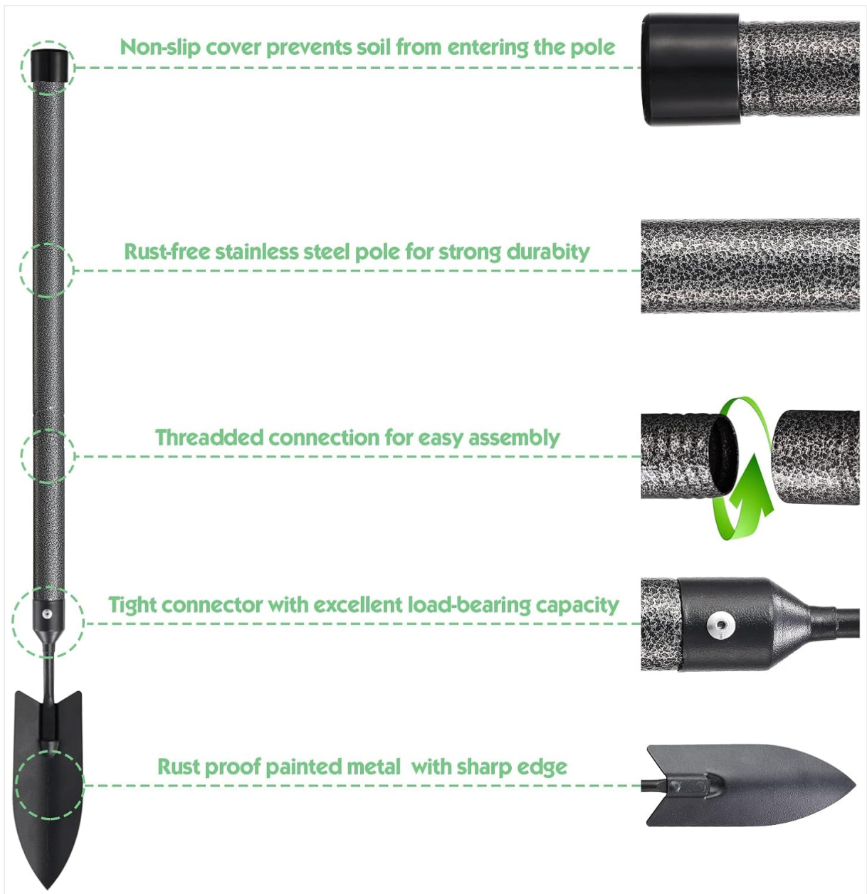
Image 2: Detailed illustration of the threaded connection for attaching extension rods to the garden tools, highlighting the rust-free stainless steel pole and tight connector.