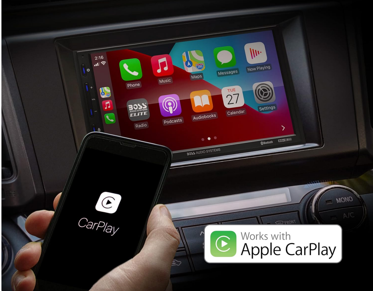
Figure 4.1: The BE920WCPA display showing the Apple CarPlay interface, with a smartphone held below it indicating wireless connectivity.