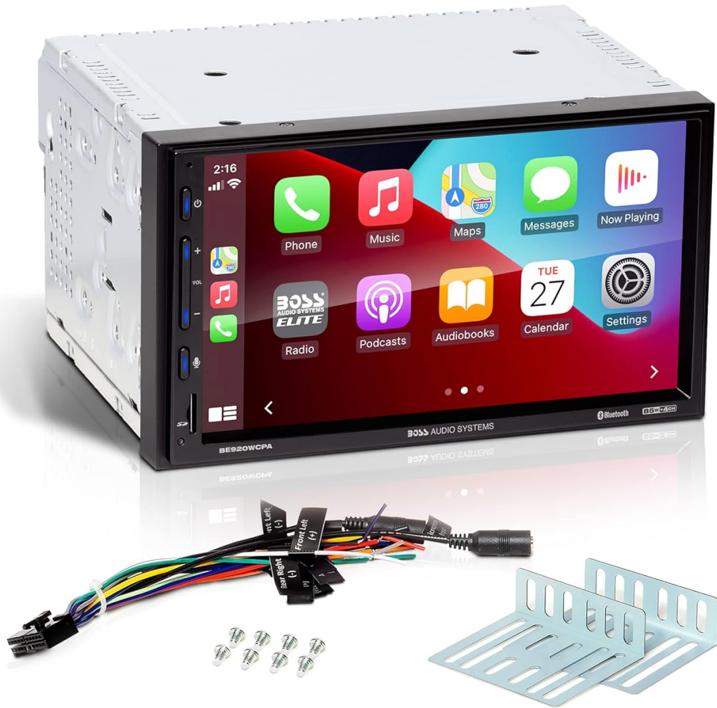
Figure 3.1: The BE920WCPA unit shown with its included accessories: wiring harness, mounting brackets, and screws.