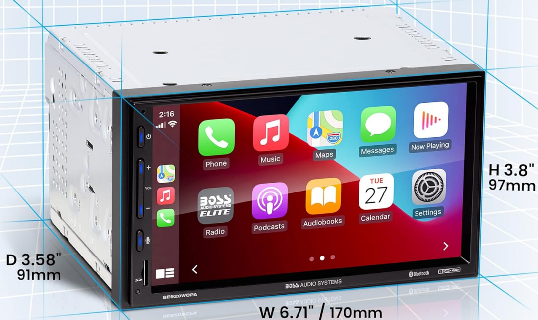
Figure 3.2: Dimensions of the BE920WCPA unit, indicating a width of 6.71 inches (170mm), height of 3.8 inches (97mm), and depth of 3.58 inches (91mm) for proper double-DIN fitment.