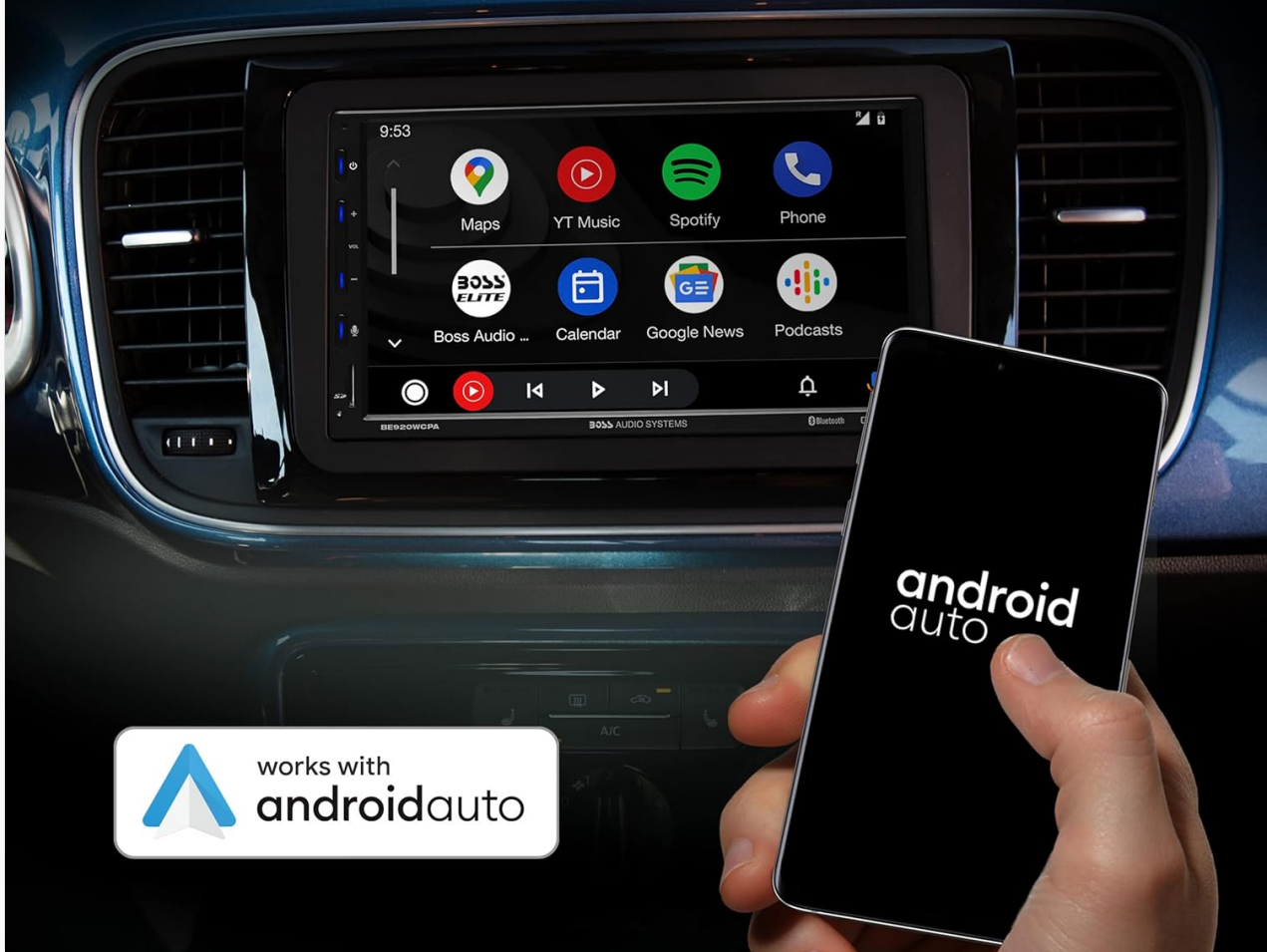
Figure 4.2: The BE920WCPA display showing the Android Auto interface, with a smartphone held below it indicating wireless connectivity.