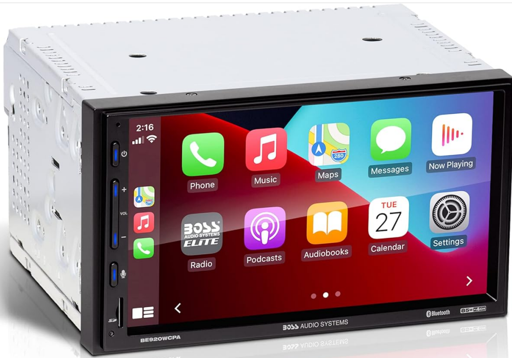
Figure 2.1: Front view of the BOSS Audio Systems Elite BE920WCPA Car Stereo, showing the 7-inch touchscreen display with a typical smartphone interface.