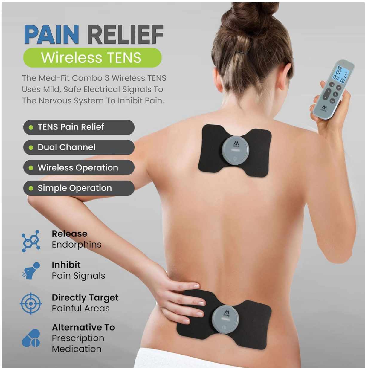
Image 1.1: Overview of Med-Fit Combo 3 Wireless TENS features for pain relief.