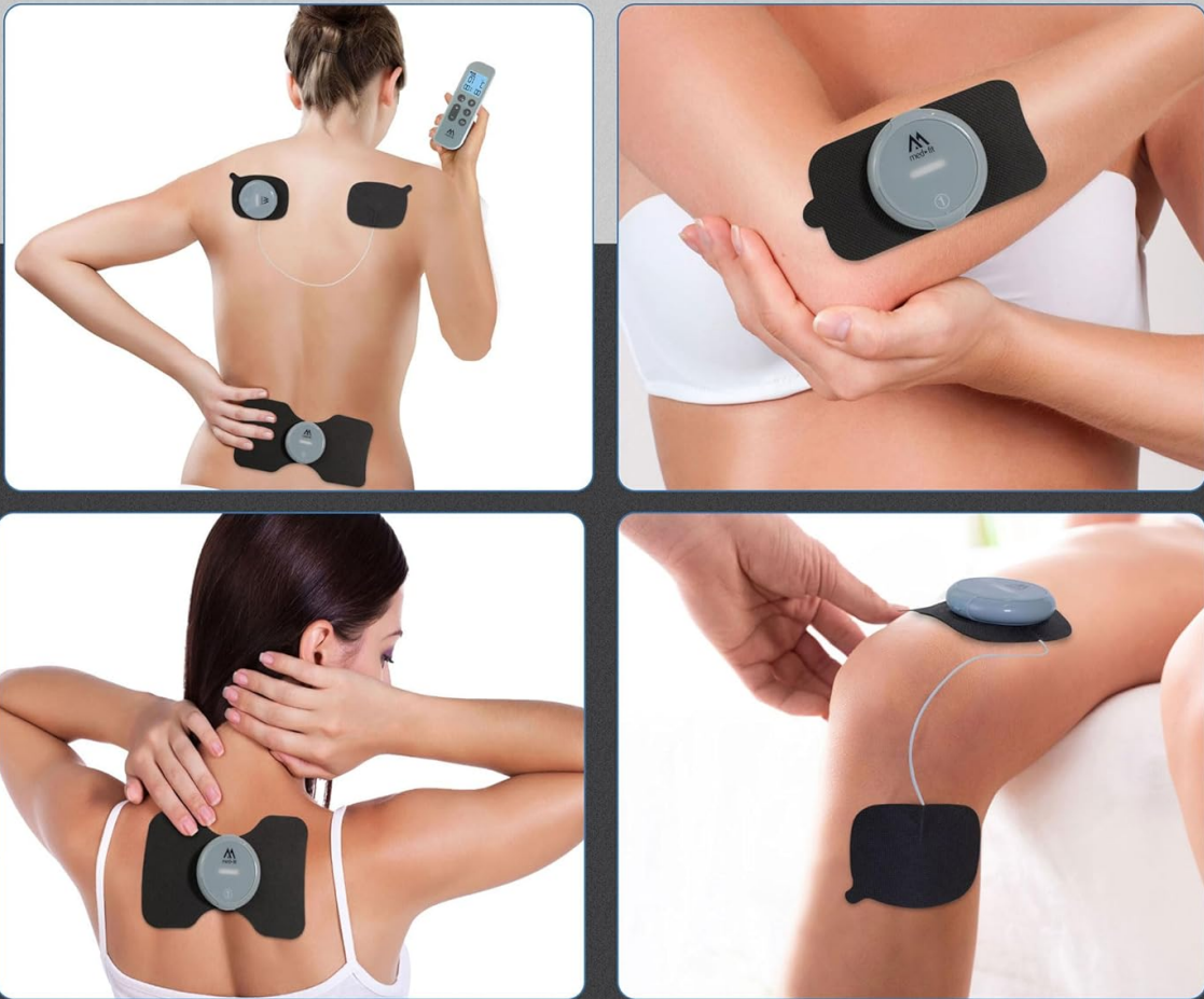
Image 7.1: Recommended electrode placement for various body areas.

Treat Two Areas Of The Body At The Same Time