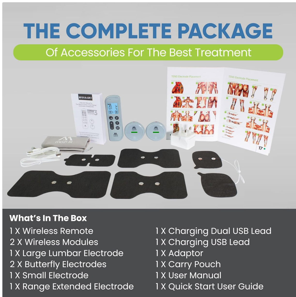
Image 3.1: The complete accessory package for the Med-Fit Combo 3.