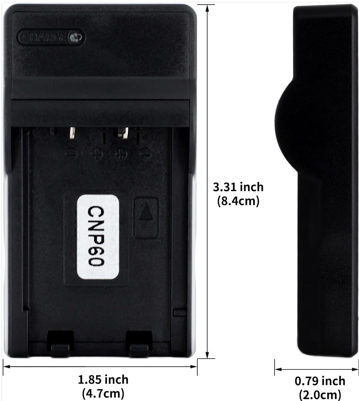
Figure 5: Physical dimensions of the Norifon NP-60 USB Charger.