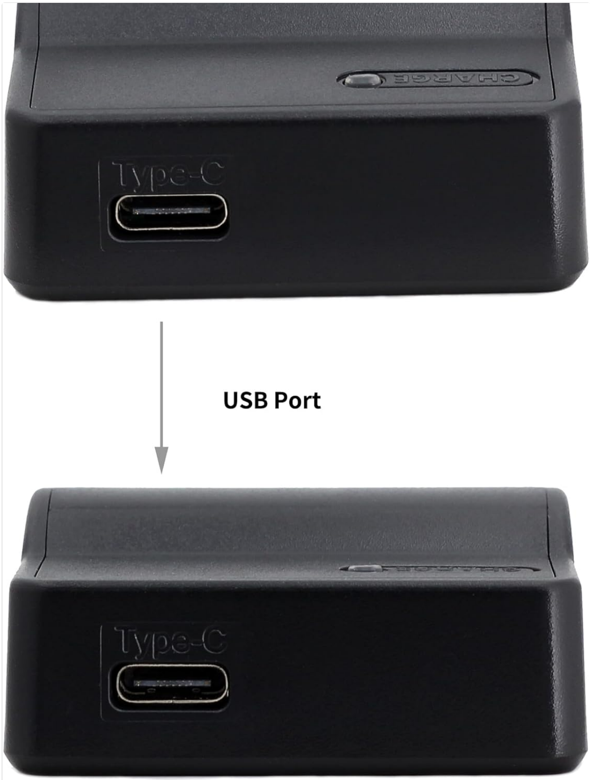
Figure 3: Detail of the Type-C USB port on the charger.