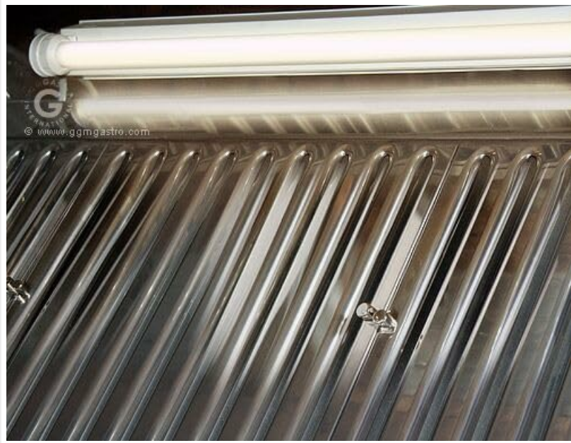
Figure 5: Close-up view of the interior lighting within the range hood.