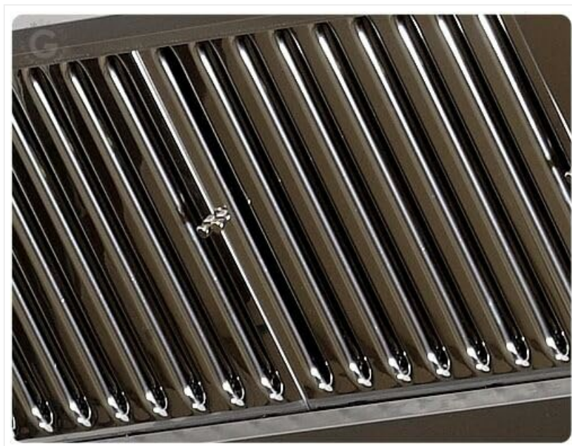
Figure 6: Close-up view of the 18/10 stainless steel grease labyrinth filters.