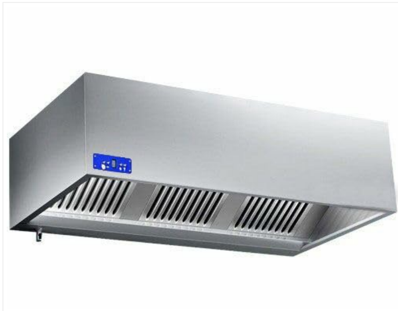
Figure 1: GGM Gastro KLS209M Box-Type Range Hood, front view.

This manual provides essential information for the safe and efficient installation, operation, and maintenance of your GGM Gastro KLS209M Box-Type Range Hood. Please read these instructions carefully before using the appliance and retain them for future reference.