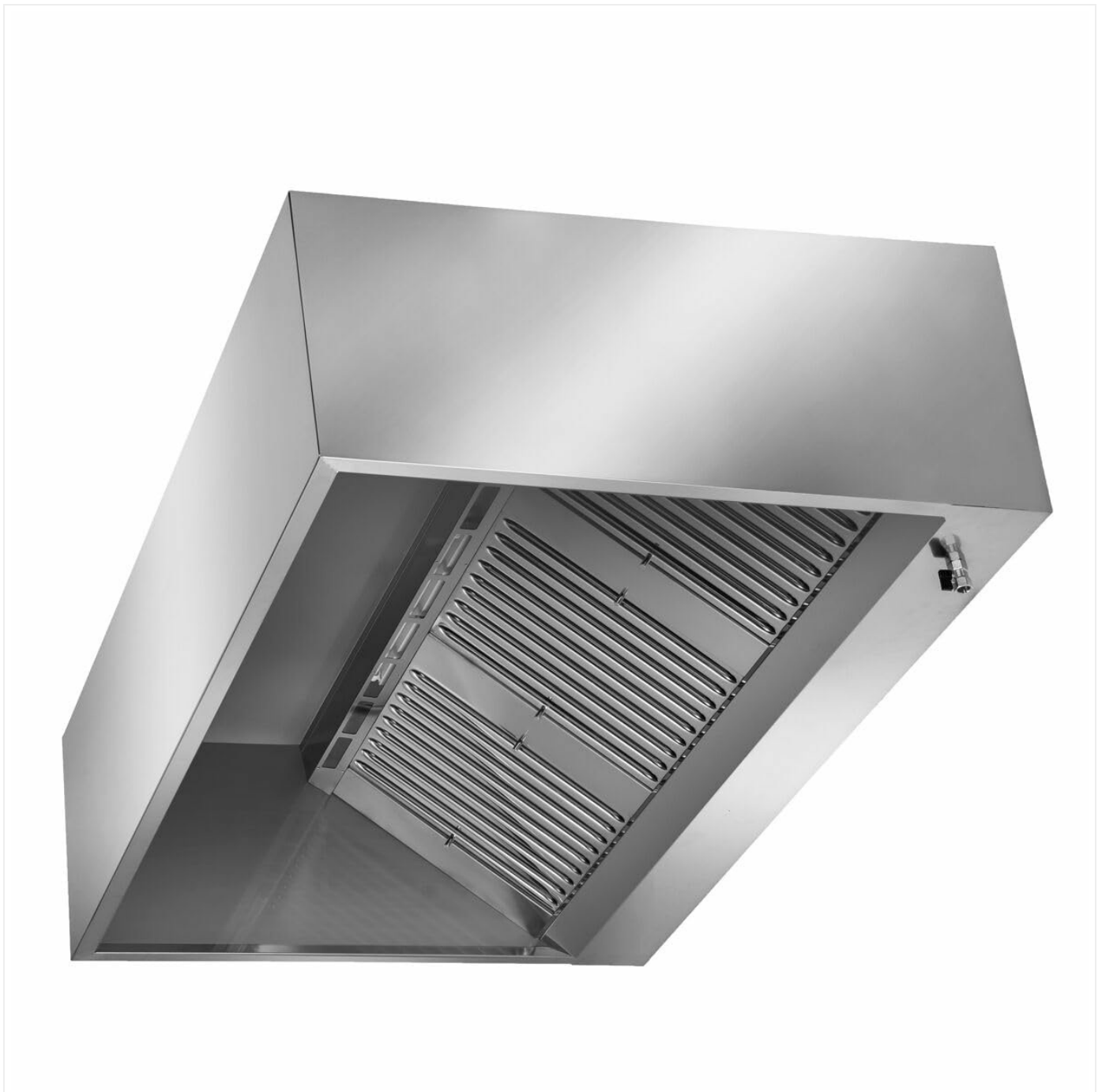
Figure 3: Internal view of the range hood, highlighting the grease collection channel and filter placement.