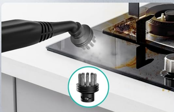
Fett und Schmutz