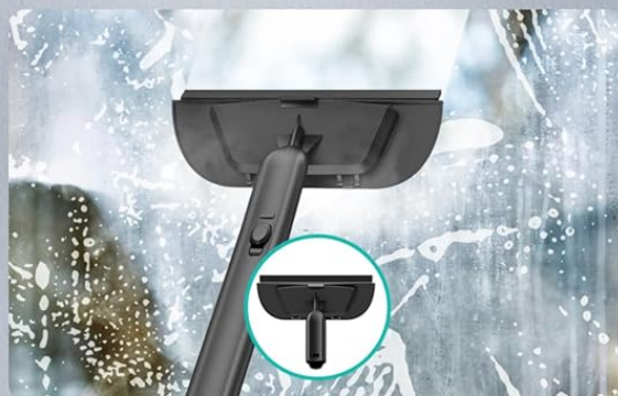
Spiegel & Glas