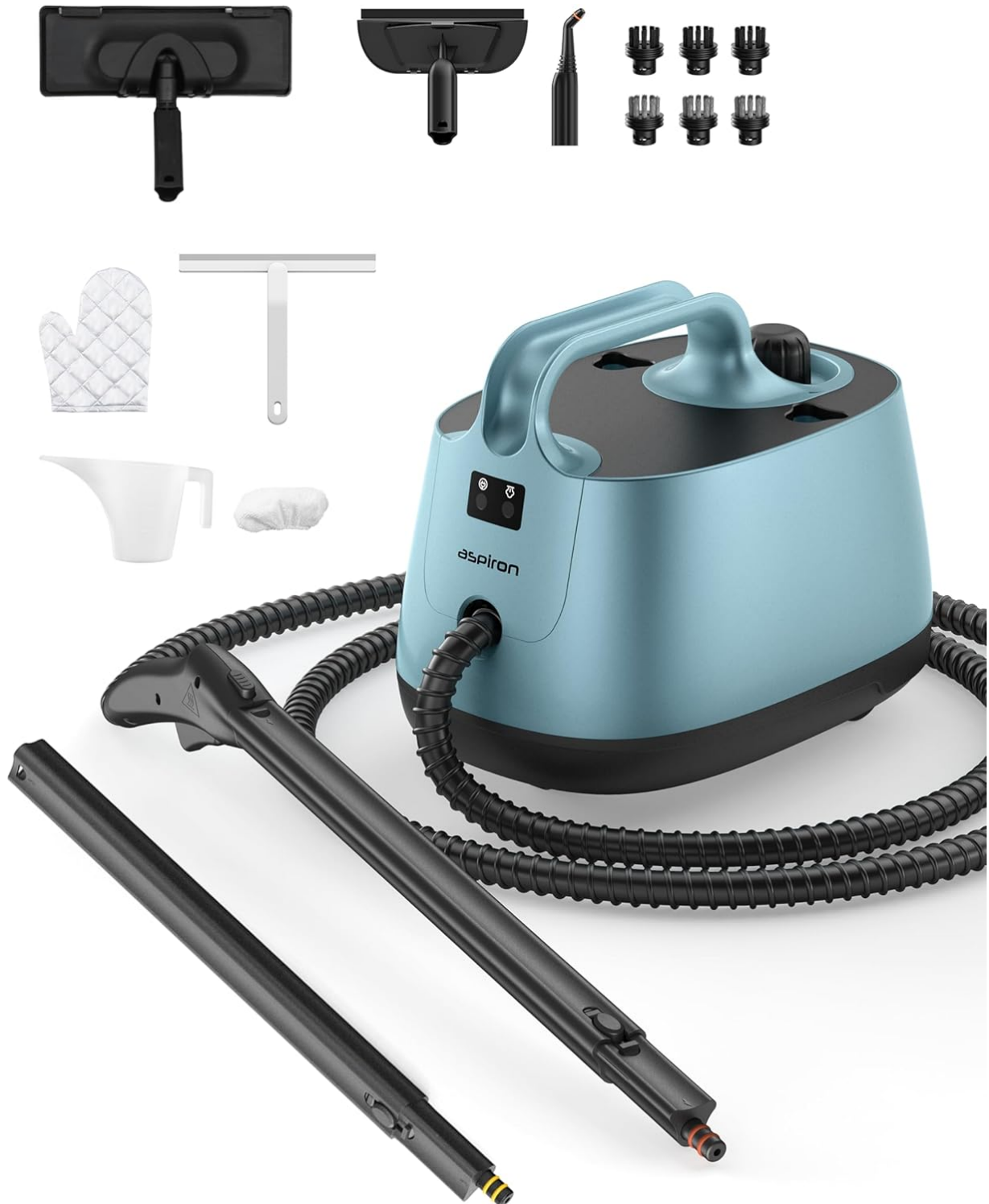
Image: The Aspiron Steam Cleaner main unit with its comprehensive set of 21 accessories, including various nozzles, brushes, and cleaning tools.