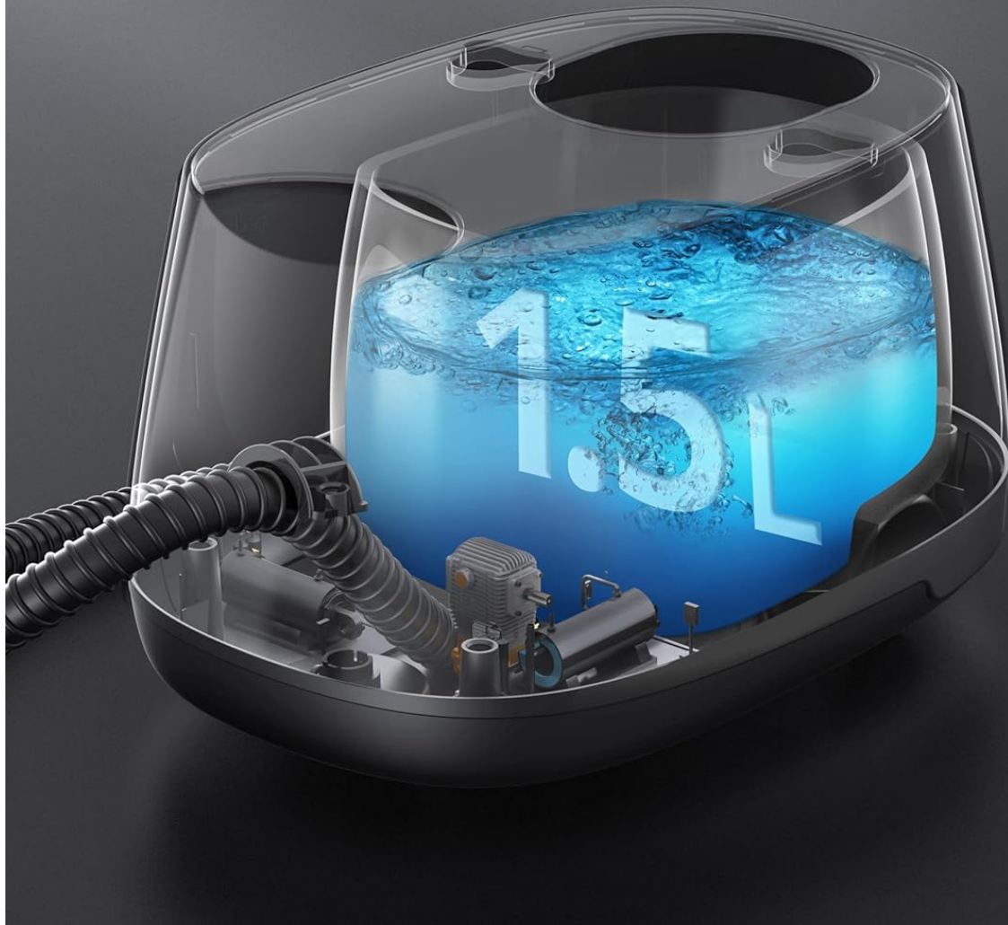
Image: Internal view of the Aspiron Steam Cleaner showing its large 1.5 Liter water tank, providing up to 50 minutes of continuous steam cleaning.