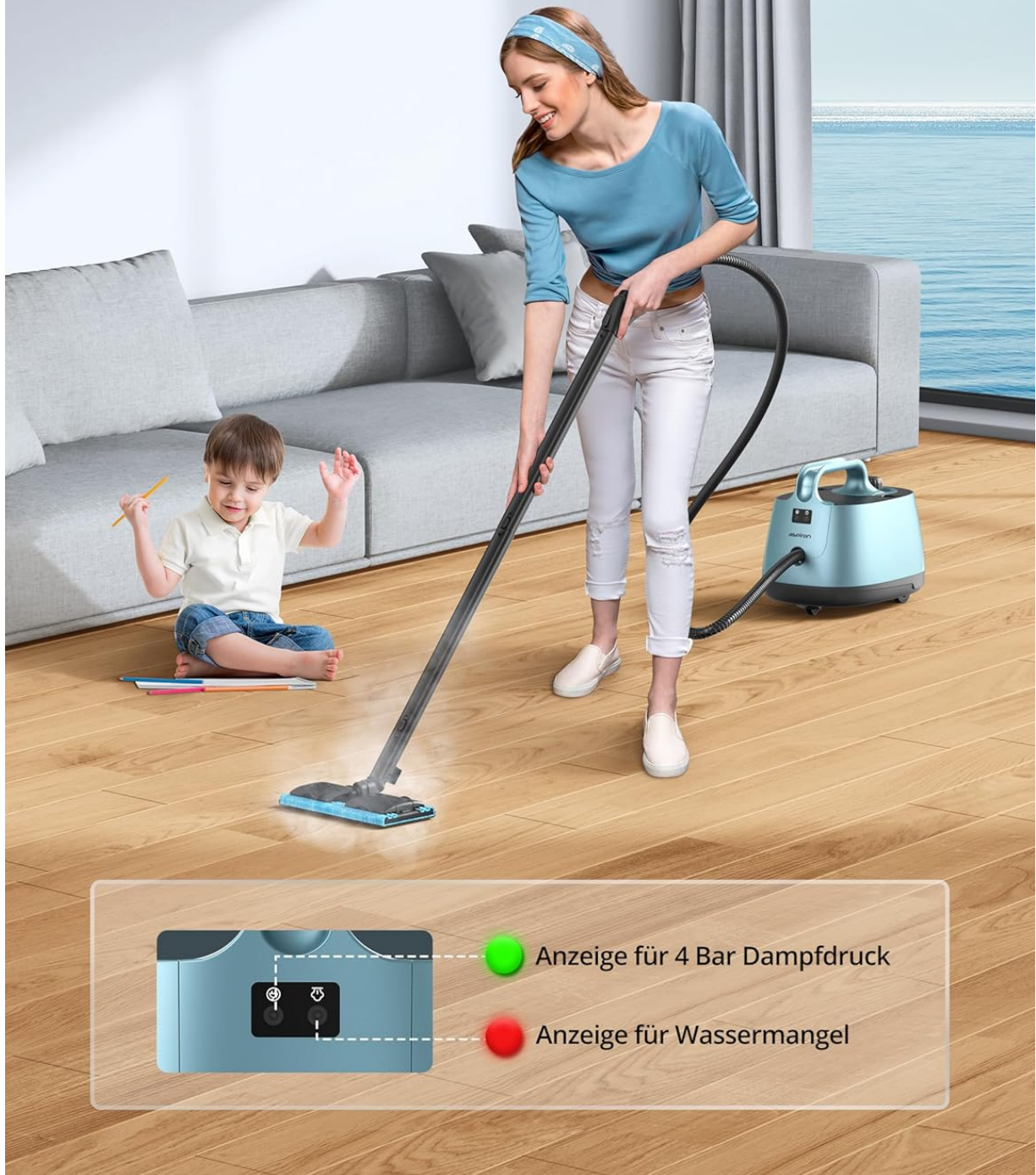
Image: Control panel showing indicators for 4 Bar steam pressure (green) and water shortage (red).