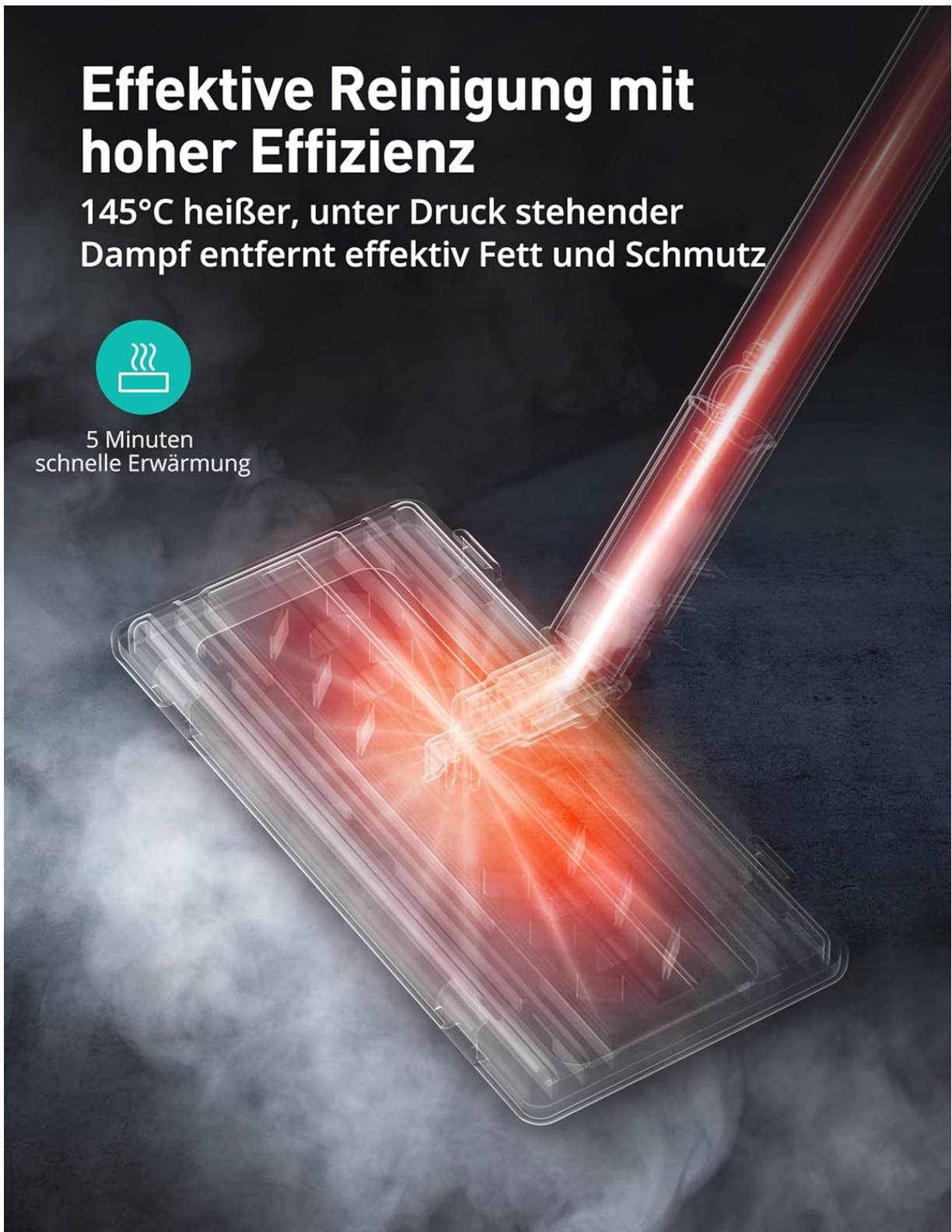
Image: The Aspiron Steam Cleaner demonstrating high-efficiency cleaning on a floor, highlighting its 5-minute quick heating capability.