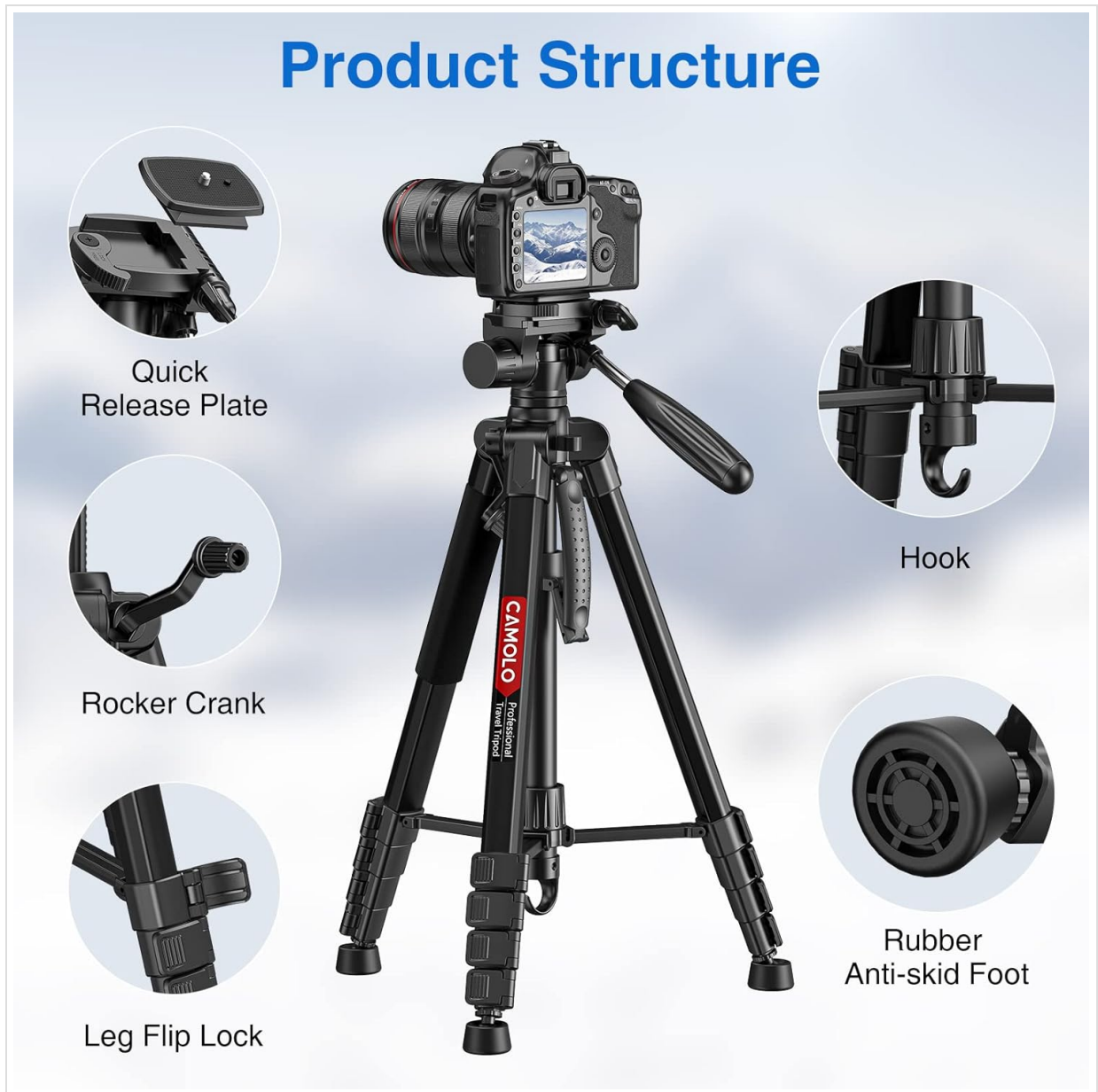
Figure 2.1: Product Structure. This image illustrates the main components of the tripod, including the quick release plate, hook for added stability, rocker crank for height adjustment, leg flip locks, and rubber anti-skid feet.