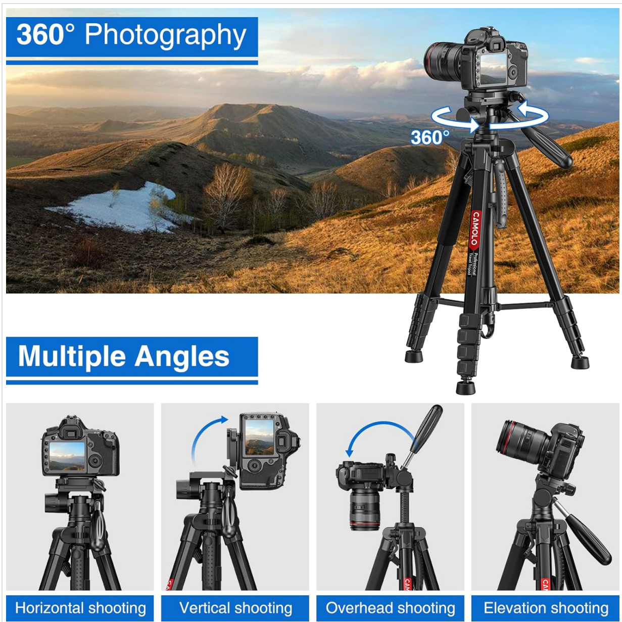
Figure 4.1: Multiple Shooting Angles. This image highlights the tripod's flexibility, allowing for 360° panoramic shots and various other angles including horizontal, vertical, overhead, and elevation.