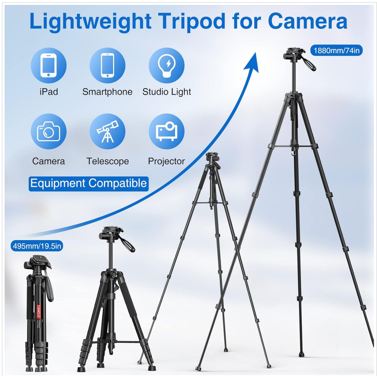
Figure 3.1: Adjustable Height and Compatibility. This image demonstrates the tripod's height range and its compatibility with various devices, including smartphones, cameras, and projectors.