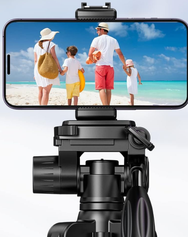
Figure 4.2: Universal Phone Holder. This image demonstrates the phone holder's use with a smartphone and its cold-shoe mount for attaching additional accessories.