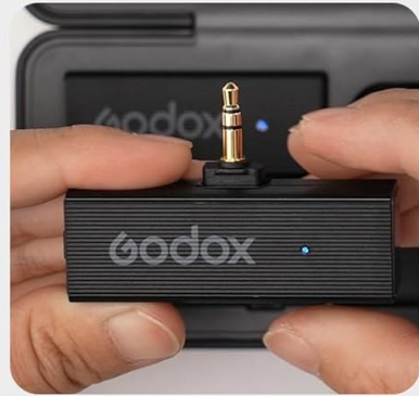
Image: Illustrates the versatility of adapters for connecting to different devices.