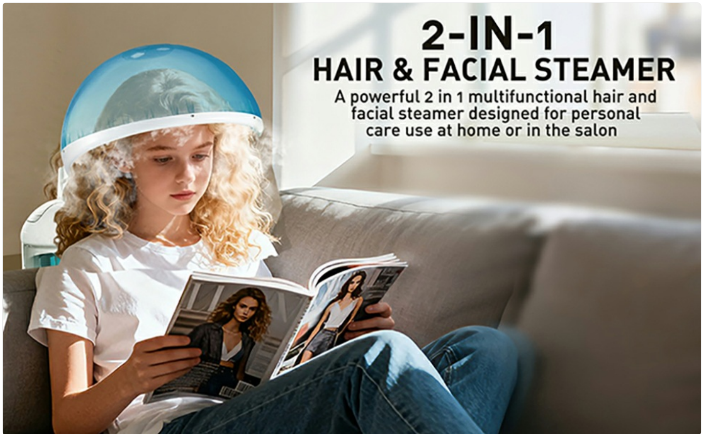
Figure 5: The 2-in-1 Hair & Facial Steamer used for hair conditioning.