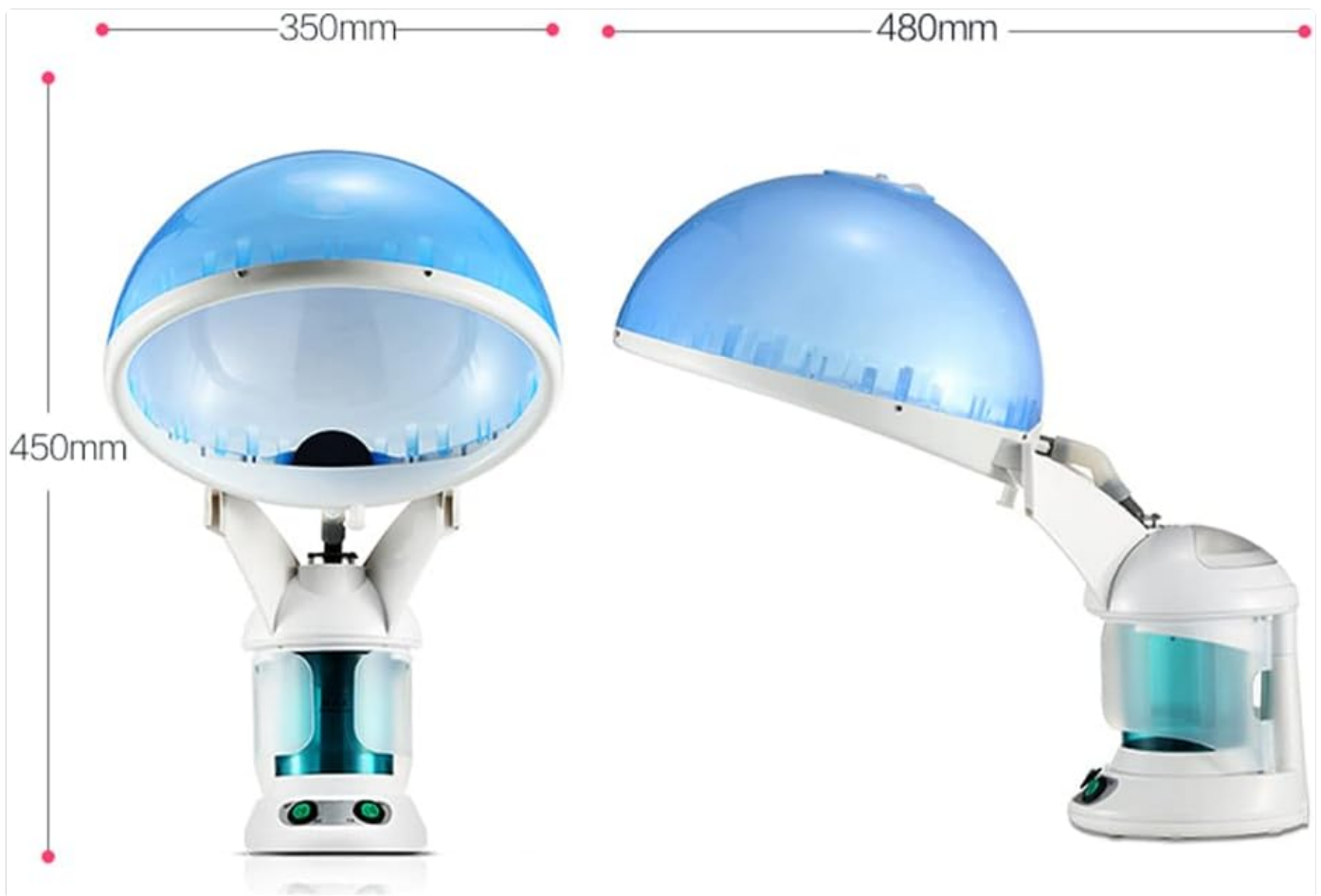
Figure 7: Steaming is beneficial for oily, normal, and dry skin types.