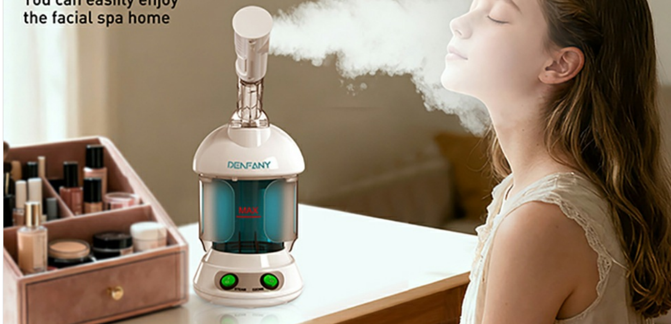
Figure 9: Enjoying a nano facial steam at home.

You can easily enjoy the facial spa home