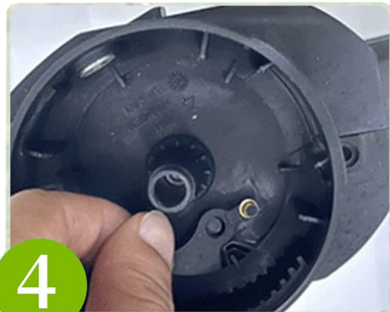
Figure 2: This image highlights the compatibility of the replacement lever with Black & Decker ST7700 Type 1 and ST7000 Type 1 trimmers, along with part numbers 598437-00, 59843700, and 714394862341.