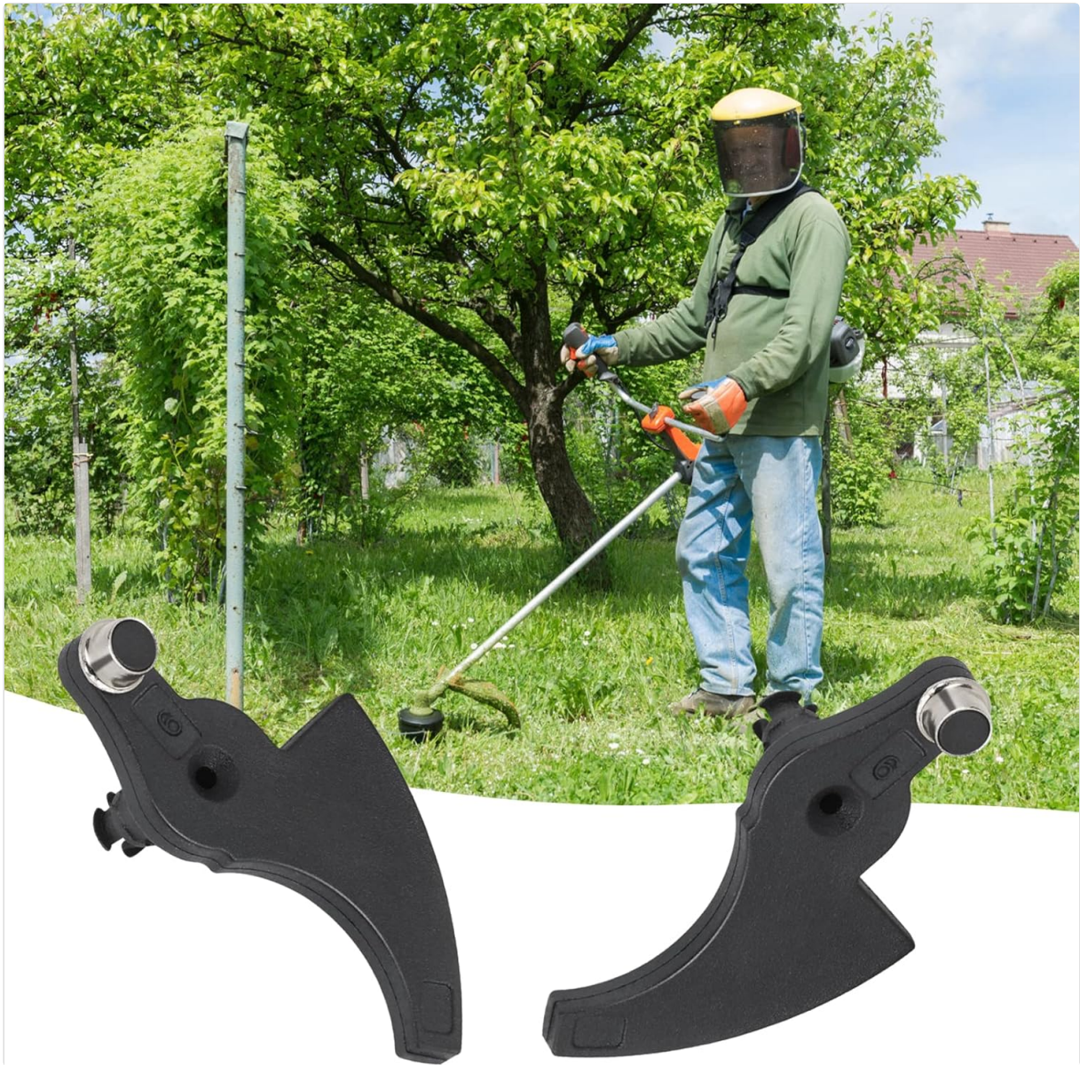
Figure 5: A close-up view of a trimmer head, pointing out the features of the replacement lever, including its wear-resistant and durable material, auto-feed function, and ease of installation.