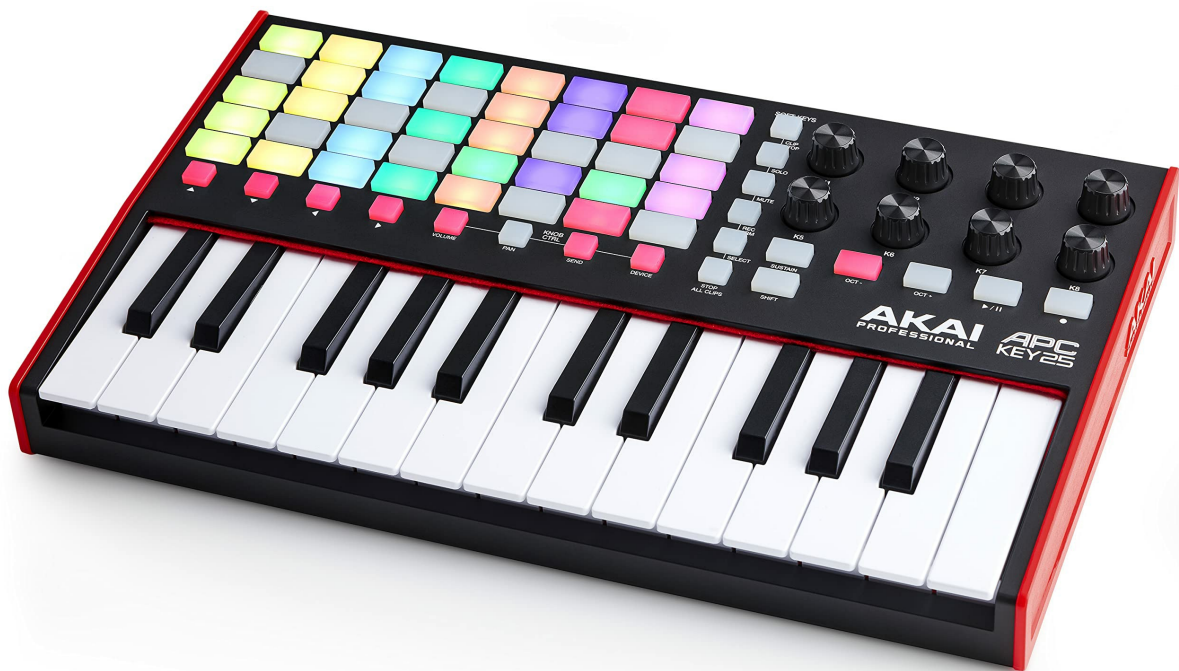
Image: The Akai Professional APC Key 25 MK2 connected to a laptop, demonstrating its plug-and-play USB connectivity.