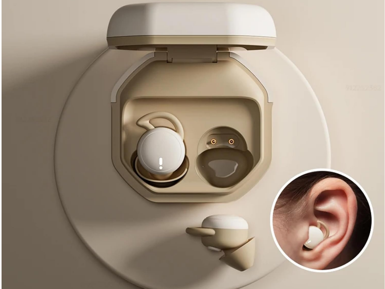
Image 1.1: The Xmenha Invisible Sleep Earbuds shown in their charging case and discreetly worn in an ear, highlighting their compact design.

· Excellent sound quality · ExtraLongEndurance · UltrathinMini