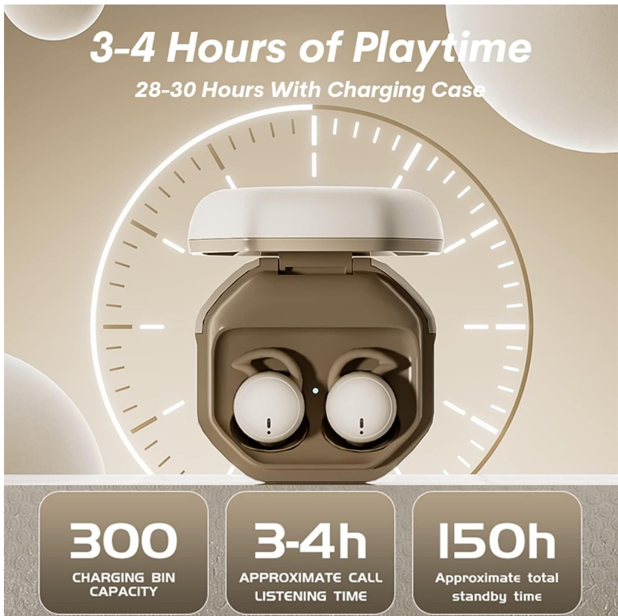
Image 2.1: The charging case displaying battery information, indicating 3-4 hours of playtime for earbuds and 28-30 hours total with the case.