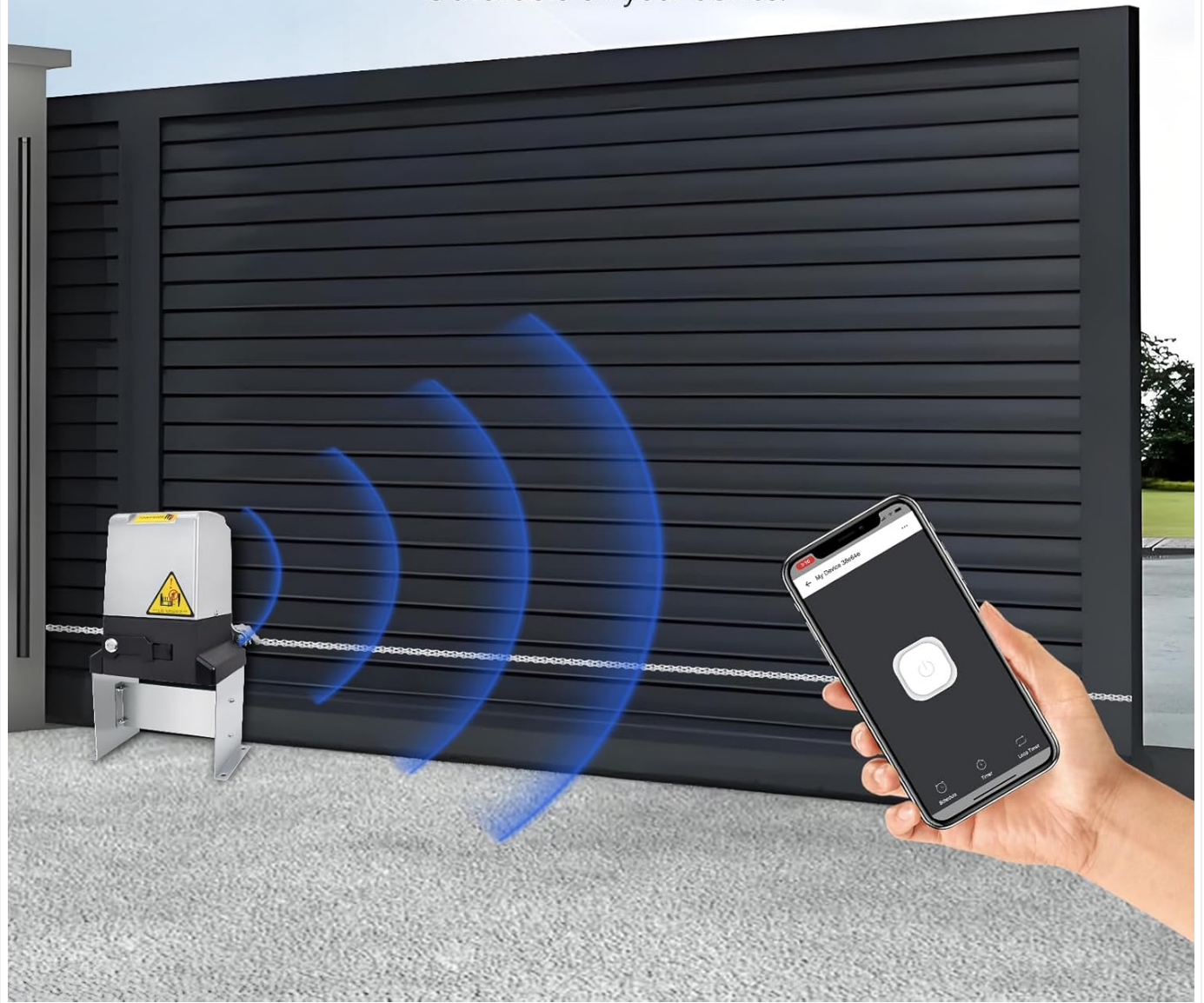
Image 6.2: Controlling the gate opener via the smartphone application.

Open gates by your phone as long as internet is available on your device.