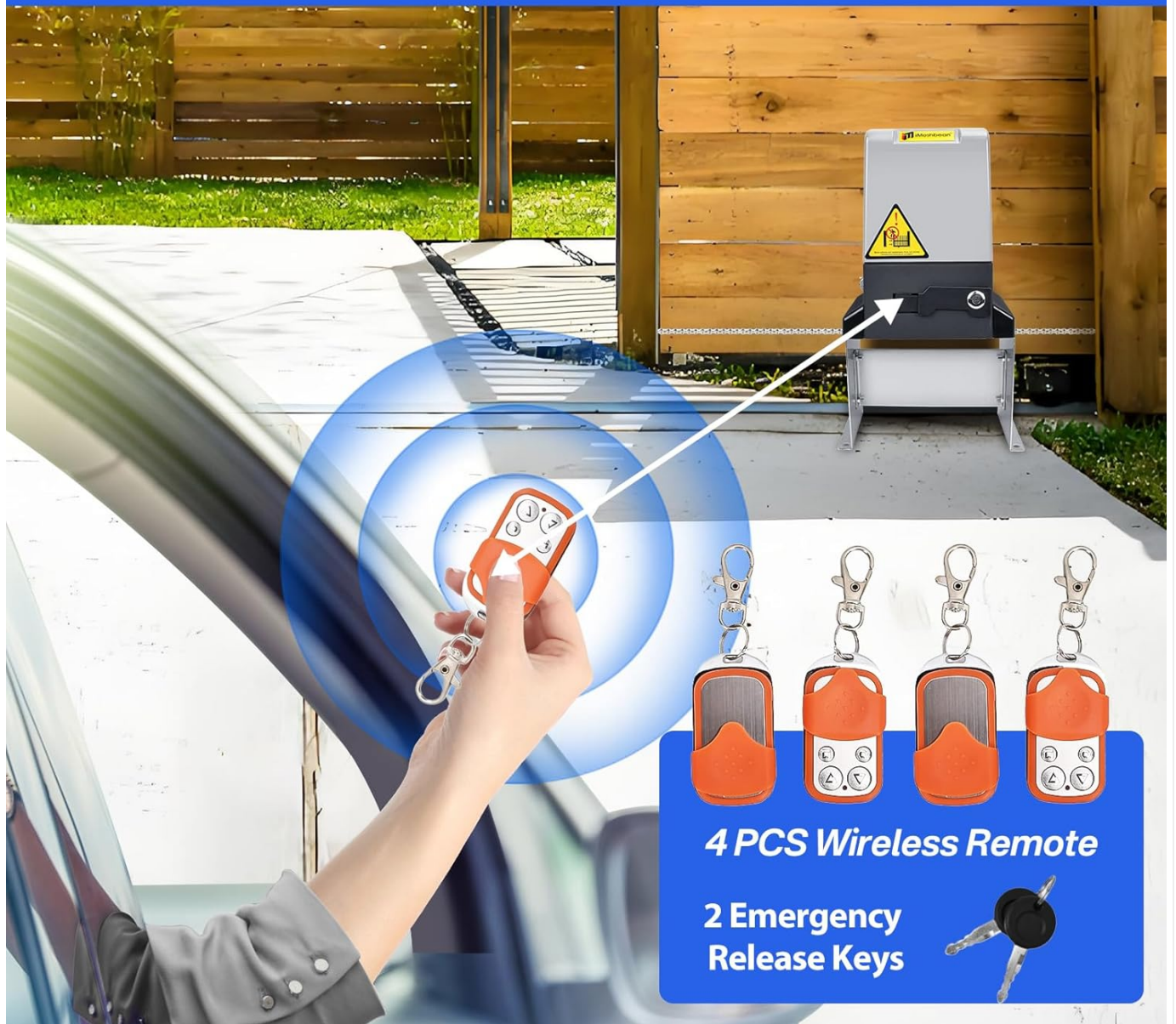
Image 6.1: Operating the gate with one of the four included remote controls.

Can open doors but no need to get off your car ,max 100ft