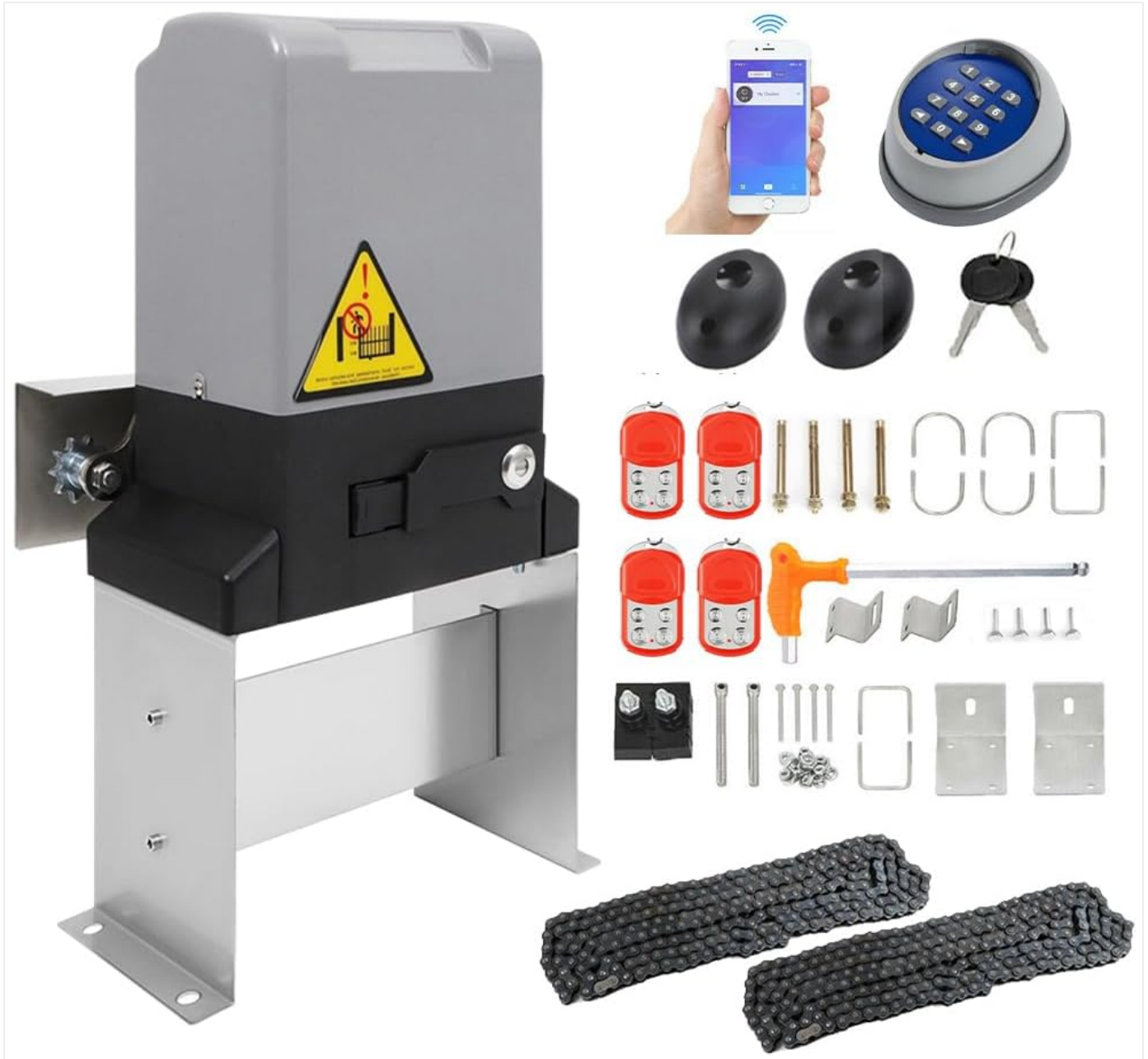
Image 3.1: Complete package contents of the iMeshbean Automatic Sliding Gate Opener, including the main unit, remote controls, wireless keypad, infrared sensors, manual release keys, and chain.