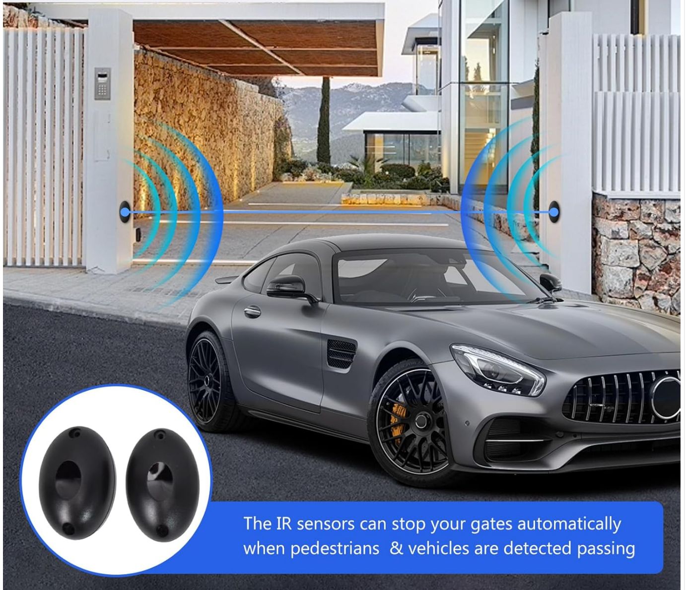
Image 5.1: Illustration of smart obstruction detection using infrared sensors to prevent accidents.