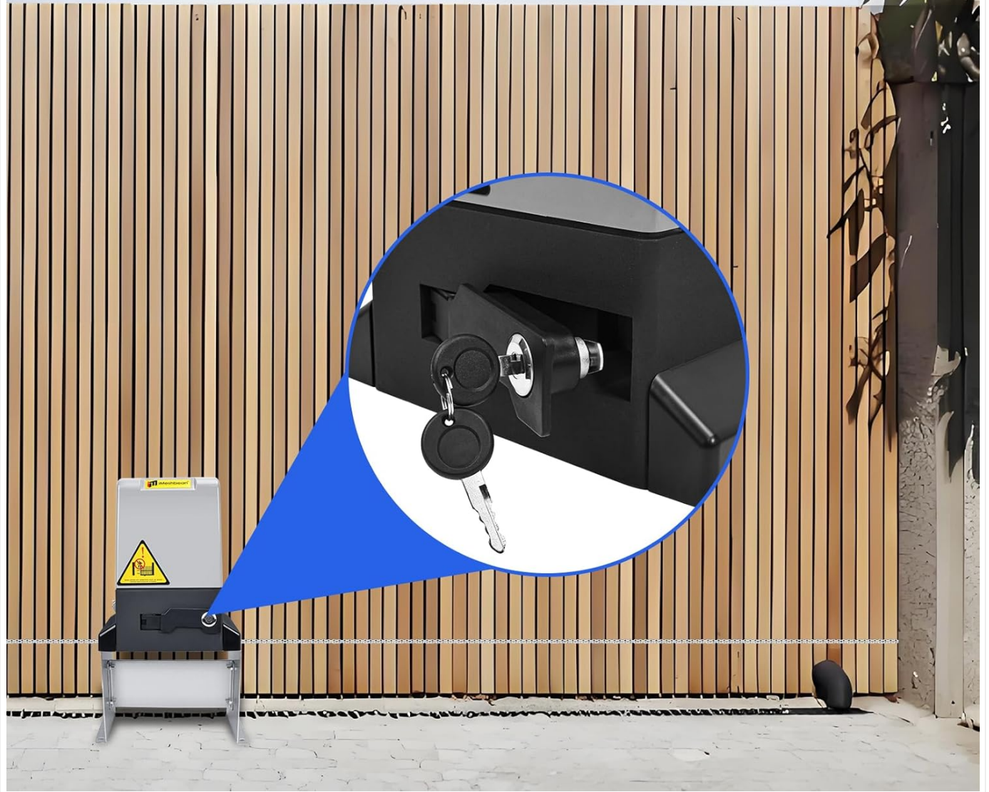
Image 6.3: Manual release mechanism for operating the gate during power failure.

Comes with 2 manual release keys in case of power outage or when you lose your remote.