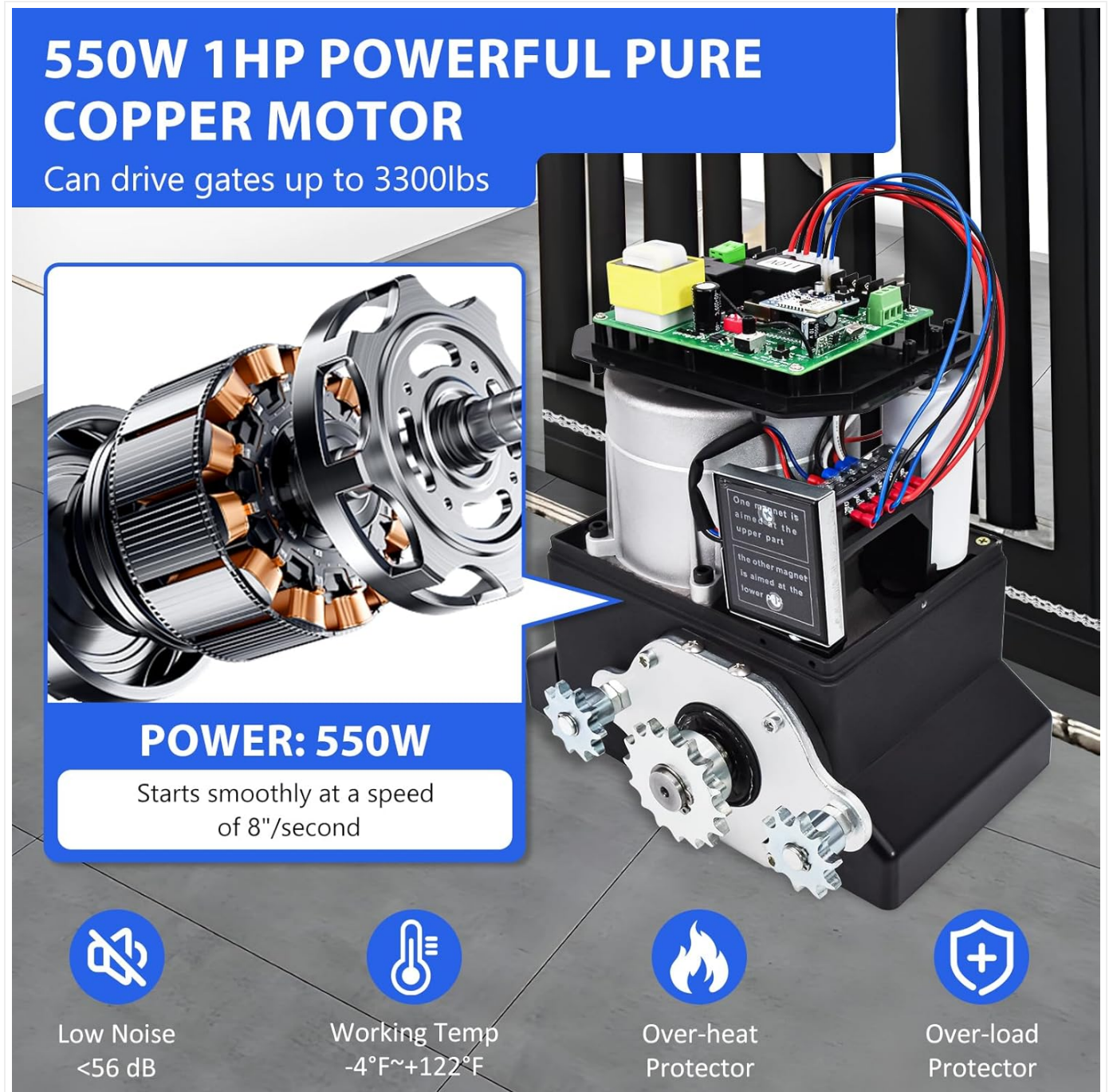
Image 4.1: Detailed view of the 550W pure copper motor, highlighting its power and protective features.