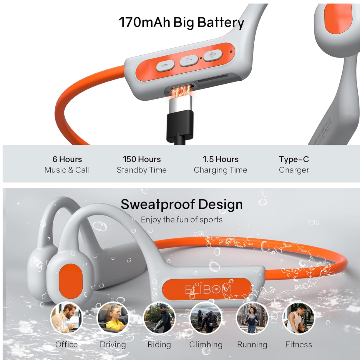
Image: ELIBOM BC Lite headphones connected to a Type-C charging cable, illustrating the charging process and battery specifications.