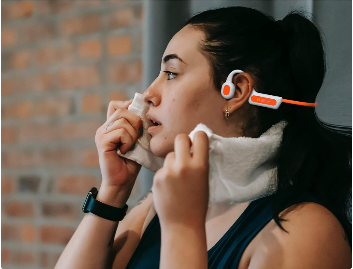
Image: A woman wearing the ELIBOM BC Lite headphones during a workout, demonstrating the secure and comfortable fit.

26.5g Ultra-light Body Ear-hanging, not easy to fall off