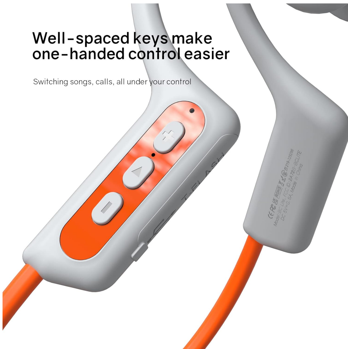
Image: Detailed view of the control buttons on the ELIBOM BC Lite headphones.

Switching songs, calls, all under your control