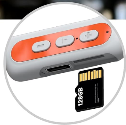
Image: A user demonstrating the insertion of a Micro SD card into the ELIBOM BC Lite headphones for MP3 playback.

Insert the micro SD card to get your favorite songs No need to carry your phone, no burden for running and fitness