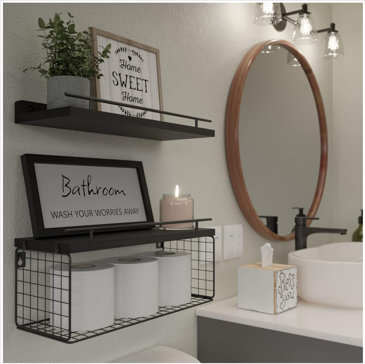
Image: The floating shelves installed in a bathroom, showcasing their use for storing toiletries, toilet paper, and decorative items above a toilet.