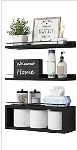
Image: A close-up view of the floating shelf, highlighting the solid wood construction and the integrated metal guardrail designed to prevent items from falling.

Video: An official WOPITUES video demonstrating the assembly and installation process of the floating shelves and bathroom sign. It shows how to attach the metal components to the wooden boards and then mount them on the wall.