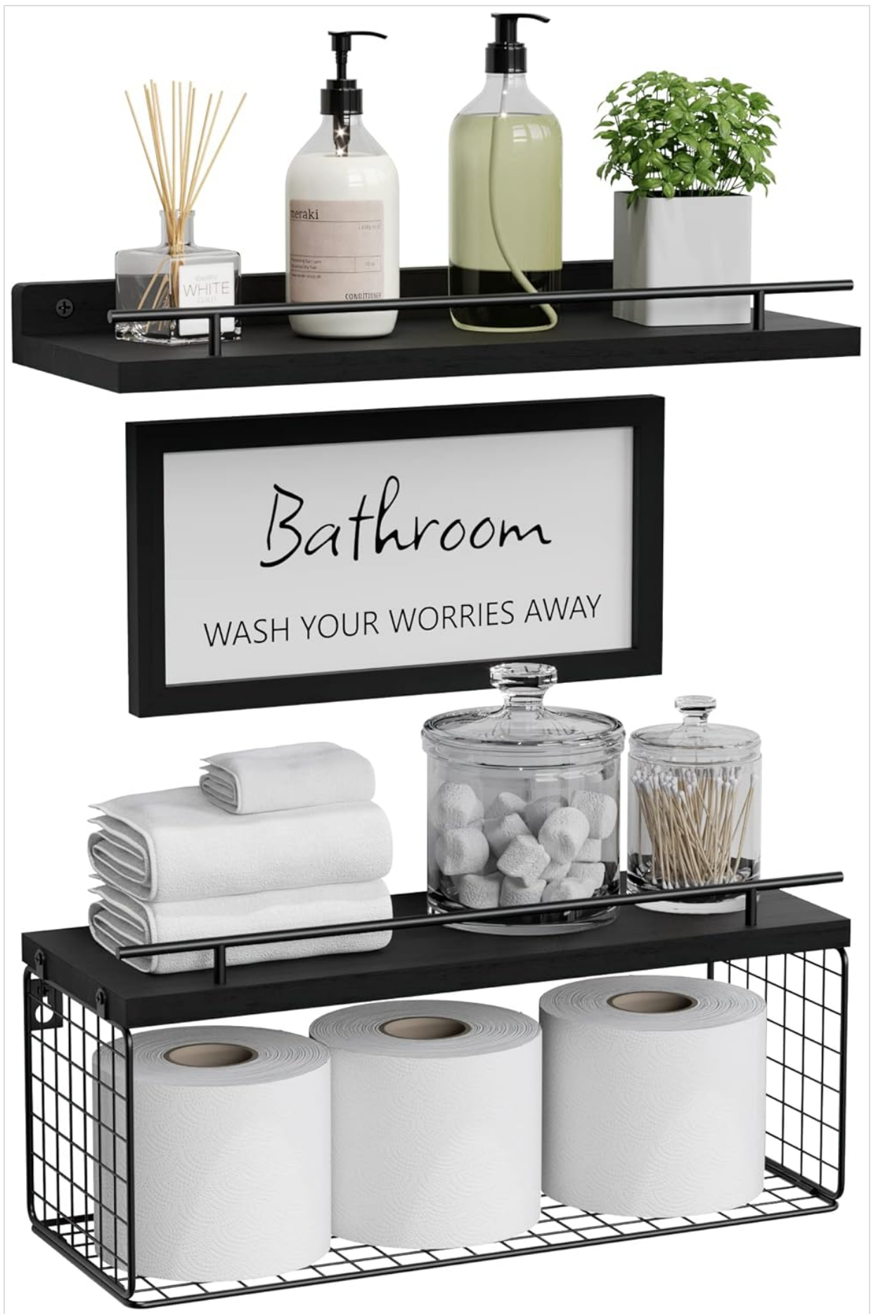
Image: The WOPITUES Floating Shelves set, featuring one shelf with a metal guardrail, one shelf with a metal basket for toilet paper, and a "Bathroom Wash Your Worries Away" sign, all in black finish.