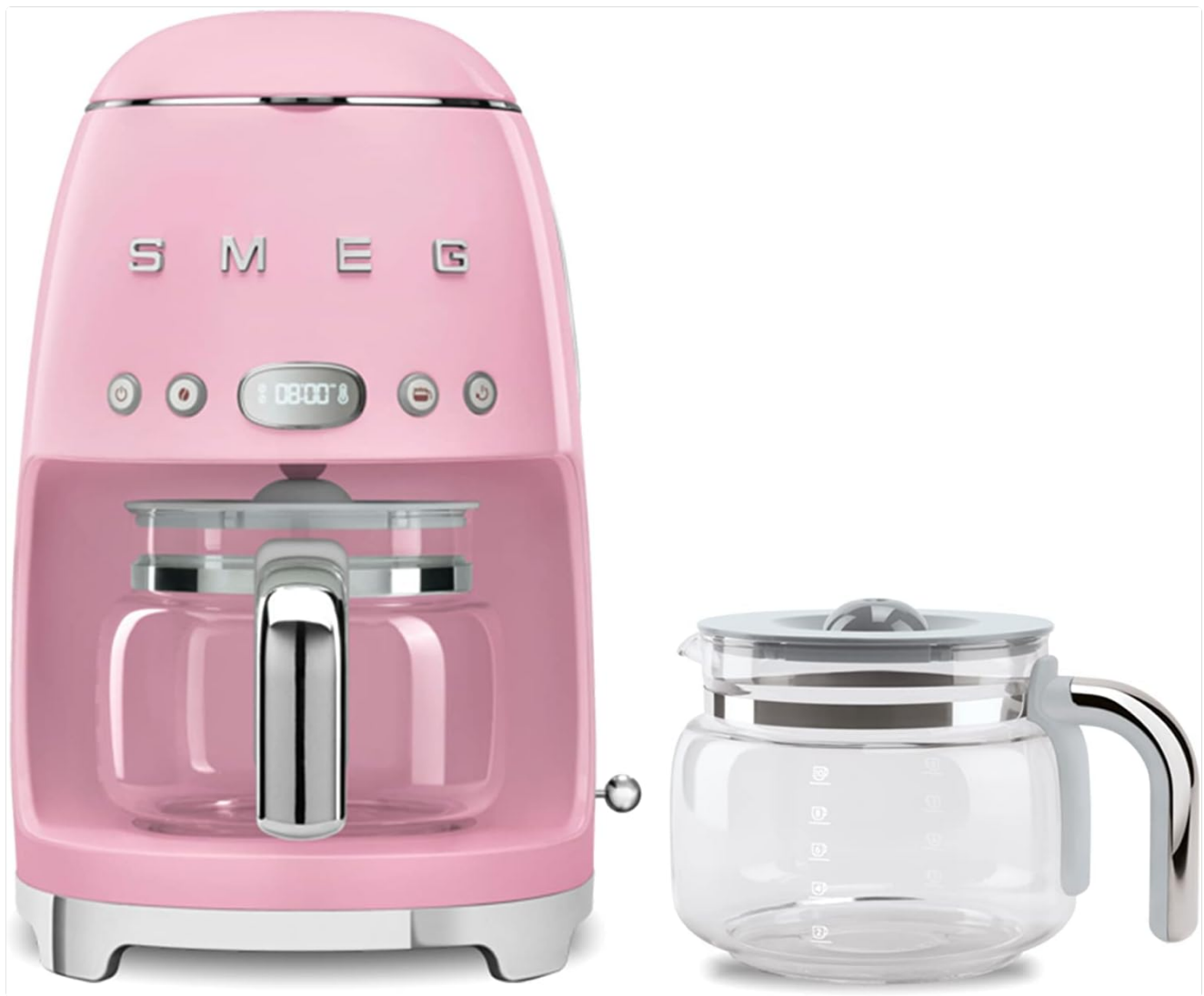
Image: The Smeg DCF02 Drip Coffee Maker in pink, shown alongside an additional DCFC01 glass carafe.