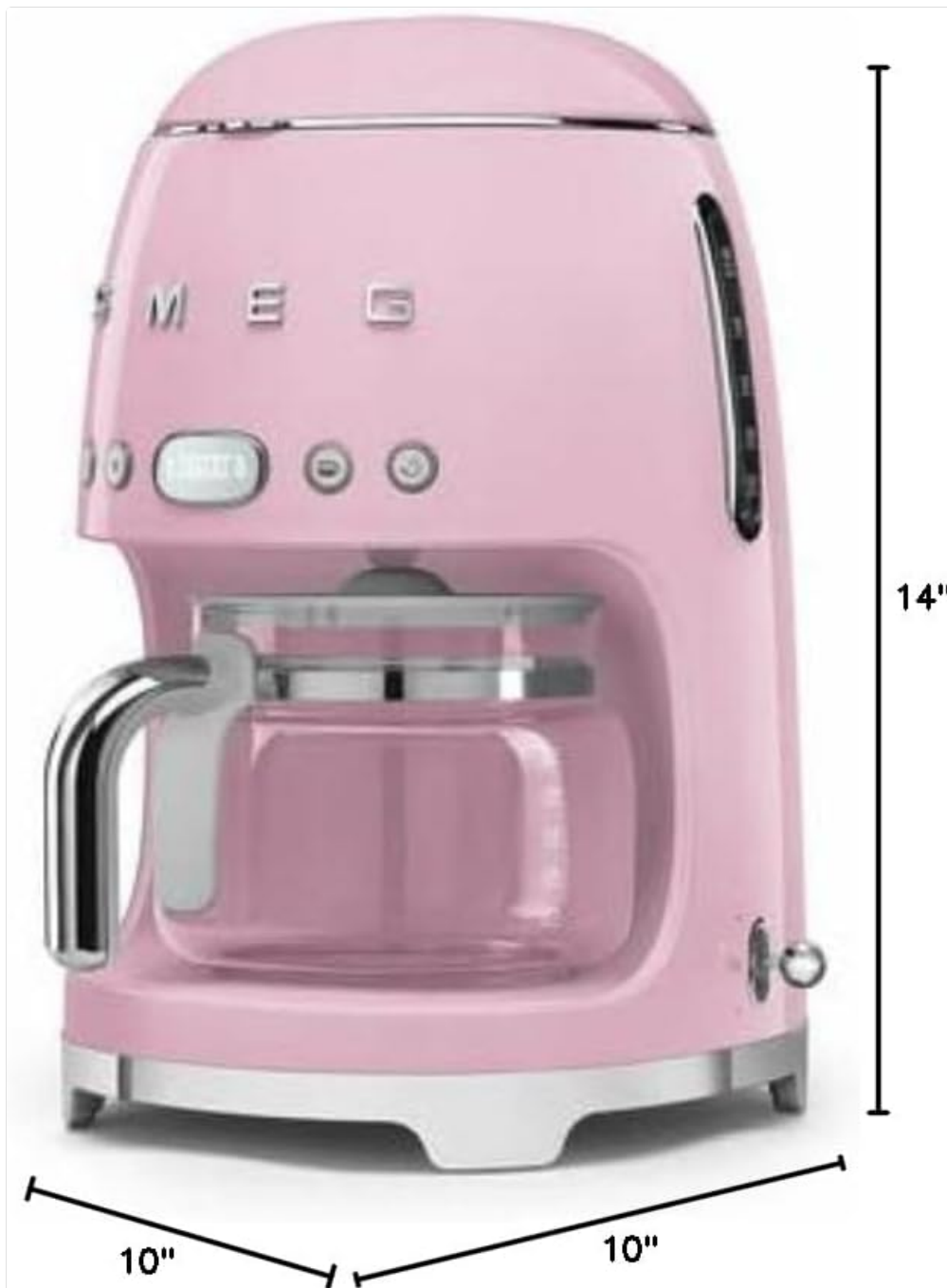
Image: Diagram showing the dimensions of the Smeg DCF02 Drip Coffee Maker (10"D x 10"W x 14"H).