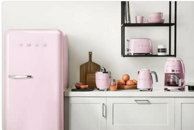
Image: The reusable coffee filter, designed for eco-friendly brewing.