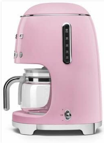
Image: Side view of the coffee maker highlighting the transparent water level indicator.