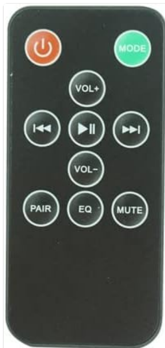
Figure 3.1: Front view of the replacement remote control with all buttons clearly visible.

Point the remote control directly at the IR receiver on your sound bar system. Ensure there are no obstructions between the remote and the sound bar.