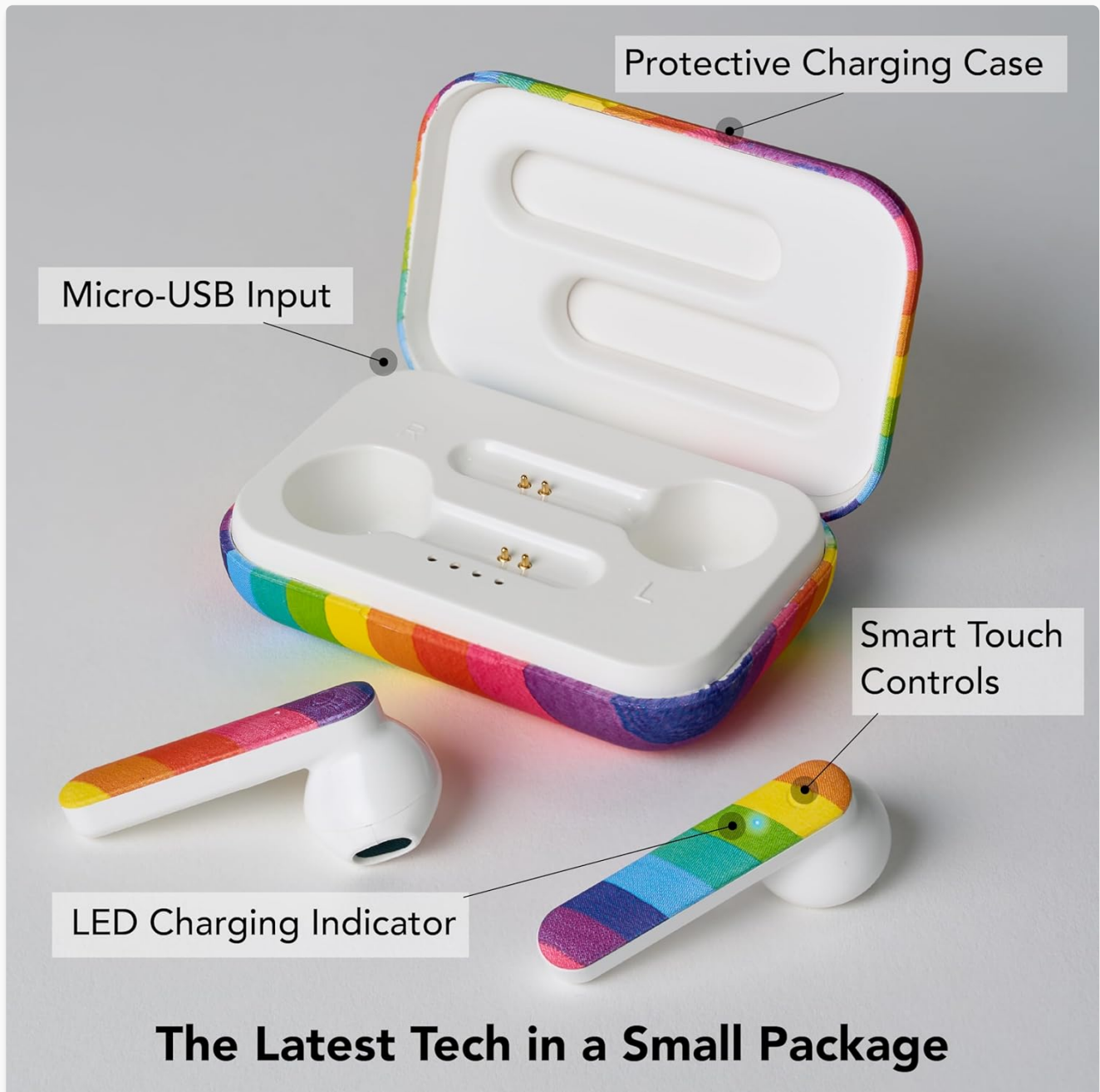
Image: A detailed diagram showing the Protective Charging Case, Micro-USB Input, Smart Touch Controls on the earbuds, and LED Charging Indicators.

Familiarize yourself with the components of your COOLBUDS True Wireless Earbuds: