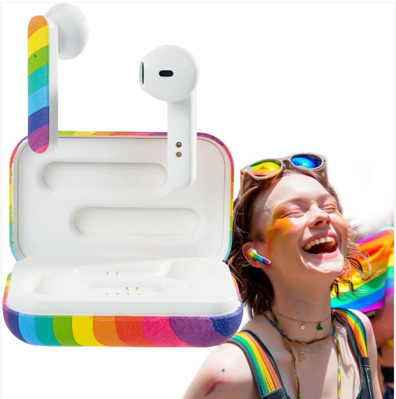
Image: The COOLBUDS CPHBT805RB True Wireless Earbuds in their charging case, alongside a person enjoying music. The earbuds feature a vibrant rainbow design.