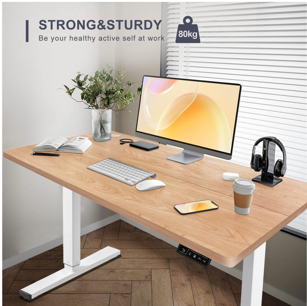
Image: The control panel of the Devoko Electric Standing Desk, featuring a digital height display and buttons for up, down, and memory presets, integrated into the desk's right side.