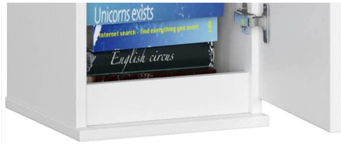
A view of the AKORD Wall-Mounted Bathroom Cabinet with its door open, displaying the three internal shelves suitable for storing items such as books, bottles, and small decorative pieces.