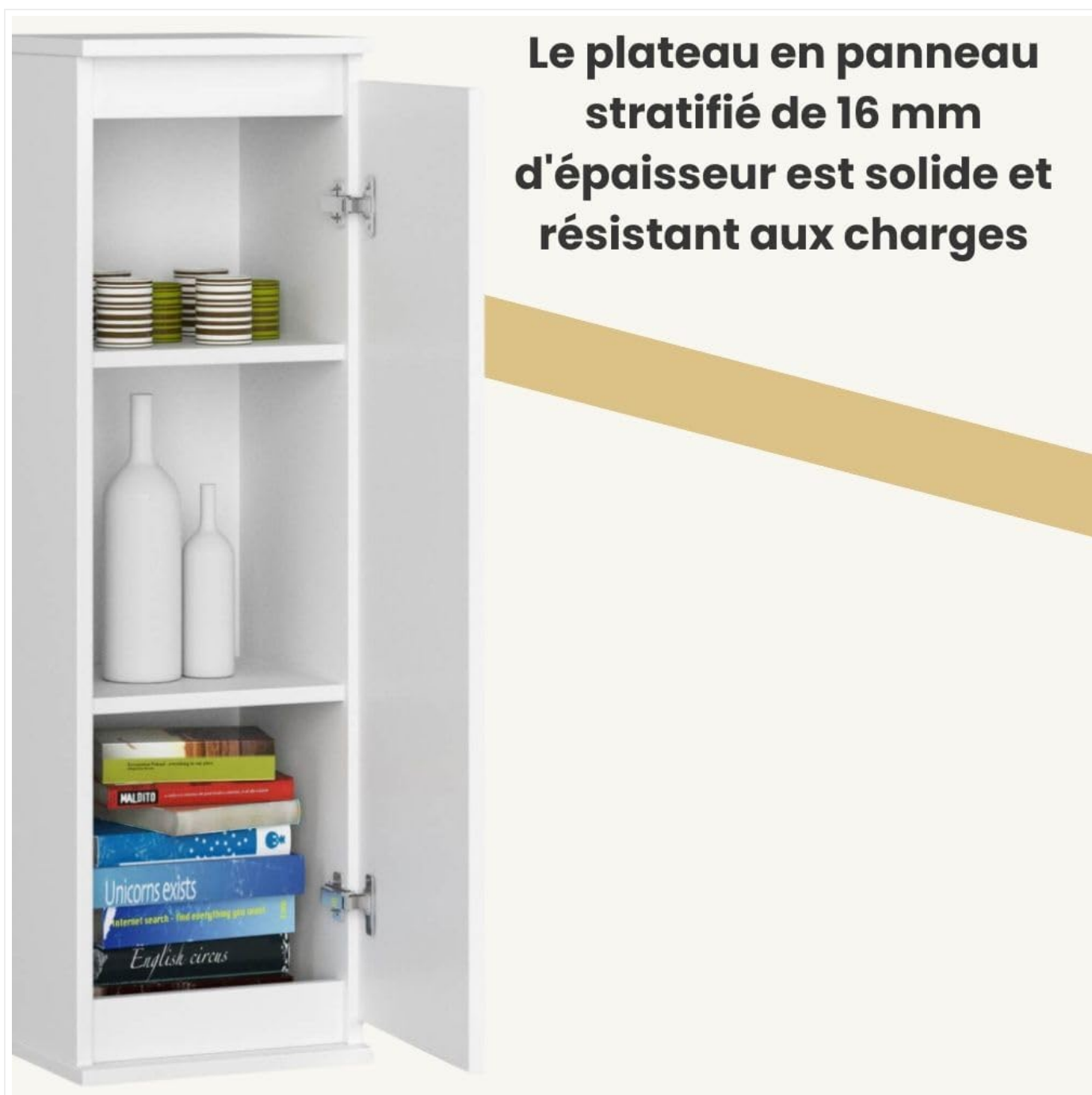
The interior of the AKORD Wall-Mounted Bathroom Cabinet features multiple shelves, providing organized storage space for various items like books and decorative objects.