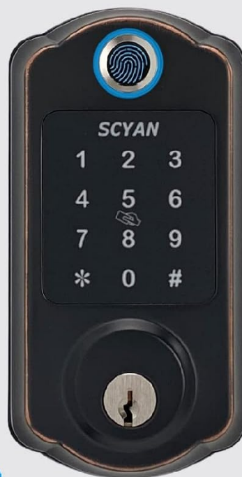
Figure 2: Overview of SCYAN D7 Smart Deadbolt features, including fingerprint, IC card, auto-locking, backup key, Micro USB port, and TTLock App compatibility.