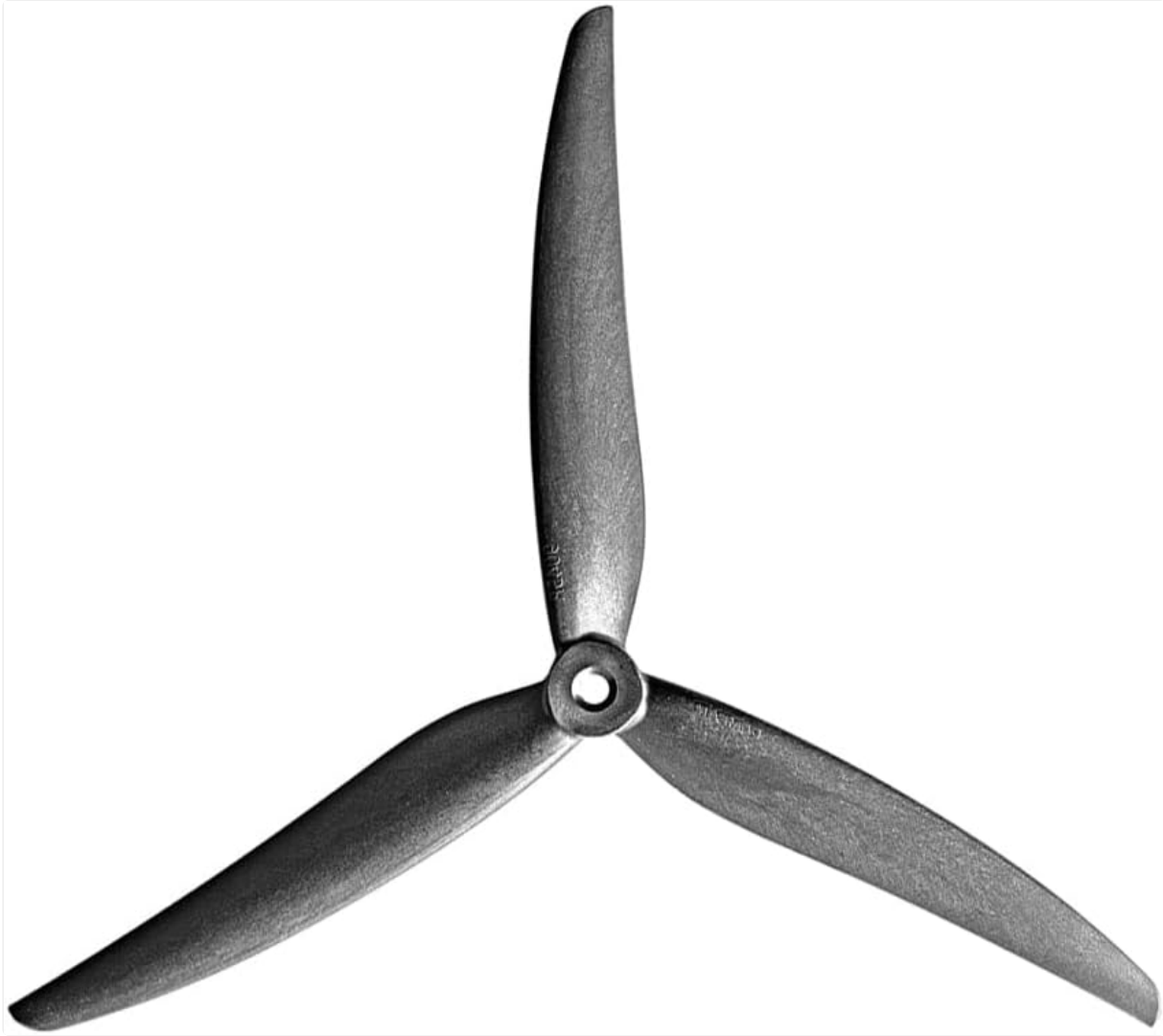
Image: Single Gemfan 3-Blade Propeller