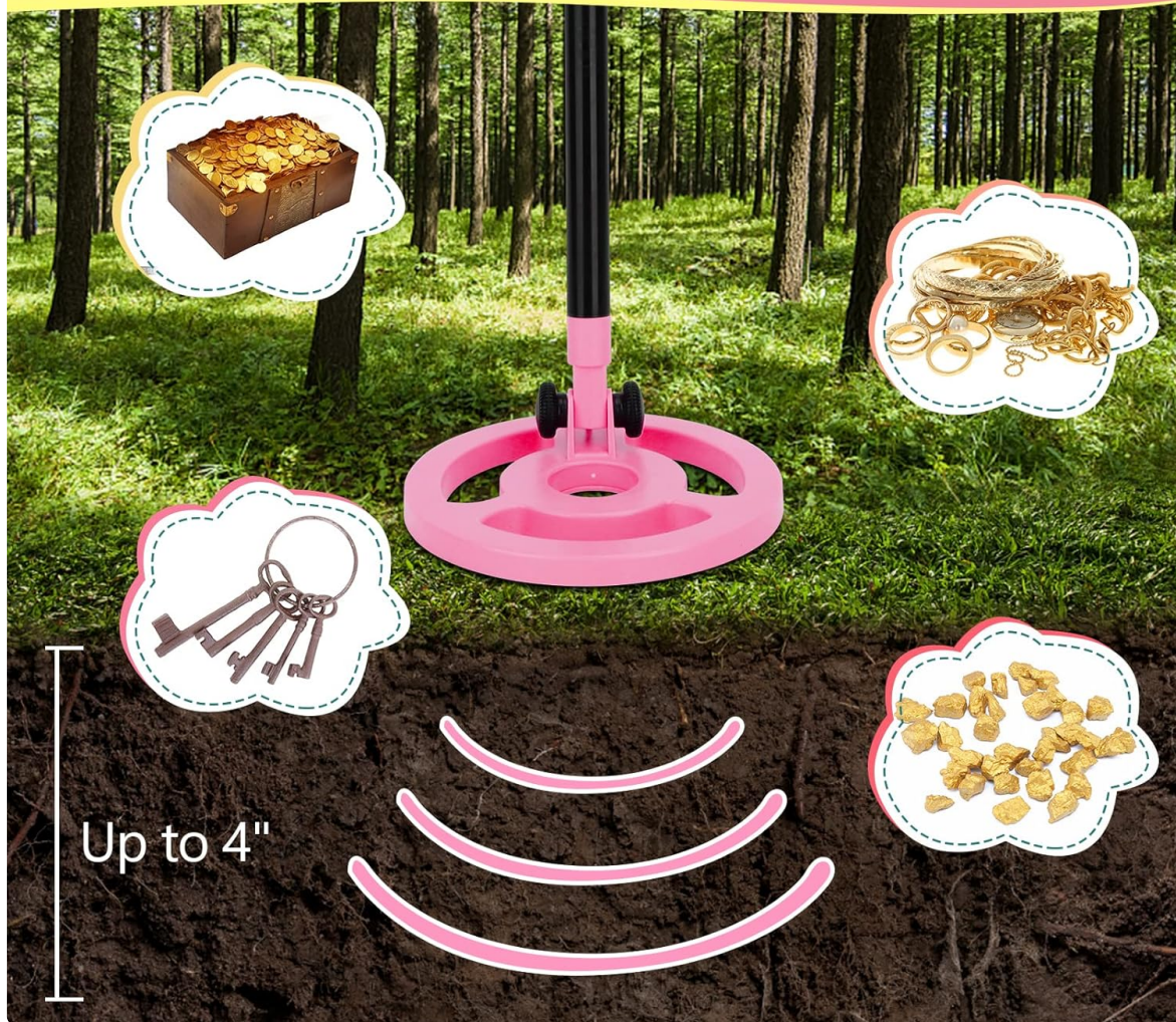
Image: Diagram showing the metal detector's ability to detect objects up to 4 inches deep.