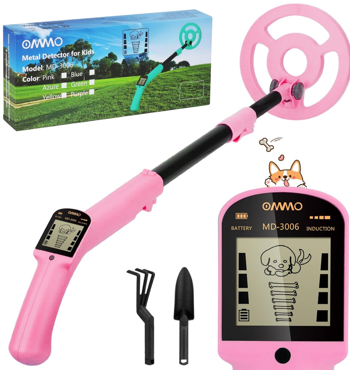
Image: The OMMO MD-3006 Kids Metal Detector in pink, shown with its main components and included digging tools.