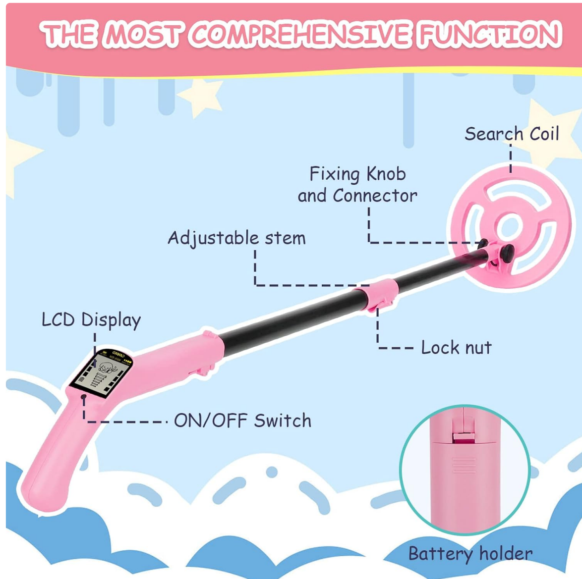
Image: All components of the OMMO MD-3006 Kids Metal Detector, including the main unit, search coil, handle, and digging tools.