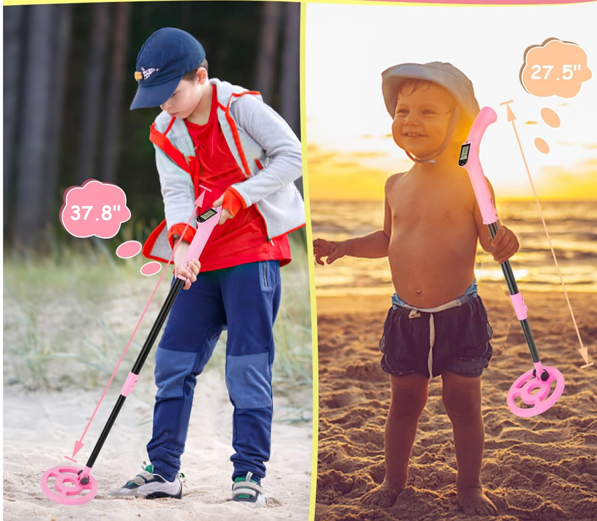
Image: Children demonstrating the adjustable stem feature for comfortable use.