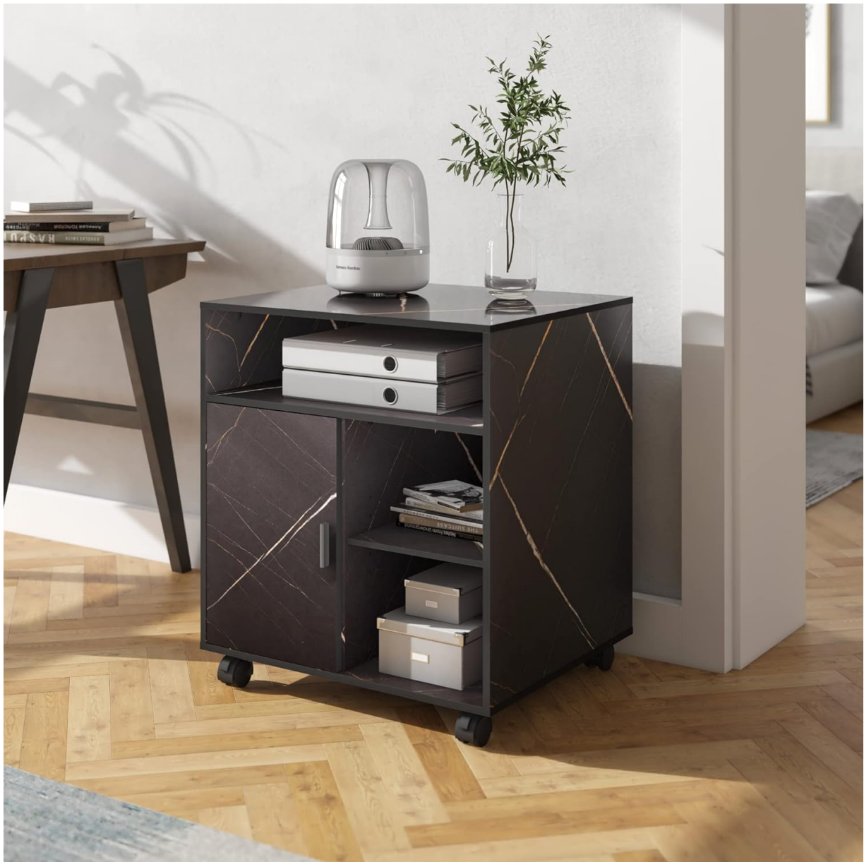
Image: The printer stand integrated into a home office environment.