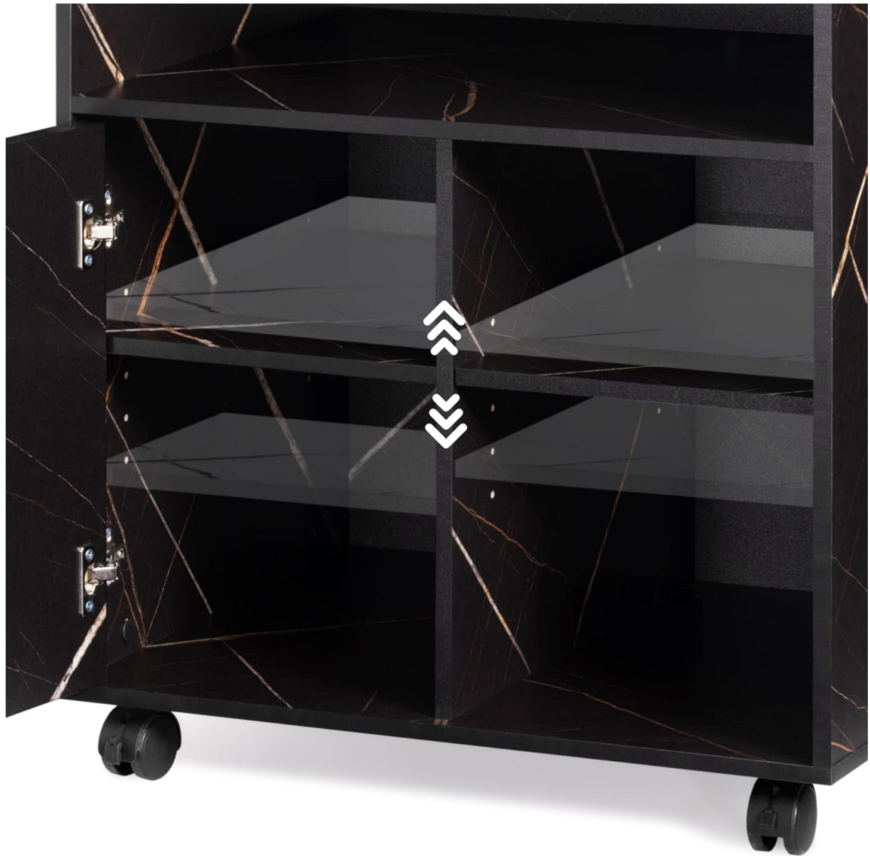
Image: Illustration of the adjustable shelves, demonstrating their flexibility.