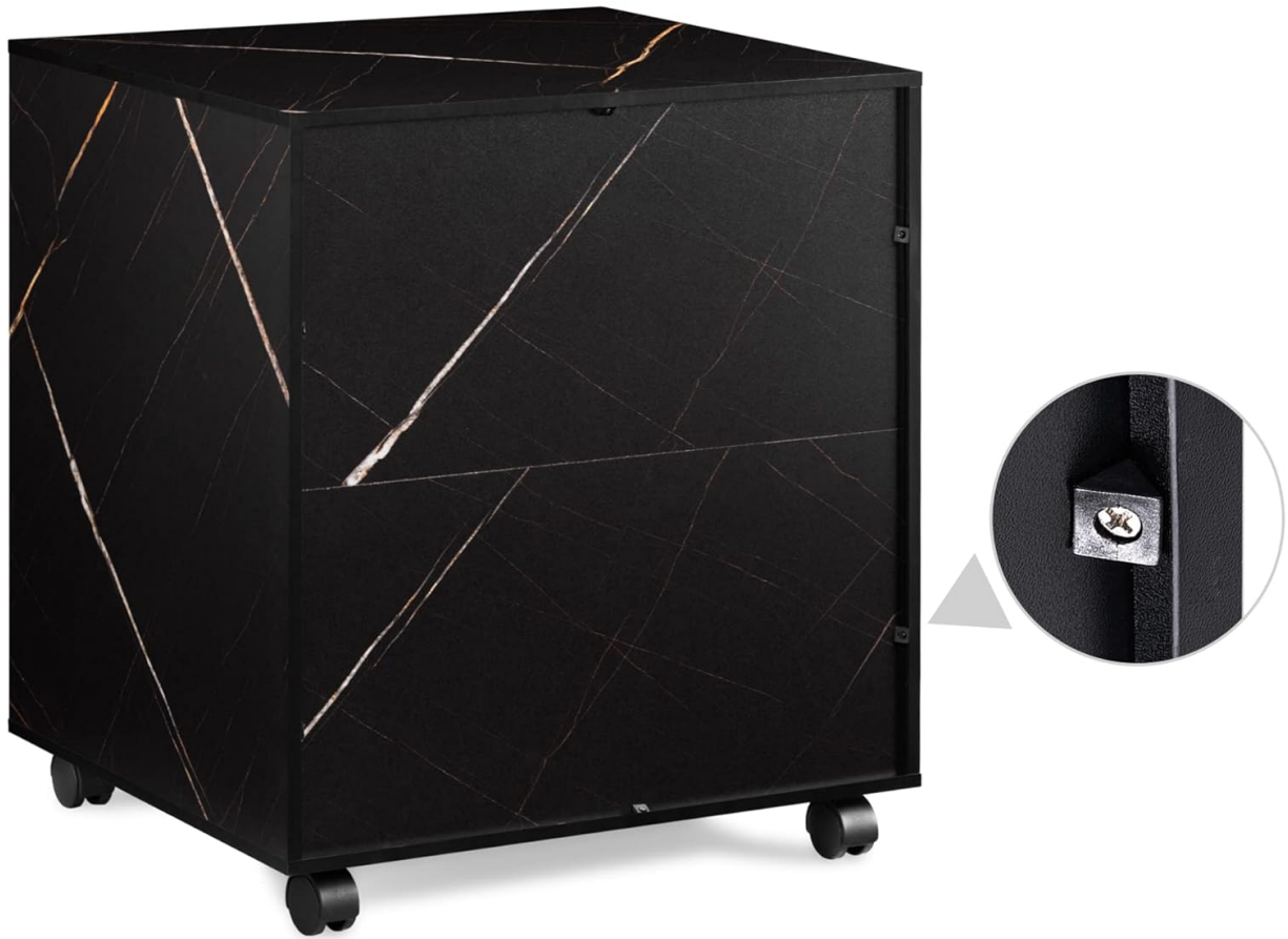
Image: Detail of the enhanced stability mechanism at the back of the stand.

Insert these small parts to the back to prevent wobbling