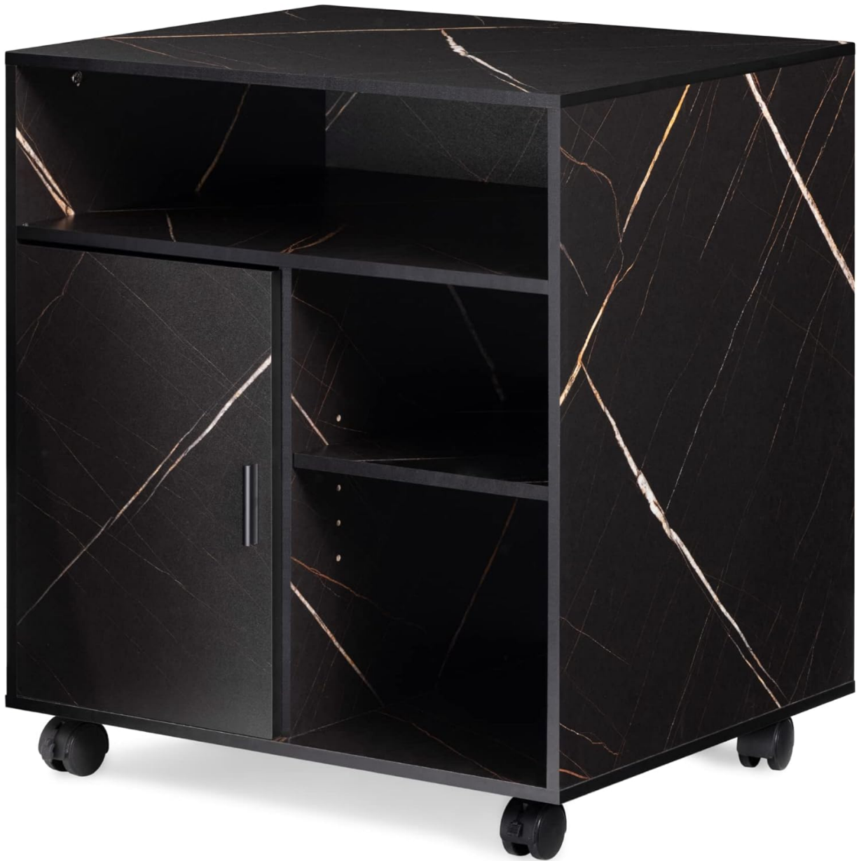
Image: Angled view of the printer stand, highlighting its open shelves and the door.

If you encounter any difficulties during assembly, refer to the detailed assembly guide included with your product or contact customer support.