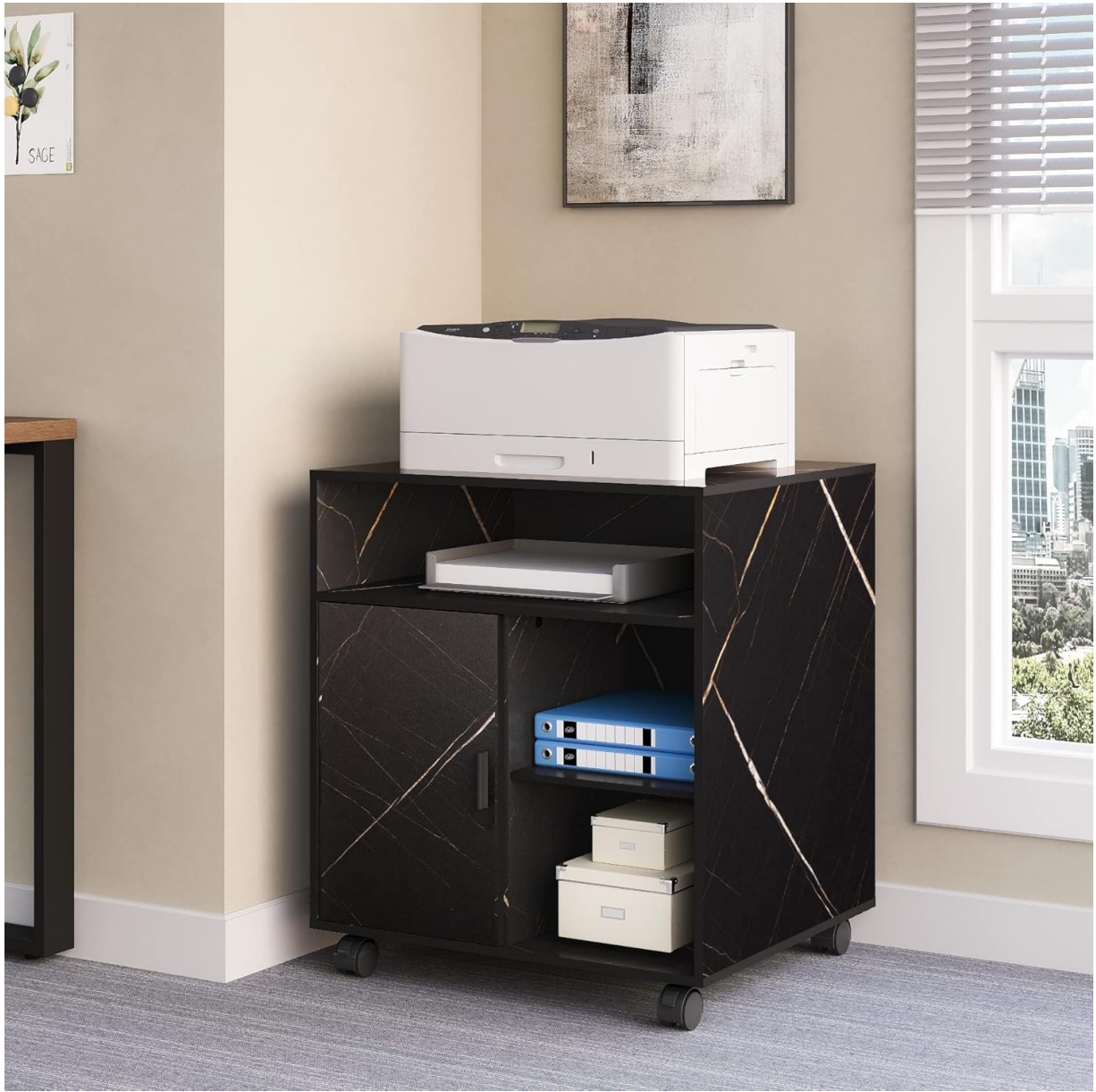
Image: The printer stand in use with a printer on its top surface.