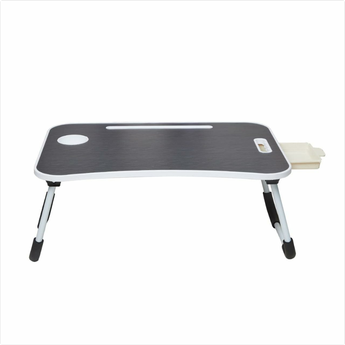
Overall view of the Amazon Basics Foldable Laptop Table in black, showcasing its sleek design and compact form.