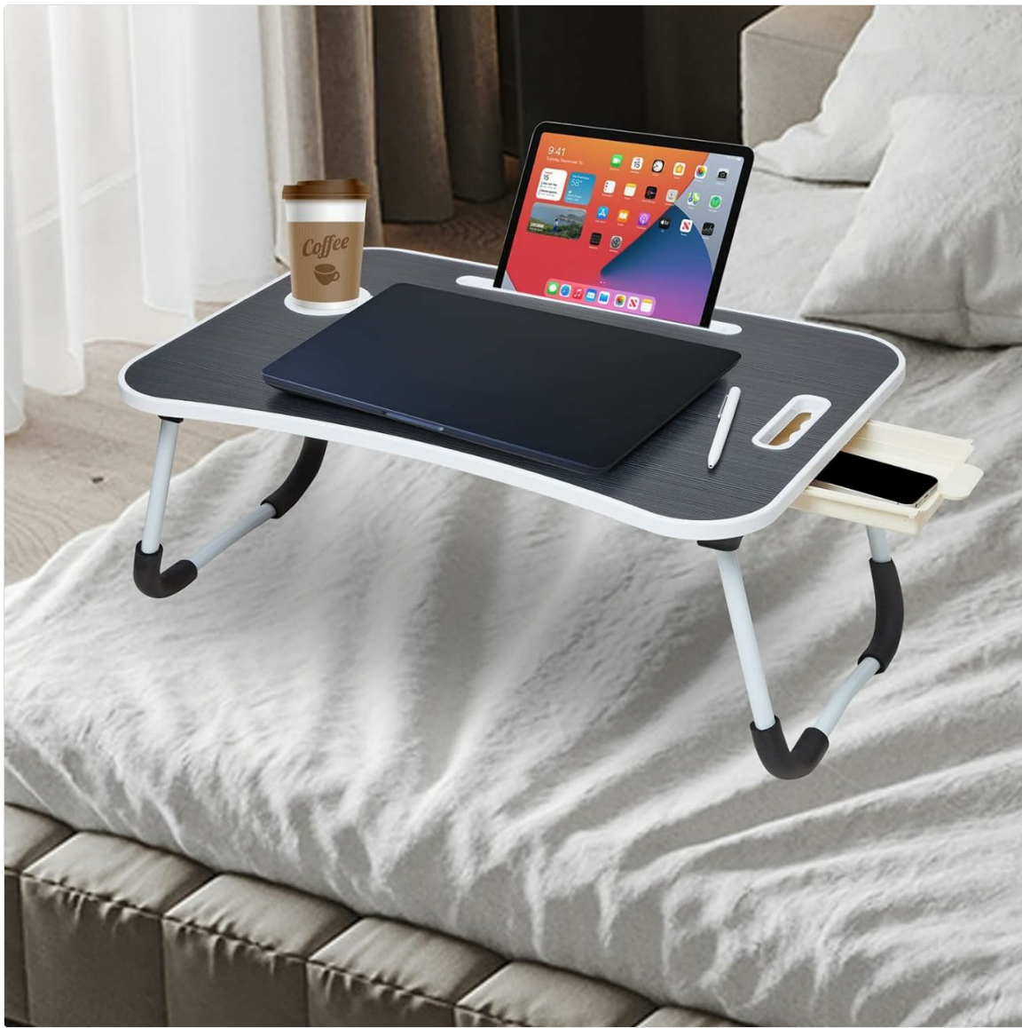
The laptop table in use on a bed, demonstrating its practical application for comfortable computing or dining in bed. A laptop, tablet, and coffee cup are placed on the table.