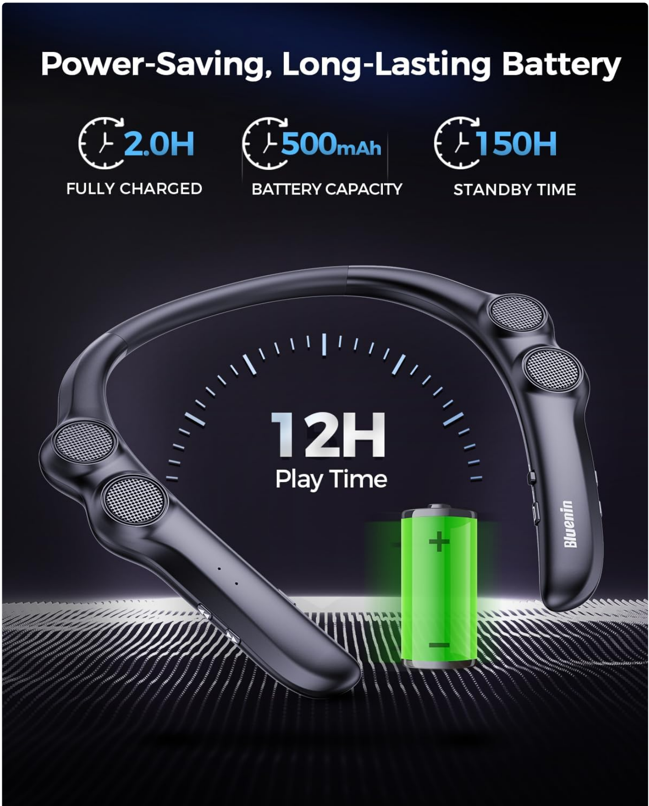
Figure 4: Battery and Charging Information

charging port and a USB power source. The charging indicator light will show the charging status. A full charge typically takes approximately 2 hours.