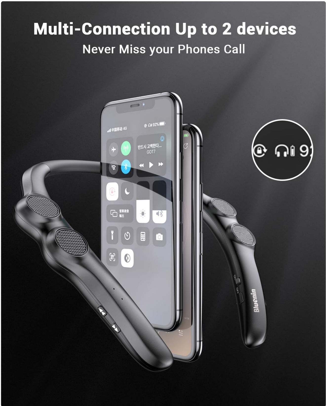
Figure 5: Multi-Device Connection Capability

The speaker supports multi-point connection, allowing you to connect to two devices simultaneously. After pairing the first device, put the speaker back into pairing mode and connect the second device. The speaker will then be connected to both.