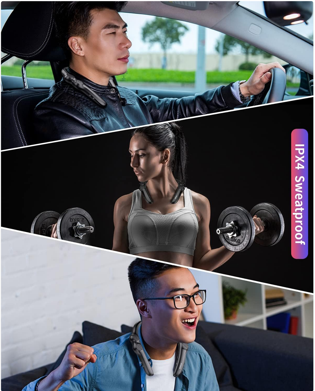
Figure 6: Speaker Usage in Various Environments, highlighting IPX4 rating