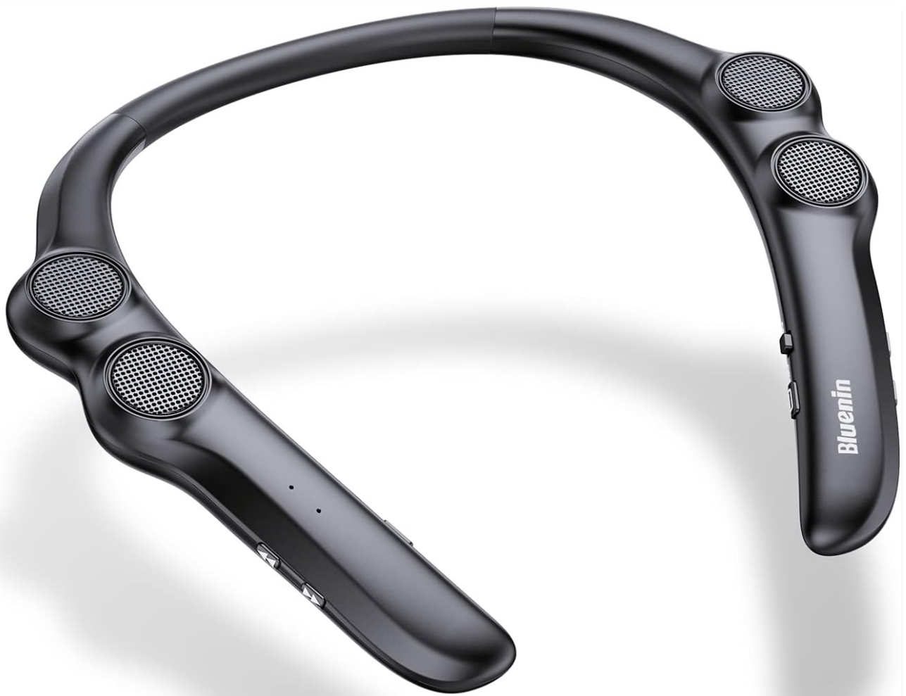
Figure 1: Gardway Neckband Bluetooth Speaker (Model GL-929s)