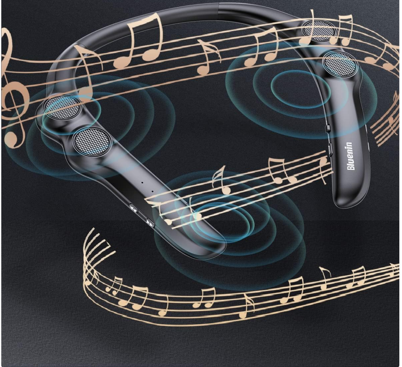
Figure 3: Quadruple Speakers System for 3D Surround Sound