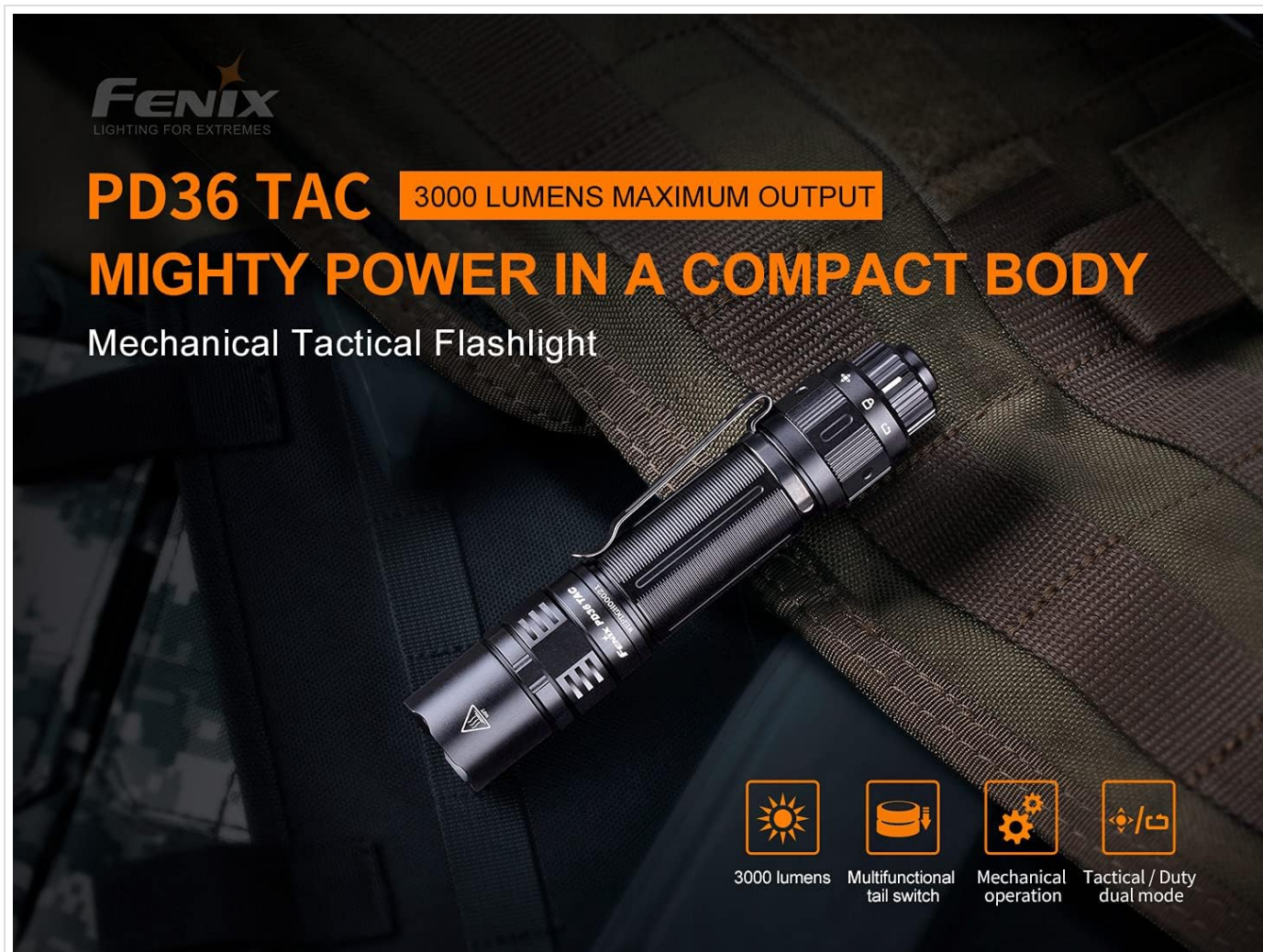
Image: The Fenix PD36 TAC flashlight demonstrating its compact design and tactical features.

To prevent accidental activation, the flashlight features a lockout function. This is typically engaged by a specific sequence of switch presses or by slightly unscrewing the tail cap. Refer to the detailed user manual included in the package for the exact lockout procedure.