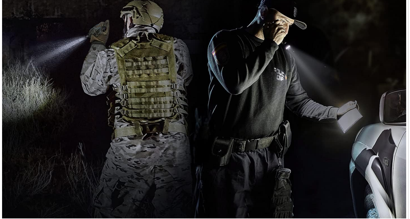
Image: Detailed technical parameters and performance data for the Fenix PD36 TAC.

Rotating the mechanical toggle switch on the tail allows you to instantly switch between Tactical and Duty mode. You can count on this reliable PD36 TAC to fight against criminal activities or to enforce the law.