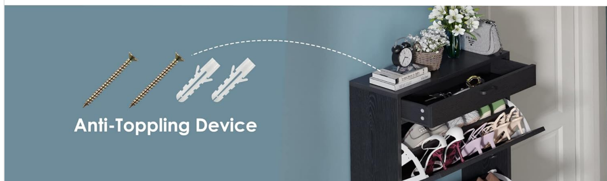
Figure 2.1: Illustration of the anti-toppling device, highlighting its function in preventing tip-over incidents.