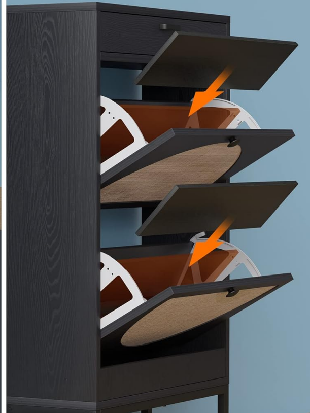
Figure 5.2: Close-up of the adjustable shelves within the flip drawers, demonstrating flexibility for various footwear.