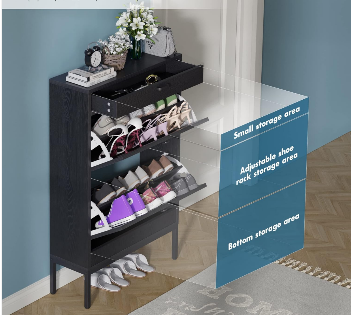
Figure 5.3: Overview of the cabinet, detailing dimensions and illustrating the various storage compartments including the top drawer, flip drawers, and bottom space.