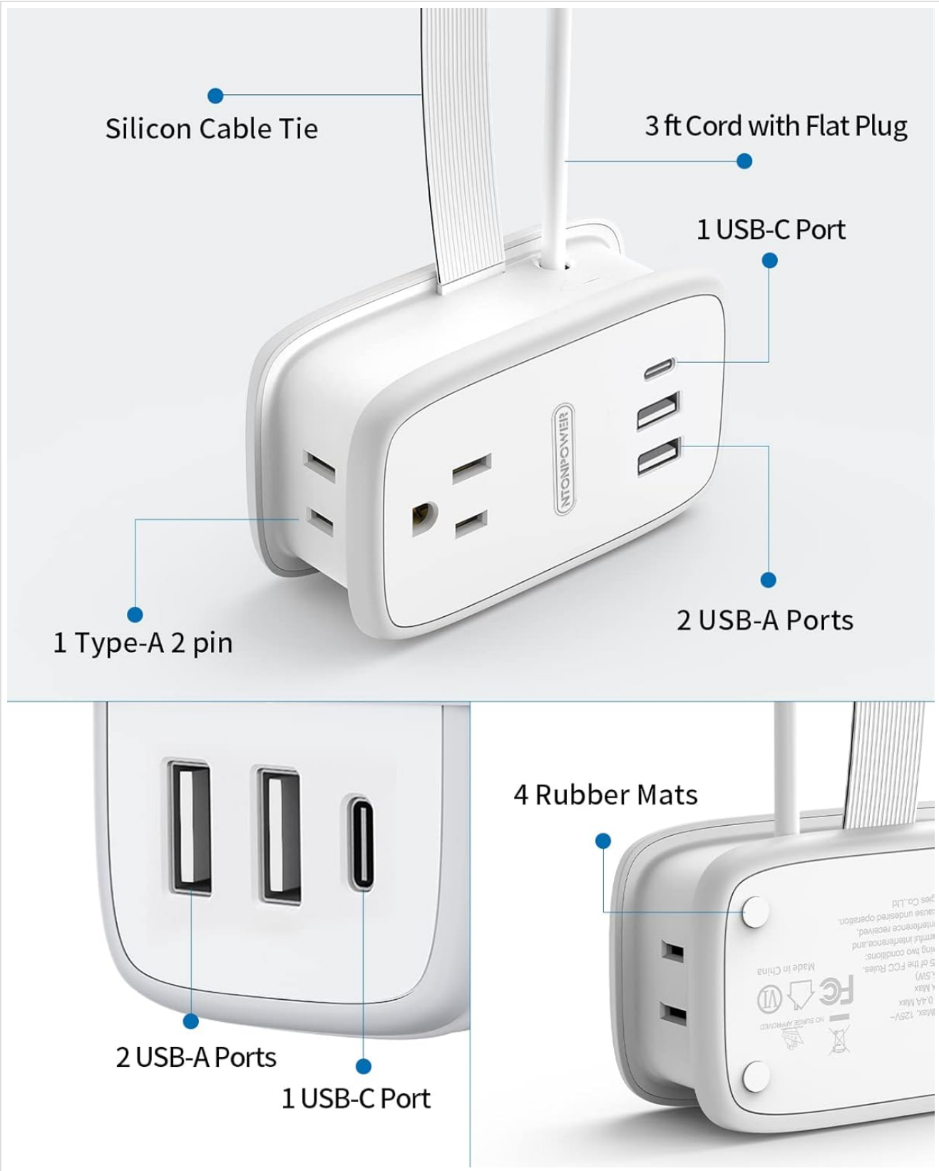
Overview of all available ports and outlets on the power strip.

USB-C ports. The built-in Smart IC technology automatically detects and delivers the appropriate current to your devices, eliminating the need for various charging adapters.