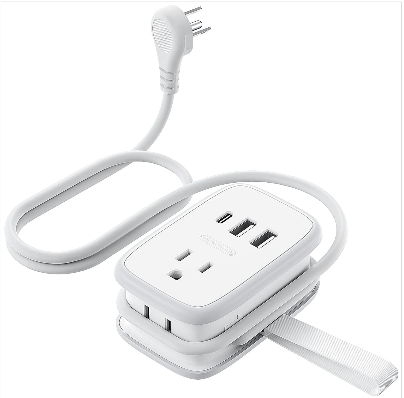
The NTONPOWER USB C Travel Power Strip in its compact, travel-ready form.