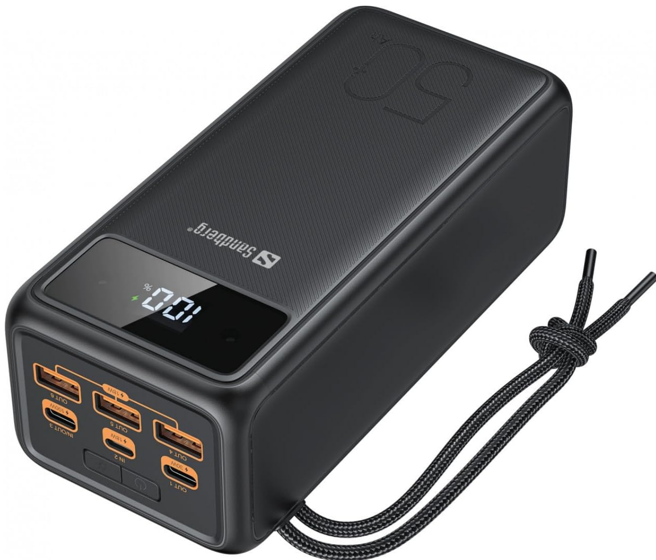
Front View: This image shows the Sandberg Powerbank from a slightly elevated front angle, highlighting its digital display showing "100%" charge, and the various USB-C and USB-A output ports. A braided strap is visible on the right side.