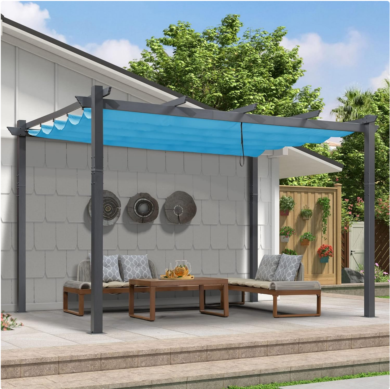
Figure 1: Fully assembled PURPLE LEAF 9.5' x 13' Outdoor Retractable Pergola.