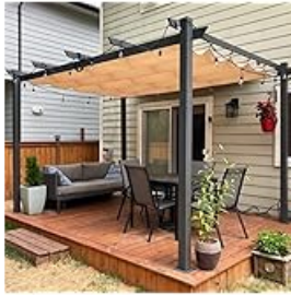
Figure 3: Illustration of the robust post design for enhanced stability.