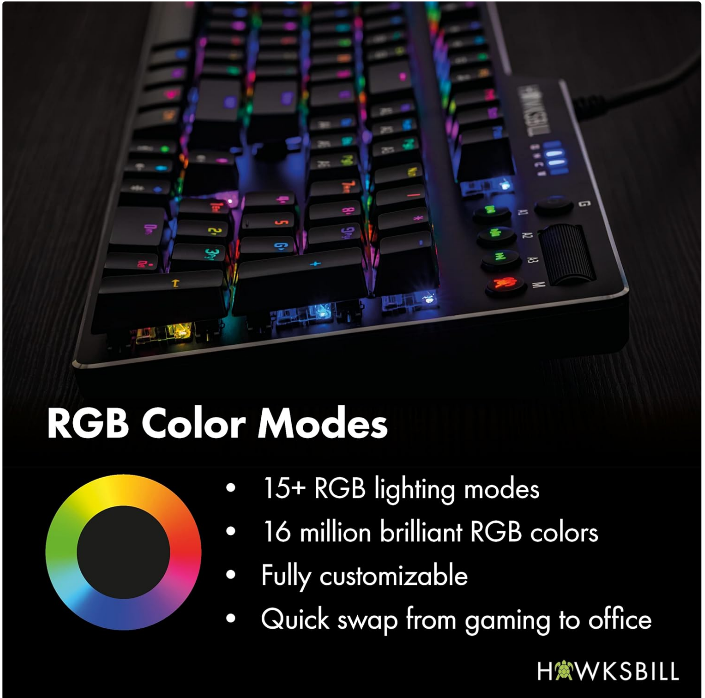
Image: A detailed view of the keyboard's RGB lighting, illustrating the variety of colors and dynamic effects available across the keys.