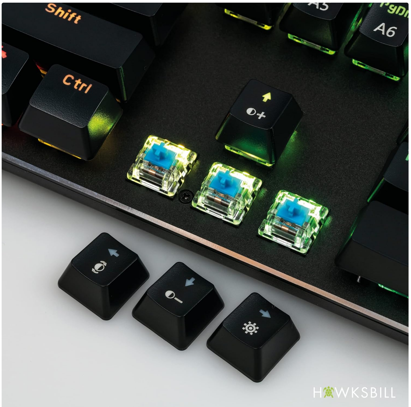
Image: A close-up view of the mechanical key switches, highlighting their design and the ability to replace them.