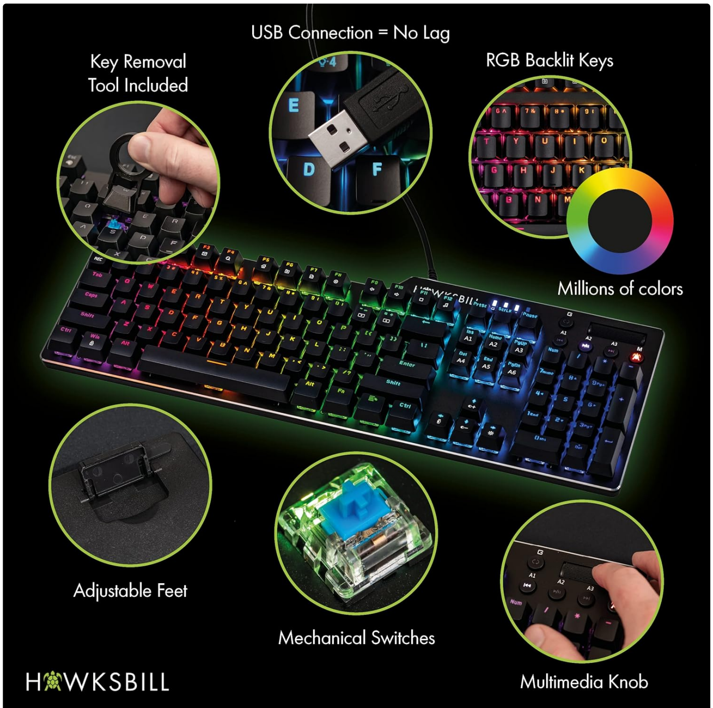
Image: An overview of the Hawksbill Scorpion V1 keyboard and its included accessories, such as the key removal tool, replacement switches, and adjustable feet.