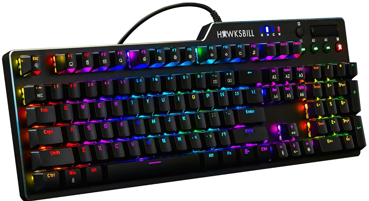
Image: The Hawksbill Scorpion V1 keyboard showcasing its full layout and vibrant RGB backlighting.

This manual provides detailed instructions for the setup, operation, and maintenance of your Hawksbill Scorpion V1 Wired Mechanical Gaming Keyboard. Please read this manual thoroughly before using the product to ensure optimal performance and longevity.