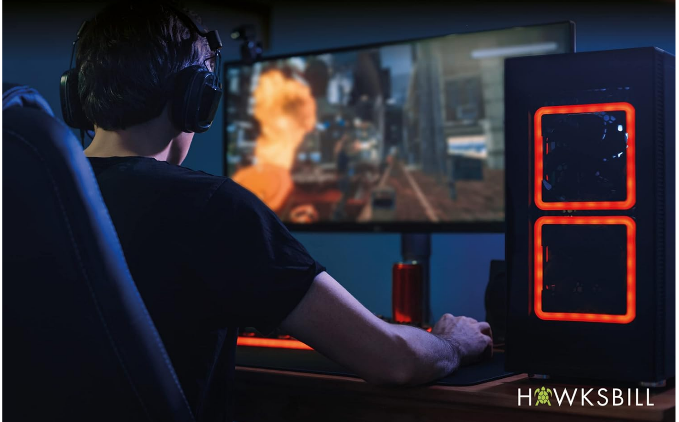
Image: The Hawksbill Scorpion V1 keyboard connected via its USB-A cable to a computer, highlighting its wired connection for immediate response.