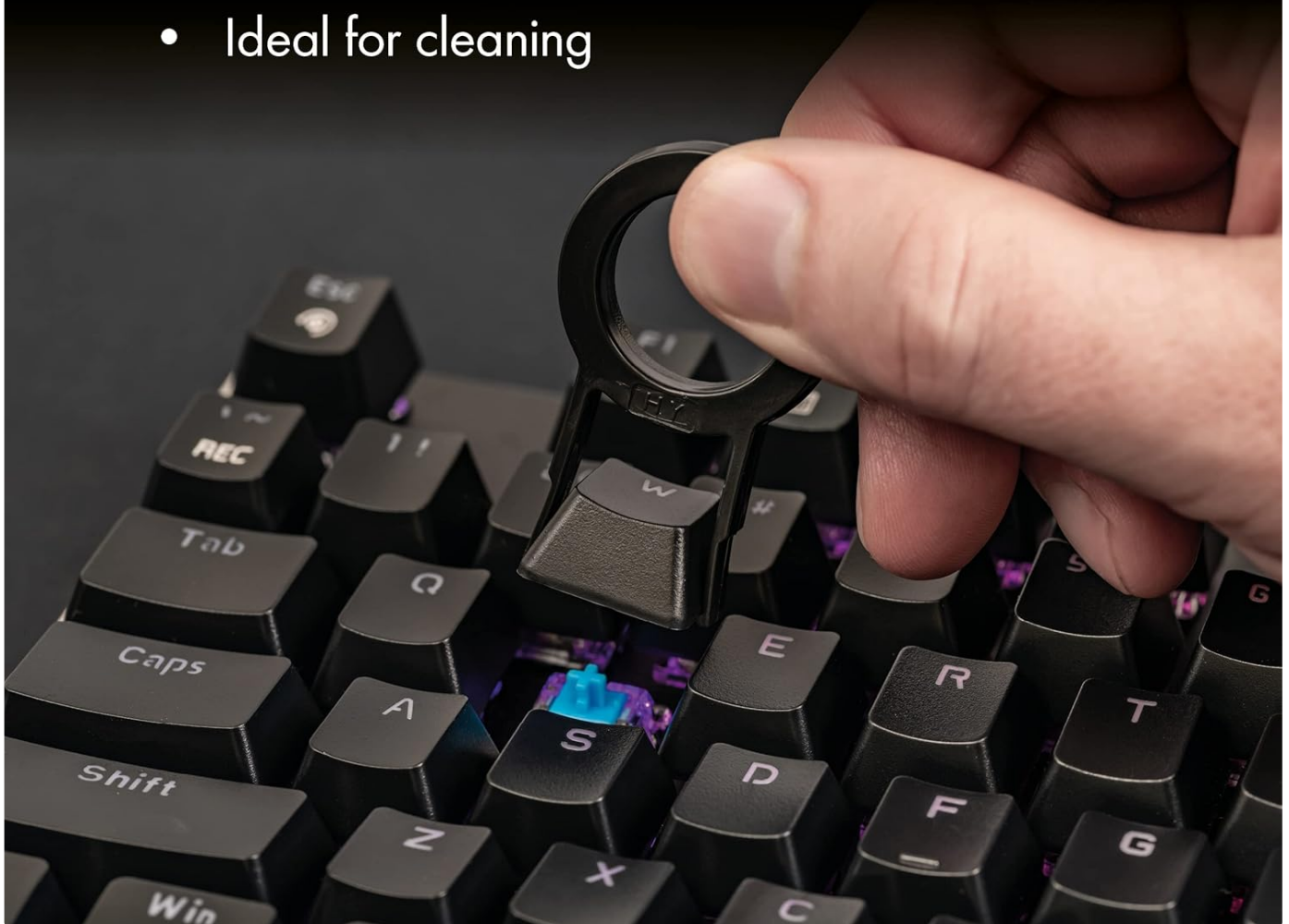
Image: A hand demonstrating the use of the keycap puller to easily remove a key from the keyboard, facilitating cleaning or replacement.