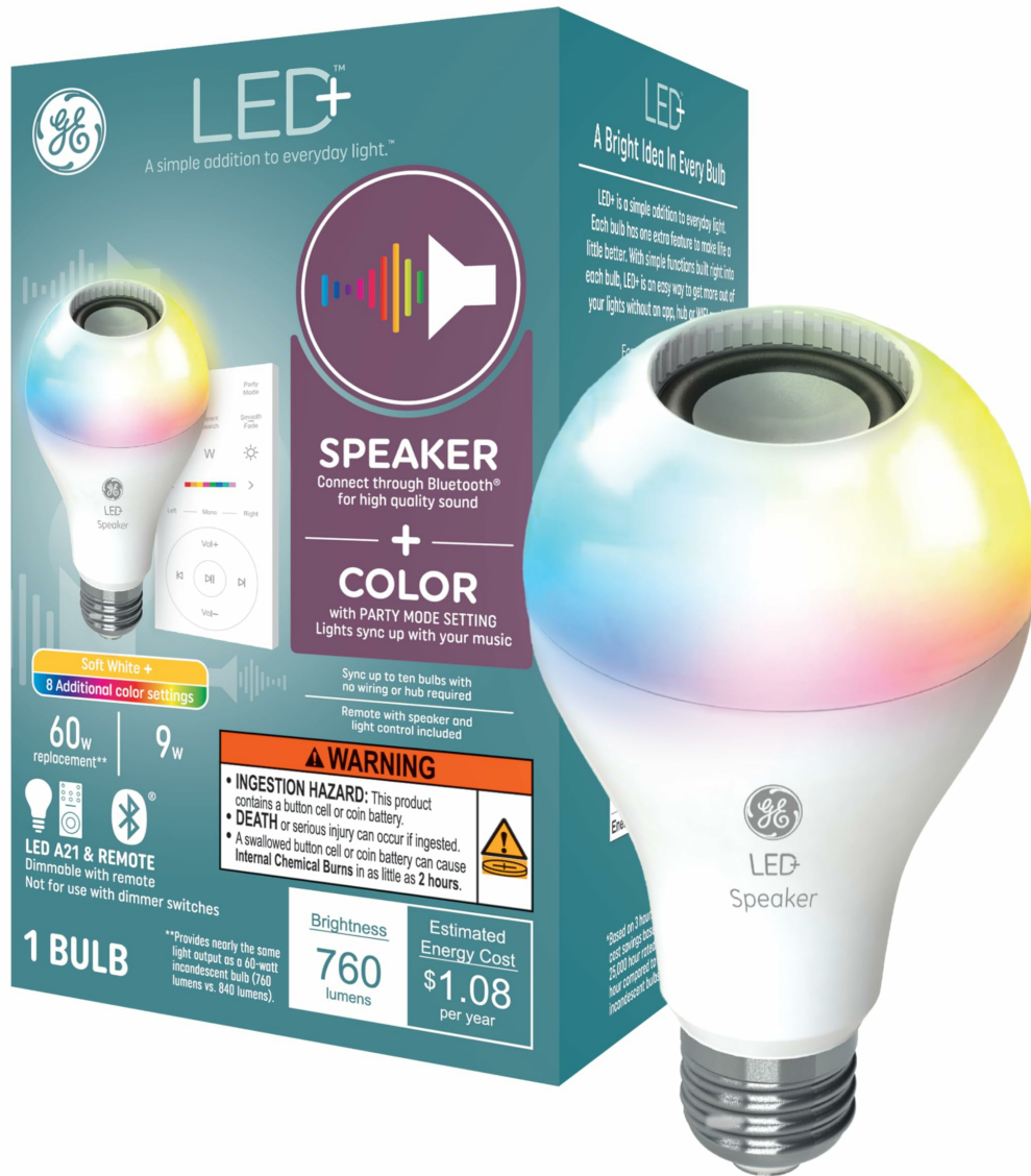
Figure 1: GE LED+ A21 Smart LED Speaker Light Bulb