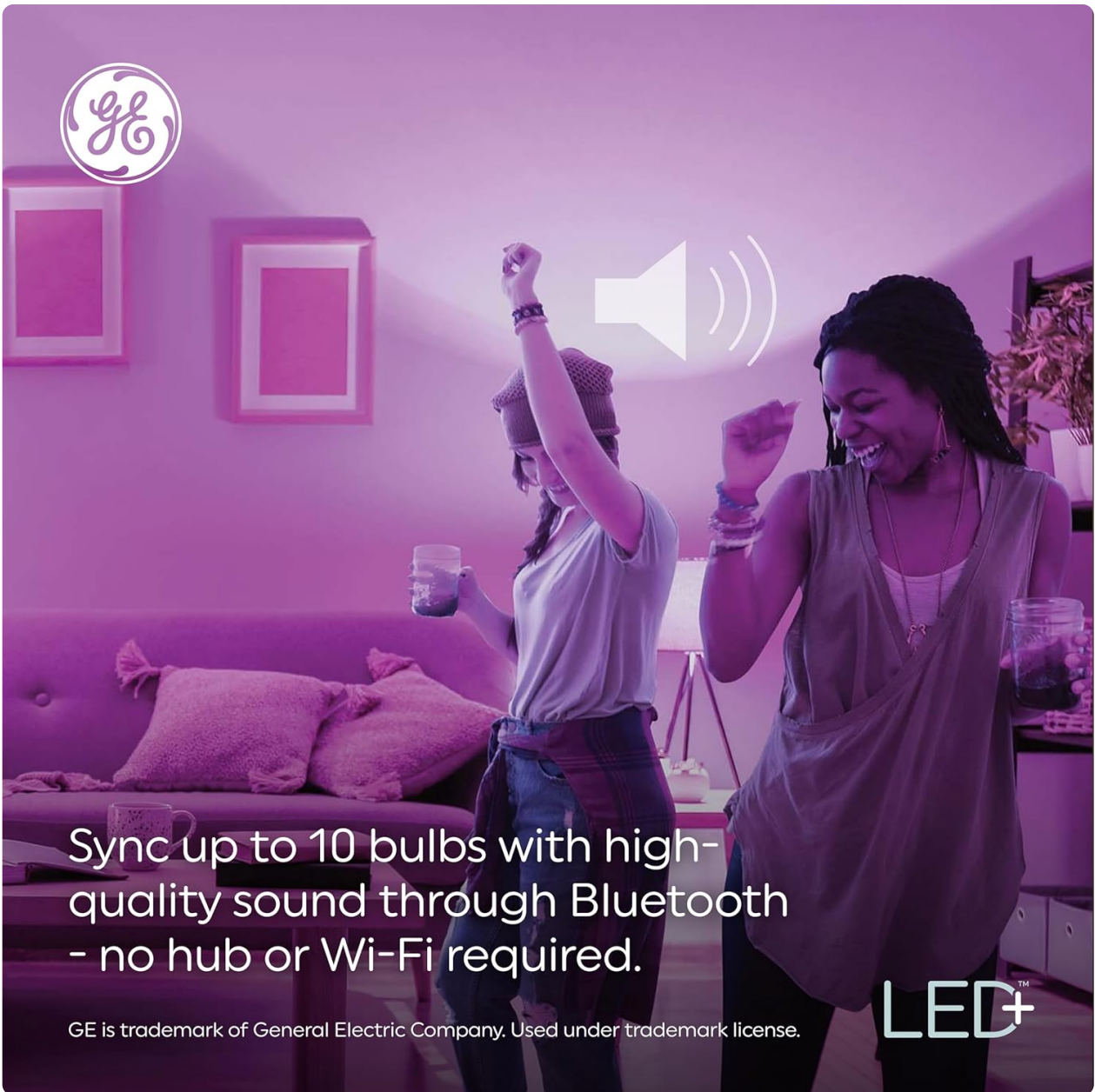
Figure 4: Multiple bulbs can be synced for a surround sound experience.