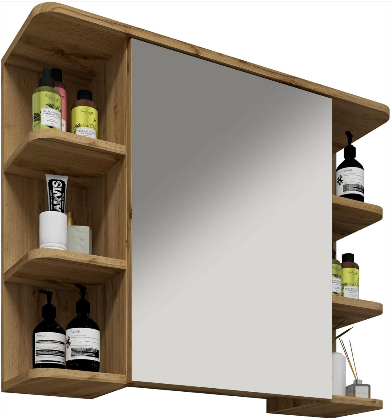
Figure 1: VCM Nilosi Bathroom Mirror Cabinet, front view. This image shows the cabinet mounted on a wall, displaying its honey oak finish, central mirror, and six open side shelves filled with various bathroom products.