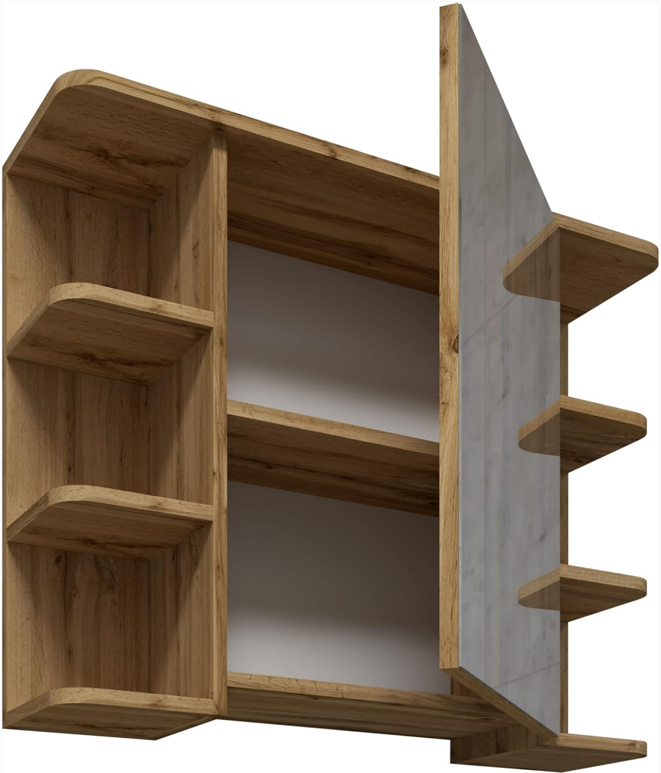
Figure 4: Cabinet with mirror door open. This image displays the interior of the cabinet, revealing the two large storage compartments behind the mirror door and the open side shelves.