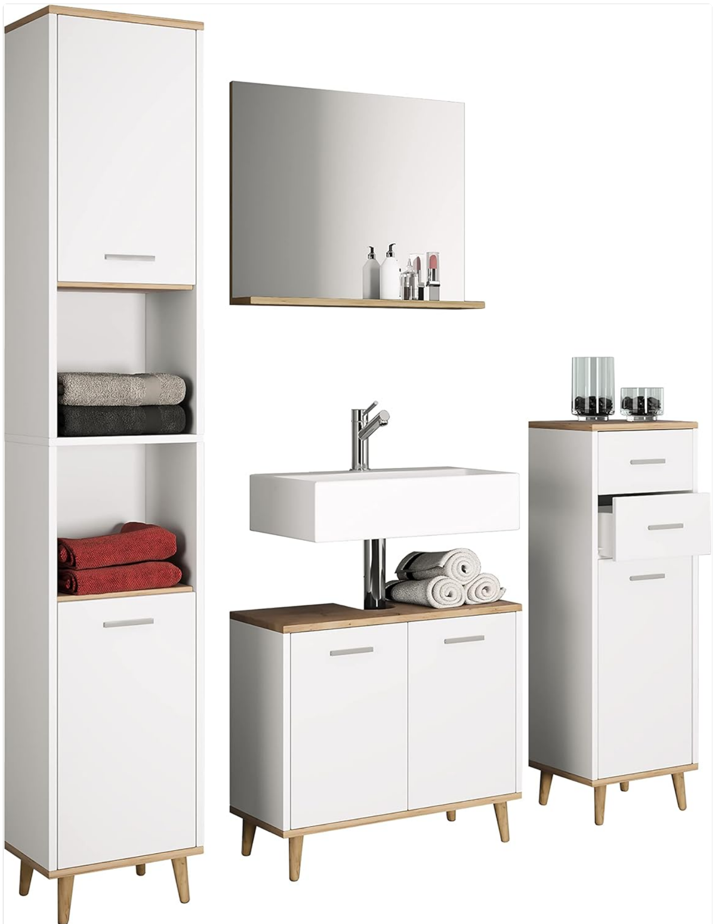
Figure 2: Cabinet Dimensions

This diagram illustrates the height (181 cm), width (32 cm), and depth (28 cm) of the VCM Landos Tall Bathroom Cabinet, crucial for planning its placement.