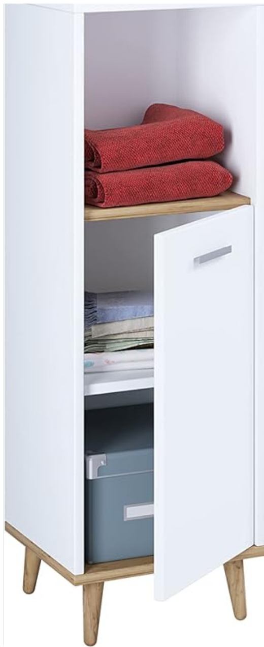
Figure 1: VCM Landos Tall Bathroom Cabinet (White / Honey-oak)

This image shows the VCM Landos Tall Bathroom Cabinet, highlighting its sleek design with white panels and honey-oak accents. The cabinet features two hinged doors and two open compartments, providing versatile storage options.