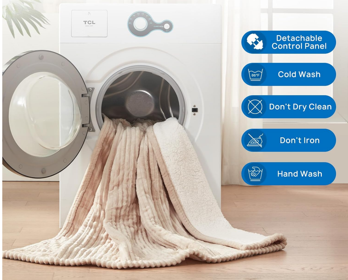
Image: Electric blanket in a washing machine for cleaning.