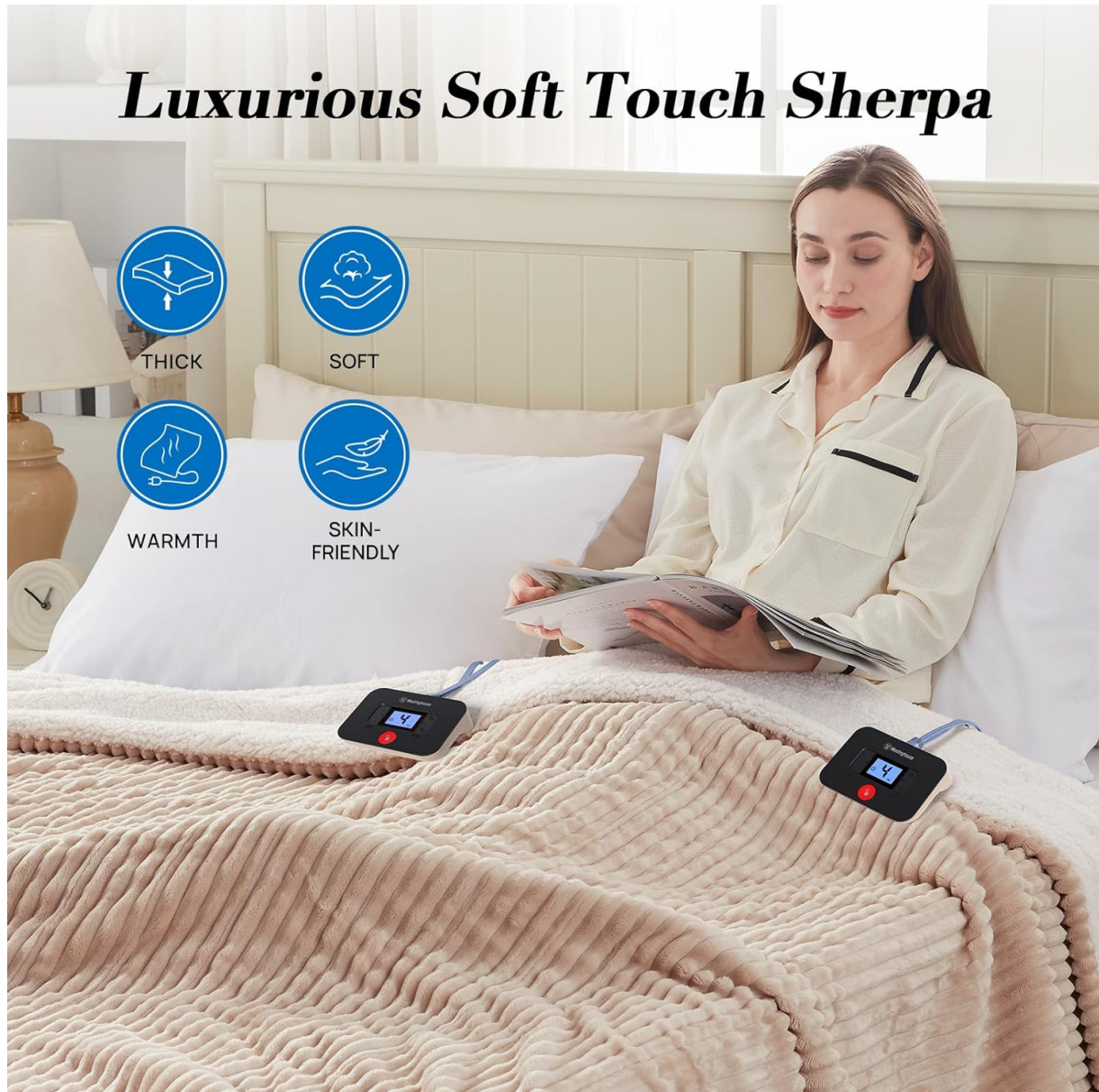
Image: Dual control setup on a bed.