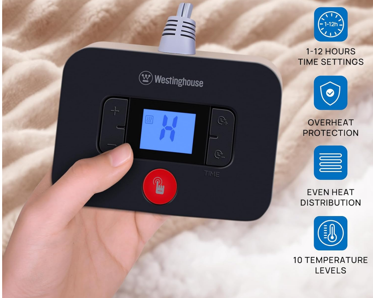
Image: Digital control unit with heat and timer settings.

Your browser does not support the video tag.