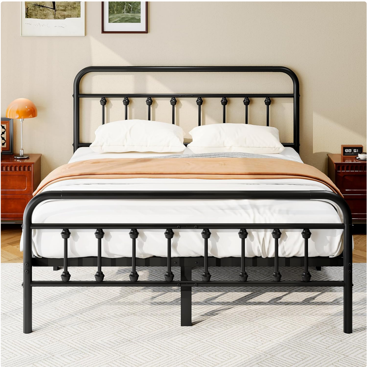
Image: Fully assembled zunatu Full Size Metal Platform Bed Frame in Victorian style.