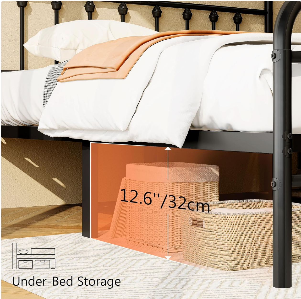
Image: Illustration of the 12.6-inch under-bed storage space provided by the bed frame.