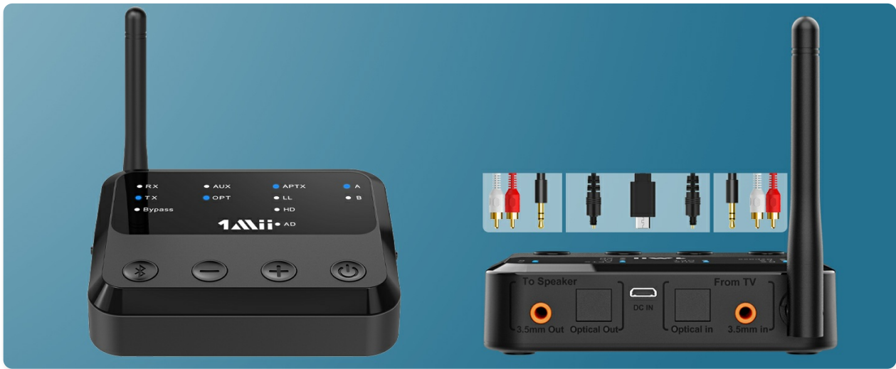
Image: Illustration of connecting a TV to the 1Mii B310Pro using an optical fiber cable.