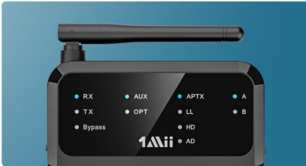
Image: Top view of the 1Mii B310Pro showing control buttons and indicator lights.