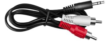
3 3.5mm Male To RCA Male Cable