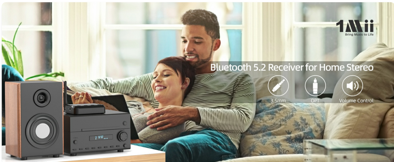
Image: Visual representation of the advanced Bluetooth 5.2 technology and supported aptX codecs.