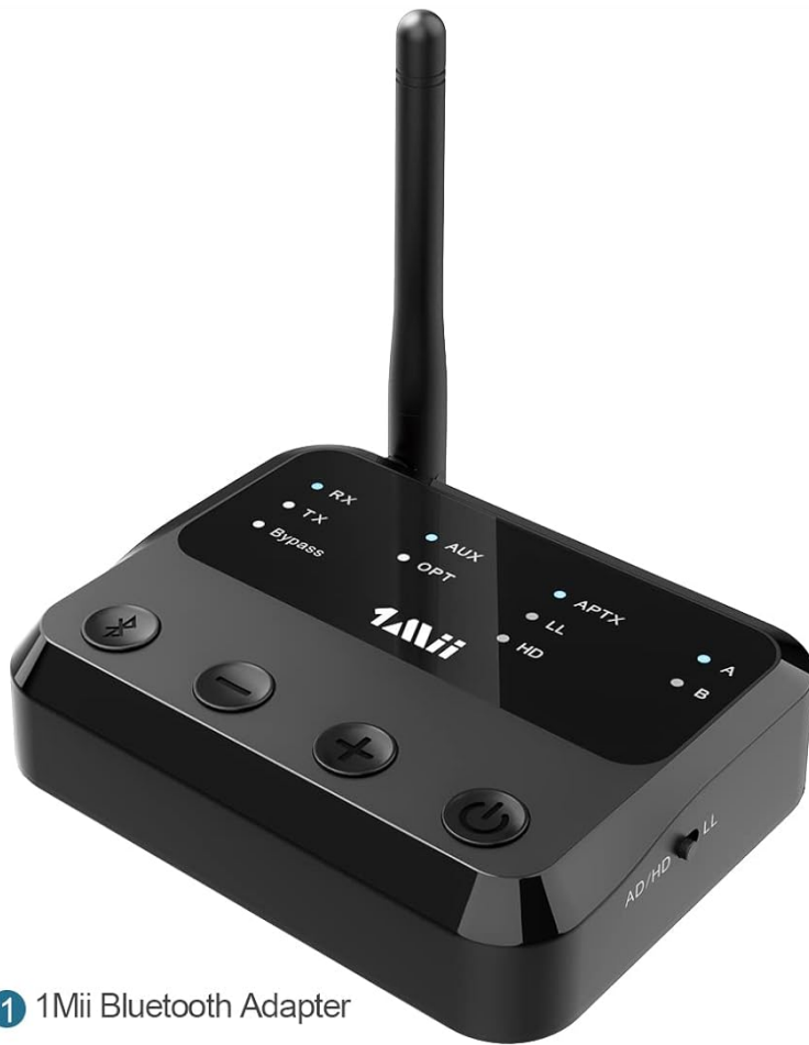
1 1Mii Bluetooth Adapter