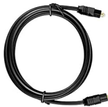
5 Optical Cable