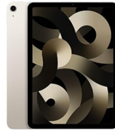
iPad Air 5/4