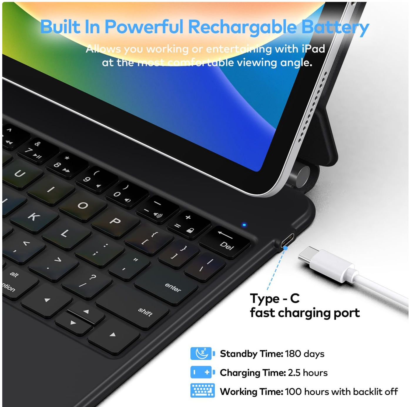
Image: Close-up of the keyboard showing the USB-C fast charging port and details on standby time, charging time, and working time.