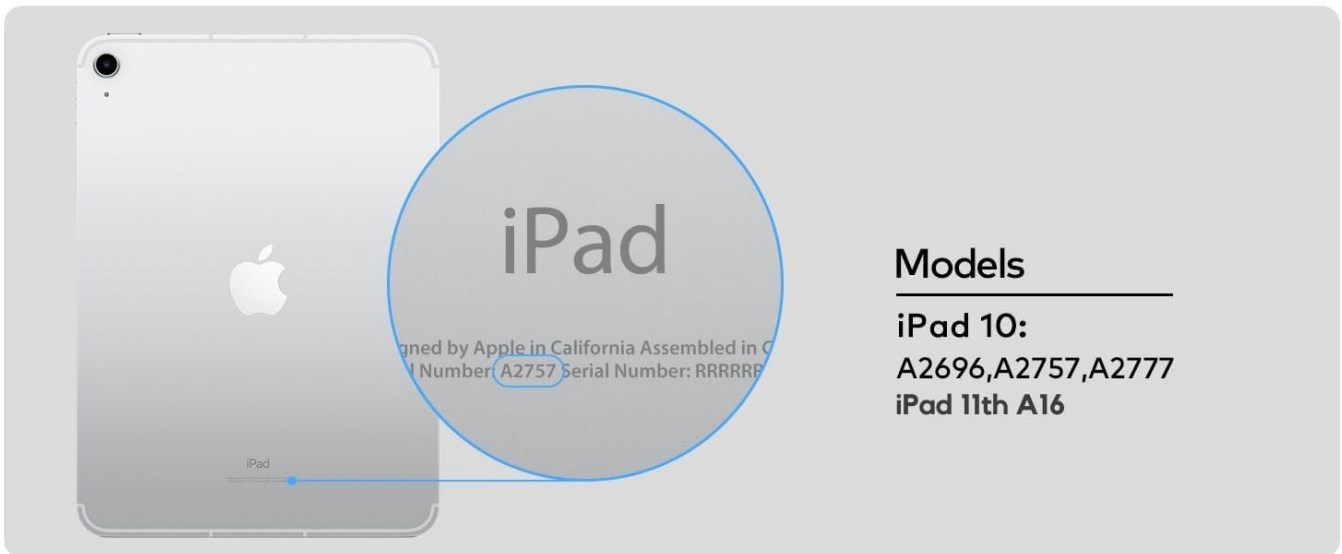
Image: A visual guide indicating compatibility with iPad 10th and 11th Generation models, and incompatibility with iPad Pro 11-inch, iPad Air 5/4, and iPad 9/8/7.