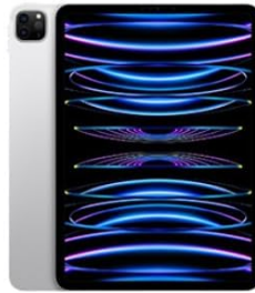
iPad Pro 11 inch