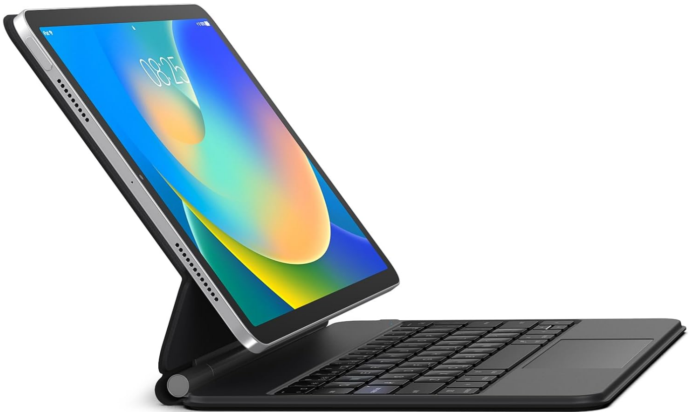
Image: The runelk Keyboard Case with an iPad attached, showcasing its laptop-like setup.

This runelk Keyboard Case transforms your iPad 10th or 11th Generation into a highly functional laptop-like device, enhancing productivity and versatility. It features a multi-touch trackpad, a floating cantilever stand, and a robust magnetic design for secure attachment and protection.