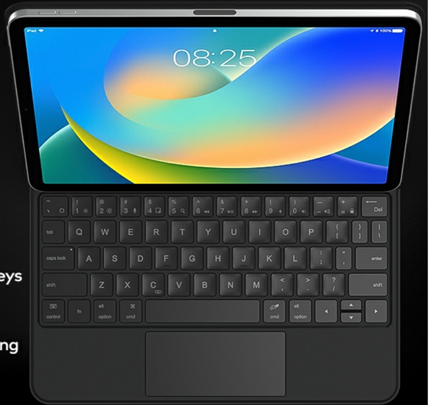
Image: Close-up of the keyboard highlighting the multi-touch trackpad, full row of iPadOS shortcut keys, and smooth typing experience.