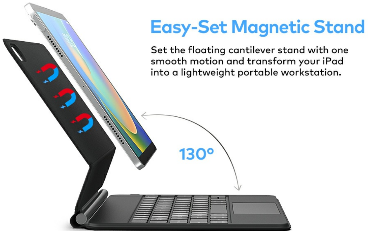
Image: Illustration showing the iPad magnetically attaching to the keyboard case and adjusting the floating cantilever stand to a 130-degree angle.