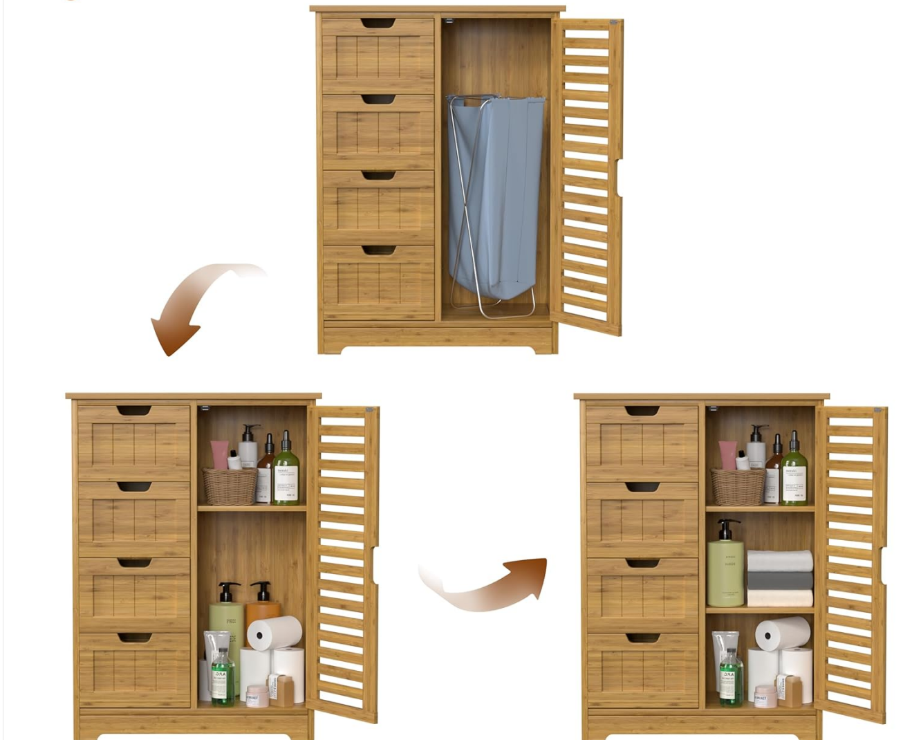
Figure 3: Removable Shelves. This image demonstrates the flexibility of the cabinet's interior, highlighting the two removable shelves that allow for customized storage space for taller items.

Removable shelf to offer a suitable storage place for the higher items