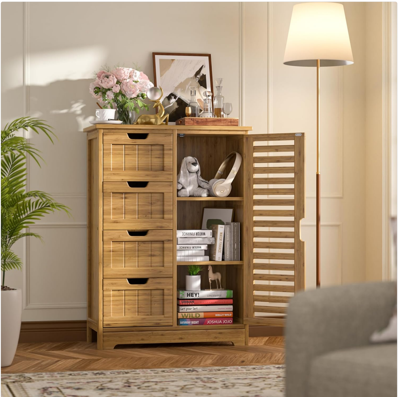
Figure 1: VEIKOU Bamboo Bathroom Floor Storage Cabinet. This image displays the cabinet's overall appearance, featuring four drawers on the left and a louvered door on the right, situated in a modern living space.