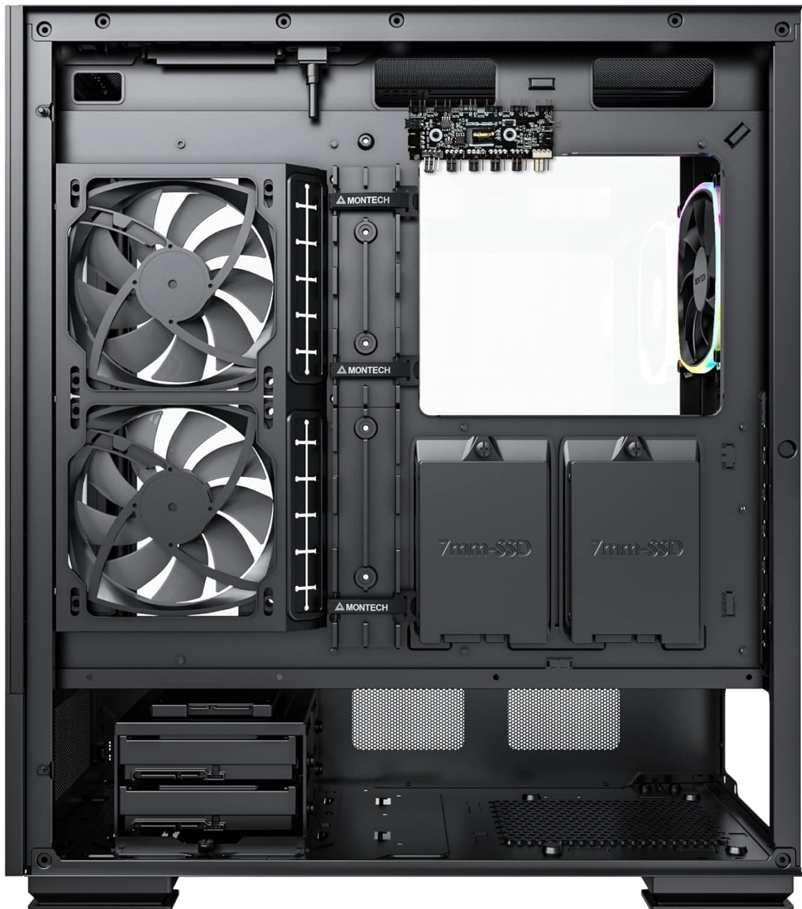
Image 4.1: Interior view of the Montech Sky Two case from the rear, showing the cable management area, fan mounting points, and drive bays, illustrating the ample space for component installation.