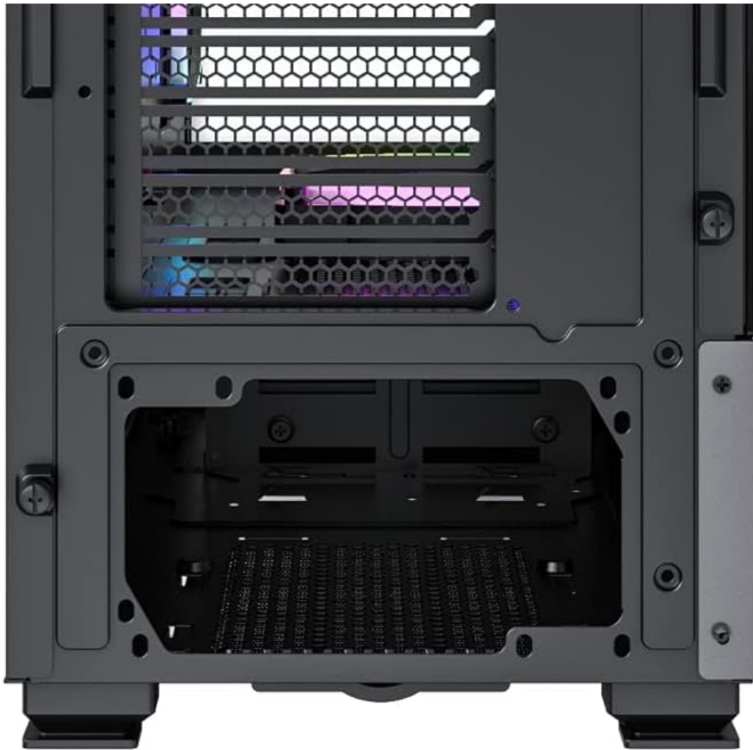
Image 6.1: Bottom view of the Montech Sky Two case, highlighting the removable dust filter for the power supply intake, which aids in maintenance and dust prevention.