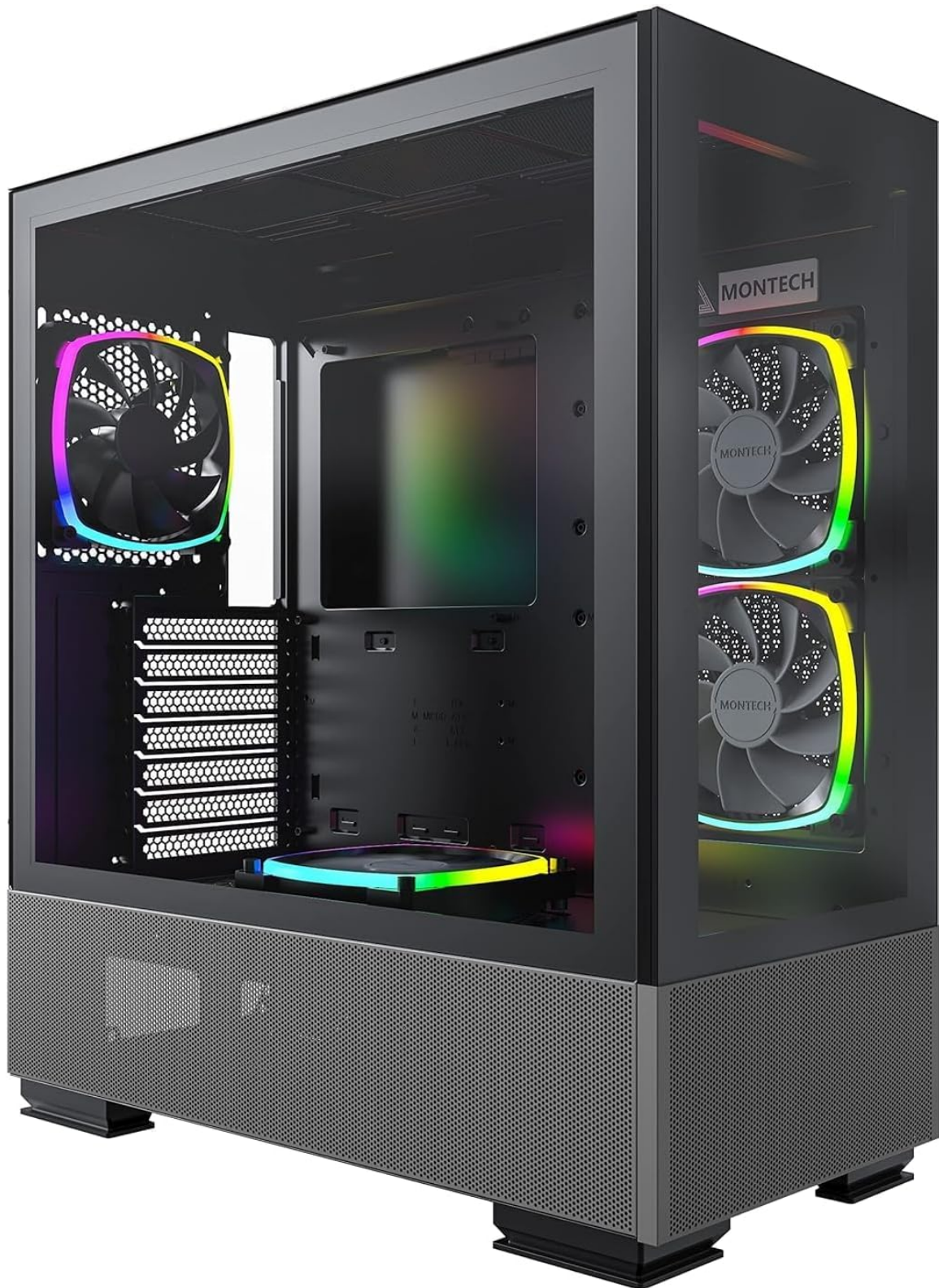
Image 1.1: Front-side view of the Montech Sky Two Black PC case, showcasing its dual tempered glass panels and vibrant pre-installed ARGB fans.