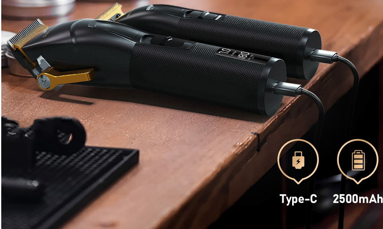
Figure 6: Both the clipper and trimmer support convenient USB-C charging, offering a universal interface and long battery life for extended use.