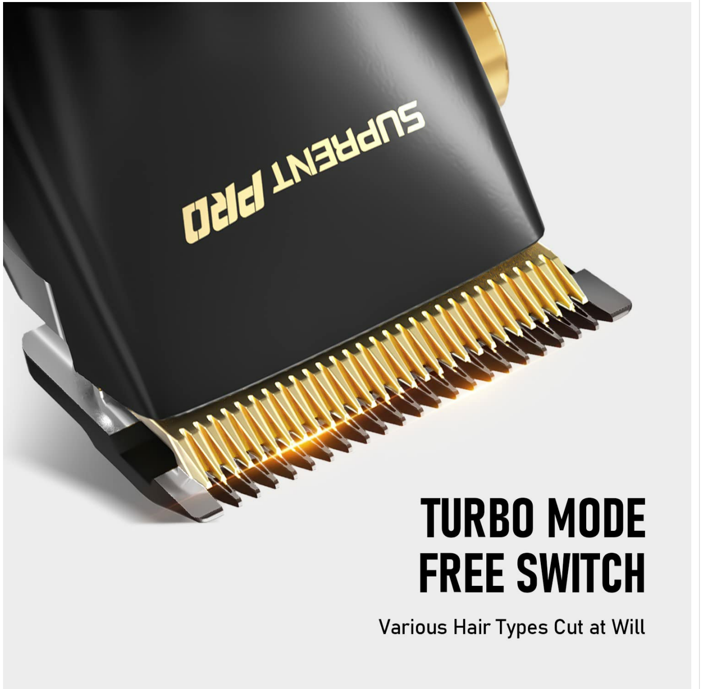
Figure 3: The clipper offers a 'Turbo Mode Free Switch' for adjusting motor speed, allowing for versatile cutting across various hair types.