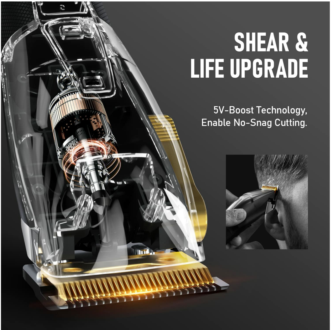
Figure 4: Illustration of the internal mechanism highlighting the 5V-Boost Technology, which maintains stable power for no-snag cutting, even through coarse hair.

5V-Boost Technology, Enable No-Snag Cutting.