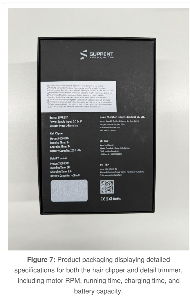
Figure 7: Product packaging displaying detailed specifications for both the hair clipper and detail trimmer, including motor RPM, running time, charging time, and battery capacity.