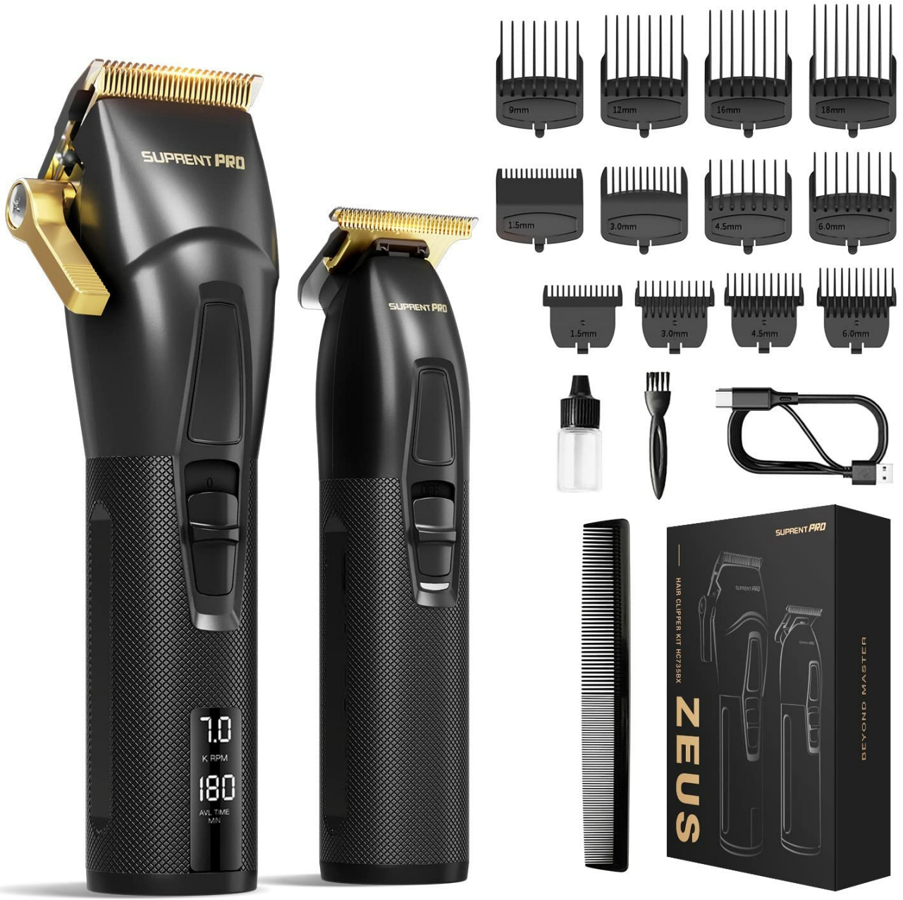
Figure 1: Complete set of SUPRENT PRO Professional Hair Clippers and T-Blade Trimmer, including various guide combs, cleaning brush, oil, and USB-C charging cable.