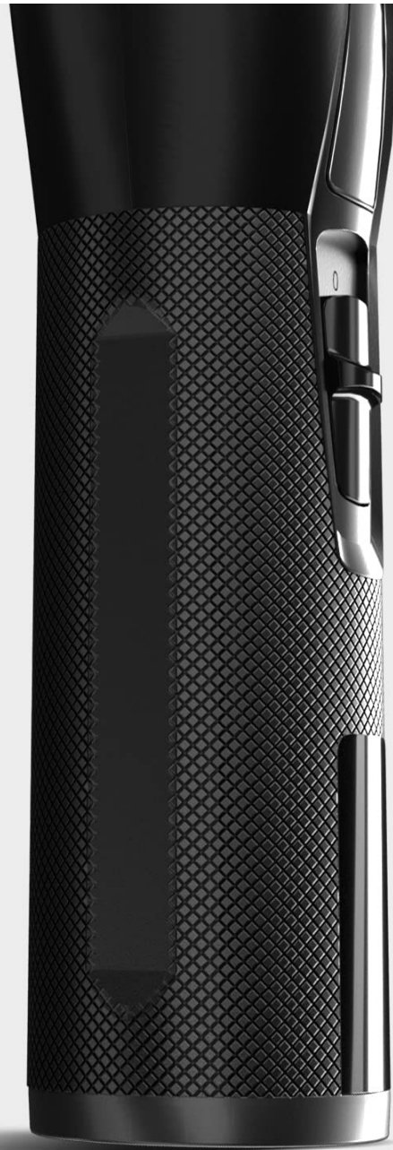
Figure 5: The clippers feature an ergonomic non-slip design with a knurled barbell grip, providing ultimate control and comfort during use.