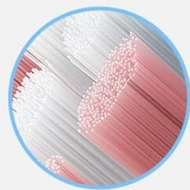
Fluoride Infused Bristle

delicately designed and soft bristle for kids