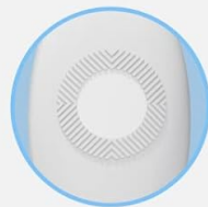
Rubber-covered Brush Head