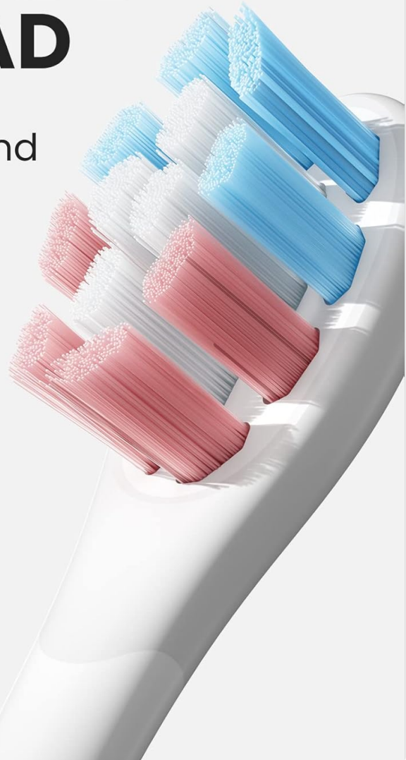
Image: Tailor-Made Brush Head. This image displays the specially designed brush head for kids, featuring soft DuPont & Pedex bristles, some infused with fluoride, and a rubber-covered base for safety and comfort.