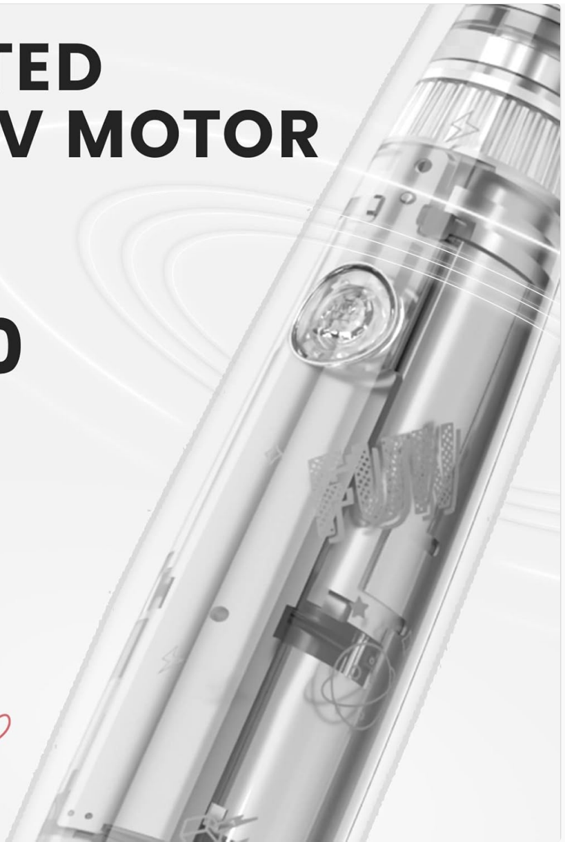
Image: Patented Maglev Motor. This image shows a transparent view of the toothbrush handle, highlighting the internal patented maglev motor, which delivers up to 80,000 movements per minute for effective cleaning.