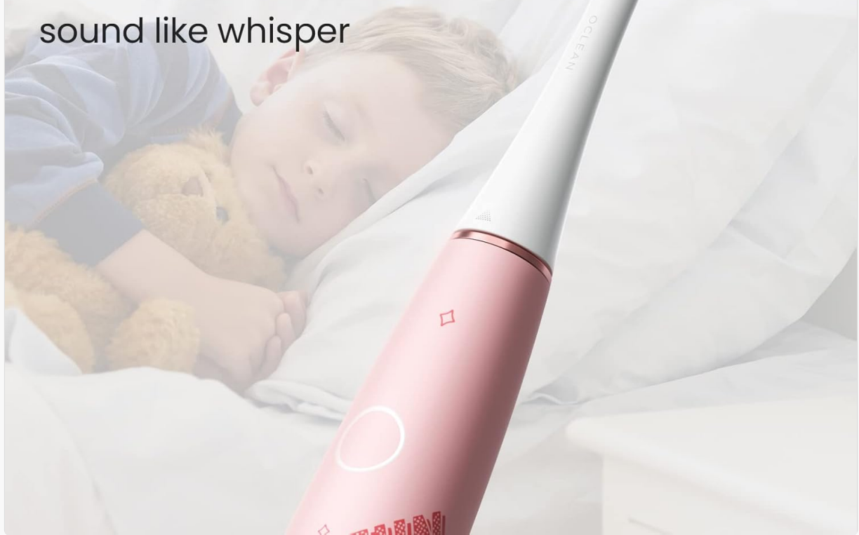
Image: Ultra Quiet Technology. This image shows a child sleeping peacefully while the Oclean toothbrush is in use, emphasizing its ultra-quiet operation (under 37 dB) due to Whisperclean technology.

UP to 45% noise reduction sound like whisper