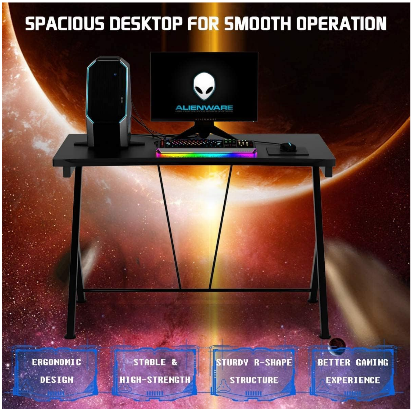
Image: The Goplus Gaming Desk set up with a computer monitor, keyboard, and mouse, demonstrating its spacious desktop.