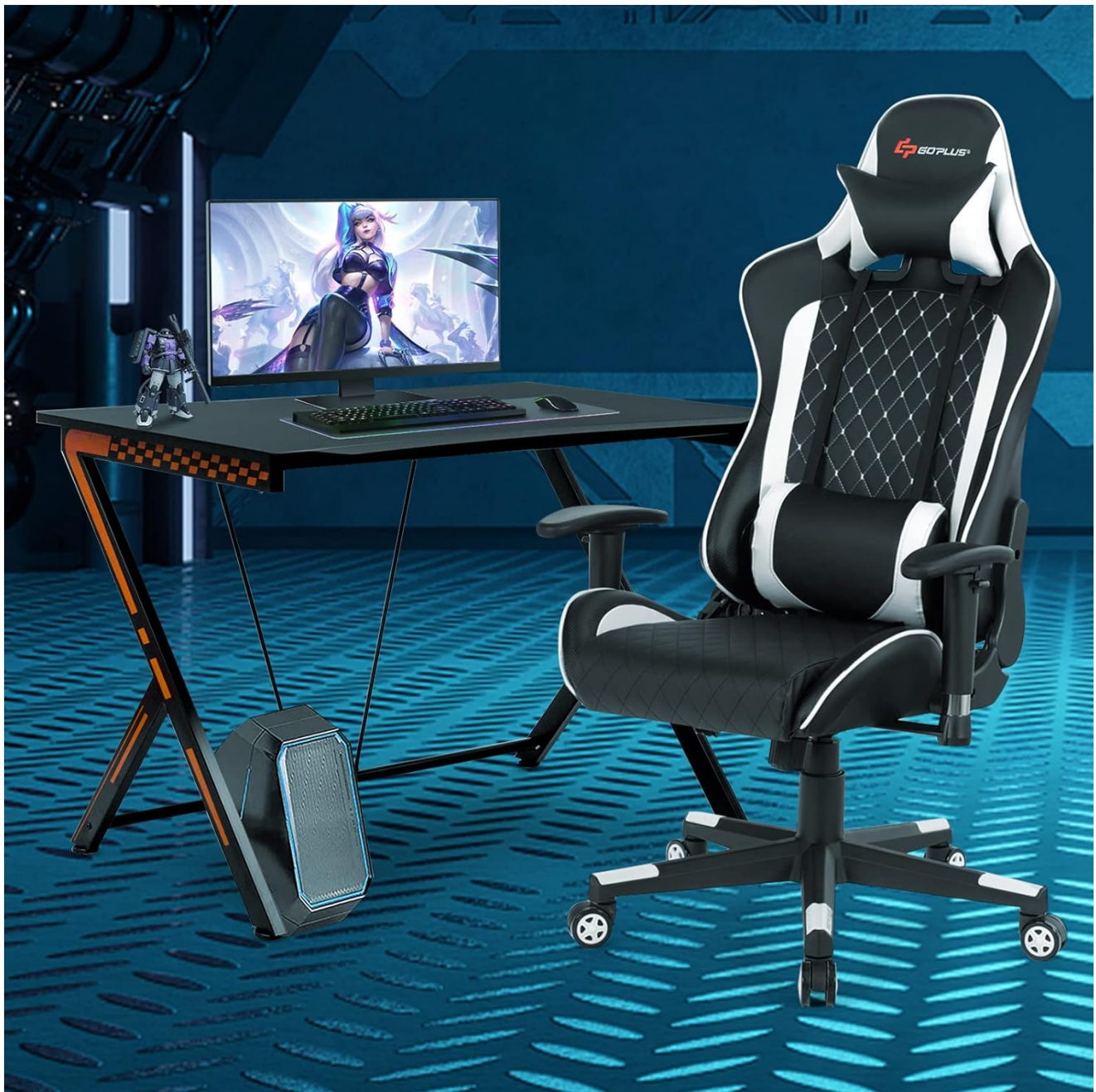
Image: The Goplus Gaming Desk and Chair Combo Set, featuring a black desk with orange accents and a black and white gaming chair.