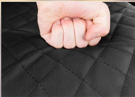
High Resilience Sponge