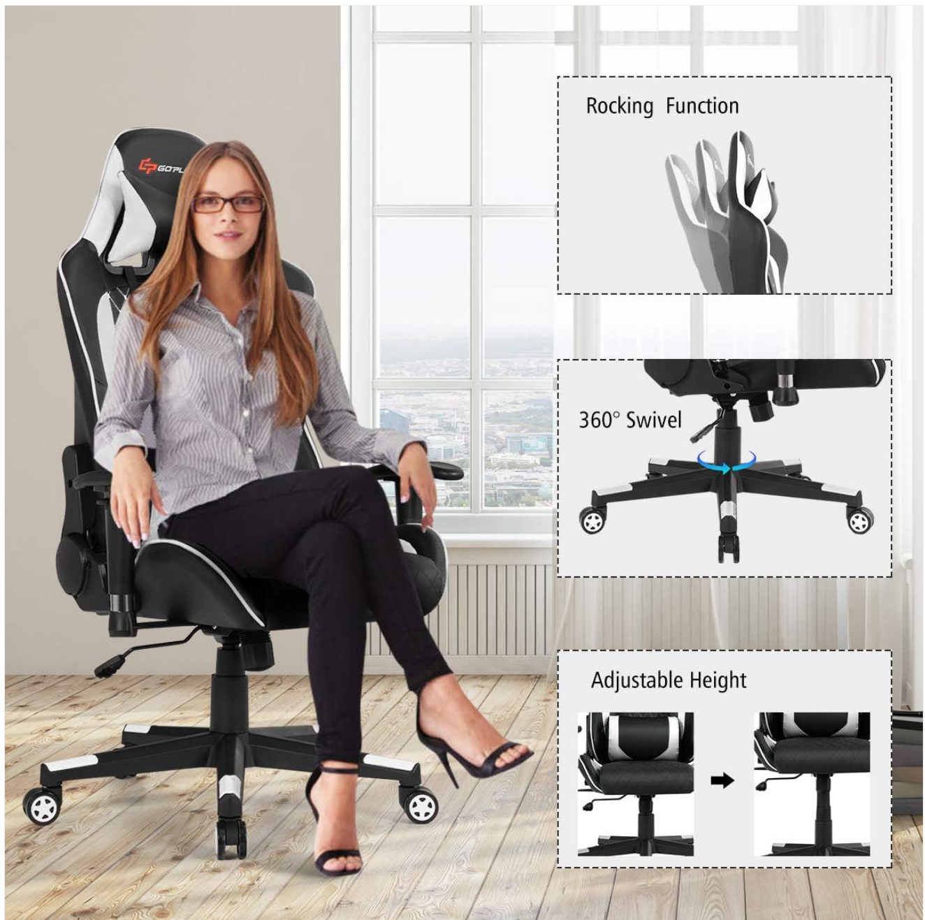
Image: A user sitting in the gaming chair, with insets showing the rocking function, 360° swivel, and adjustable height mechanism.