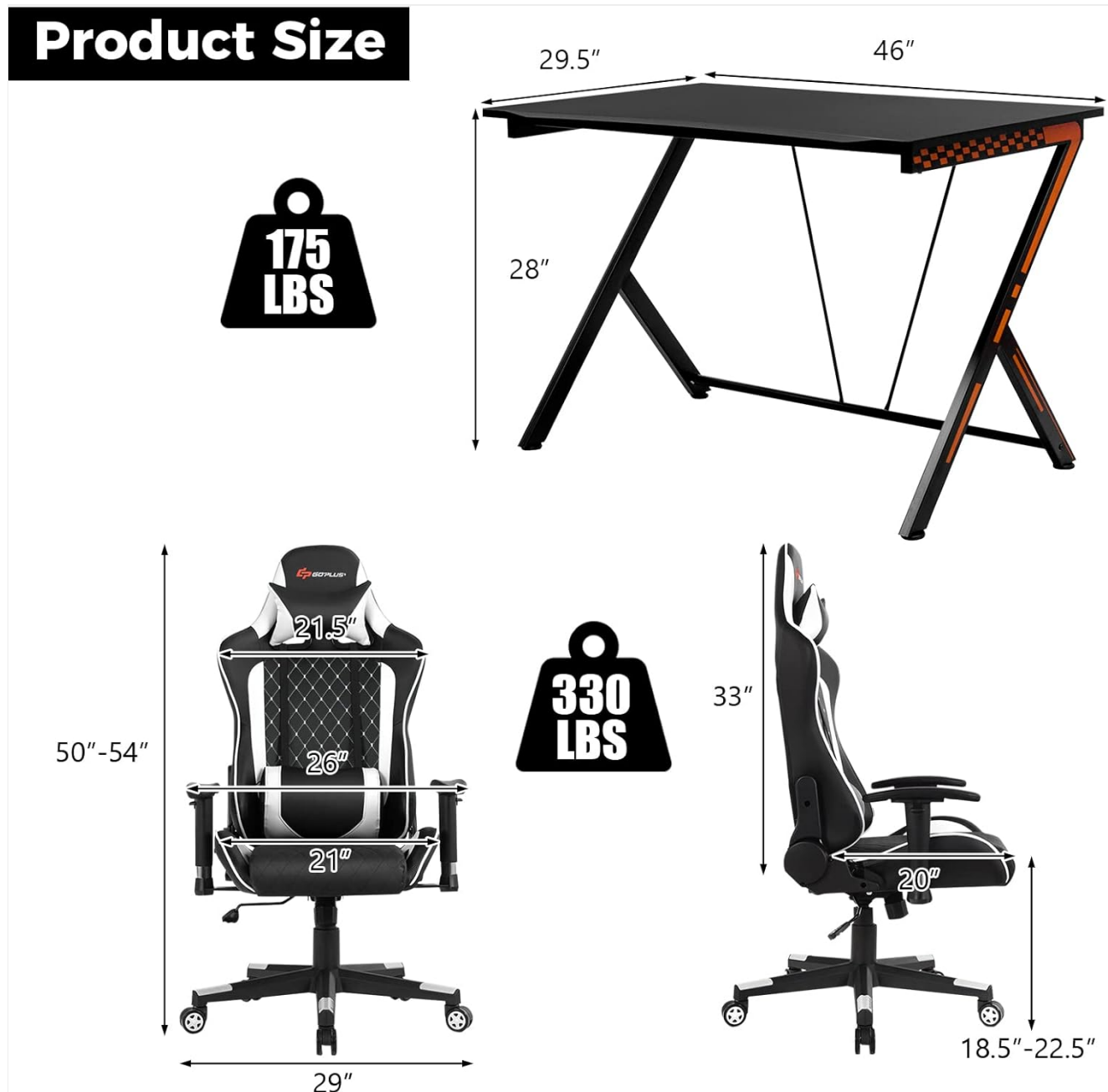
Image: Detailed diagram showing the dimensions and weight capacities for both the Goplus Gaming Desk and Chair.