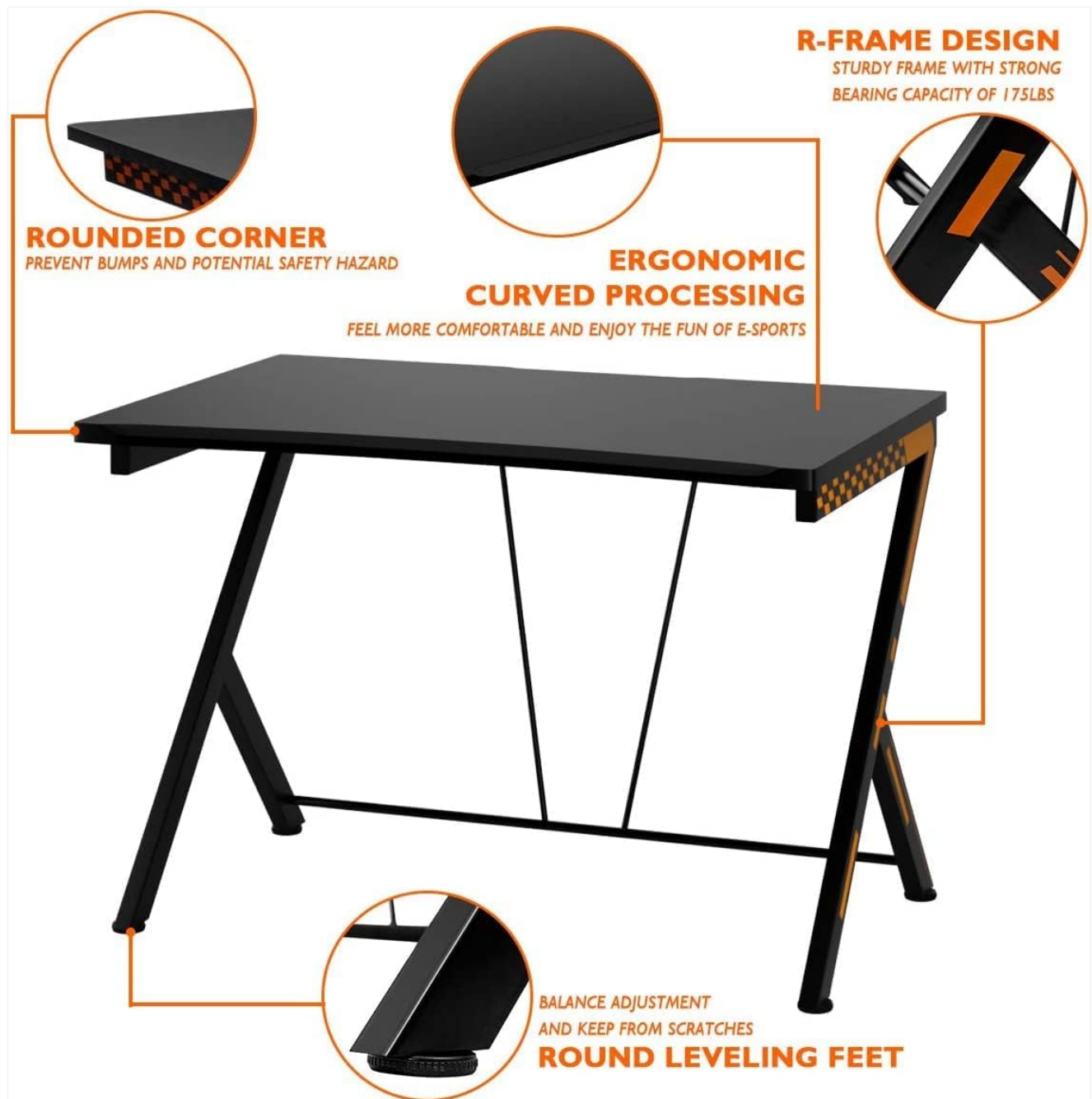
Image: Diagram highlighting the desk's features including rounded corners, ergonomic curved processing, R-frame design, and round leveling feet.

Refer to the dedicated instruction manual included with the desk for detailed, step-by-step assembly. Ensure all parts are identified and laid out before starting. The desk features a sturdy R-frame design with round leveling feet for stability on uneven surfaces.