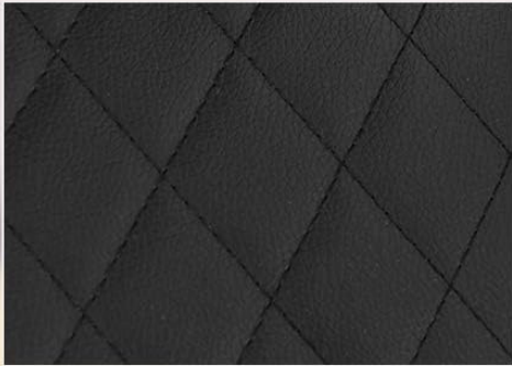
Soft PVC Leather