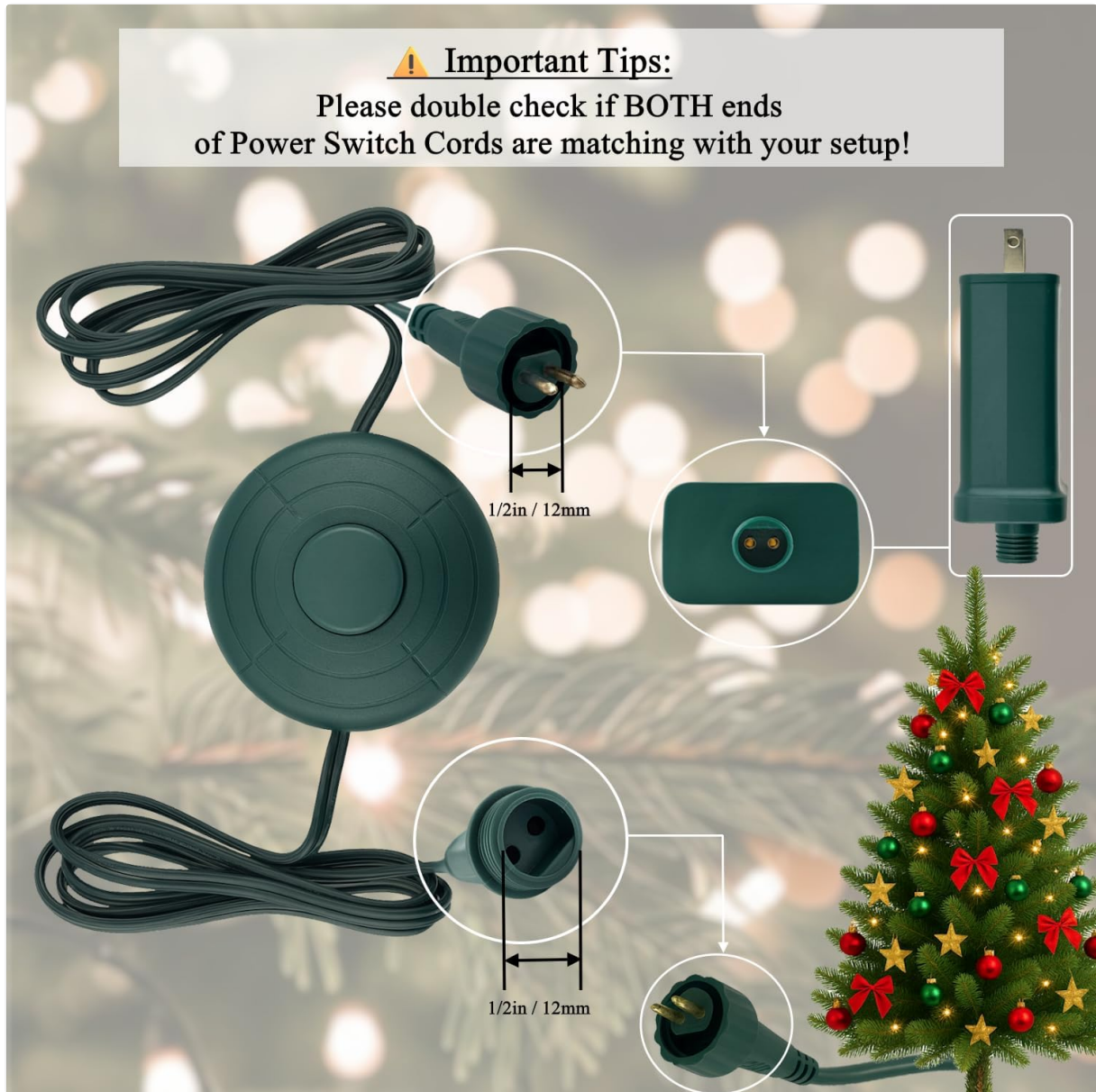
Figure 1: Important Tip - Double check if both ends of the power switch cords are matching with your setup, specifically the 1/2 inch (12mm) measurement for the plug and connector.