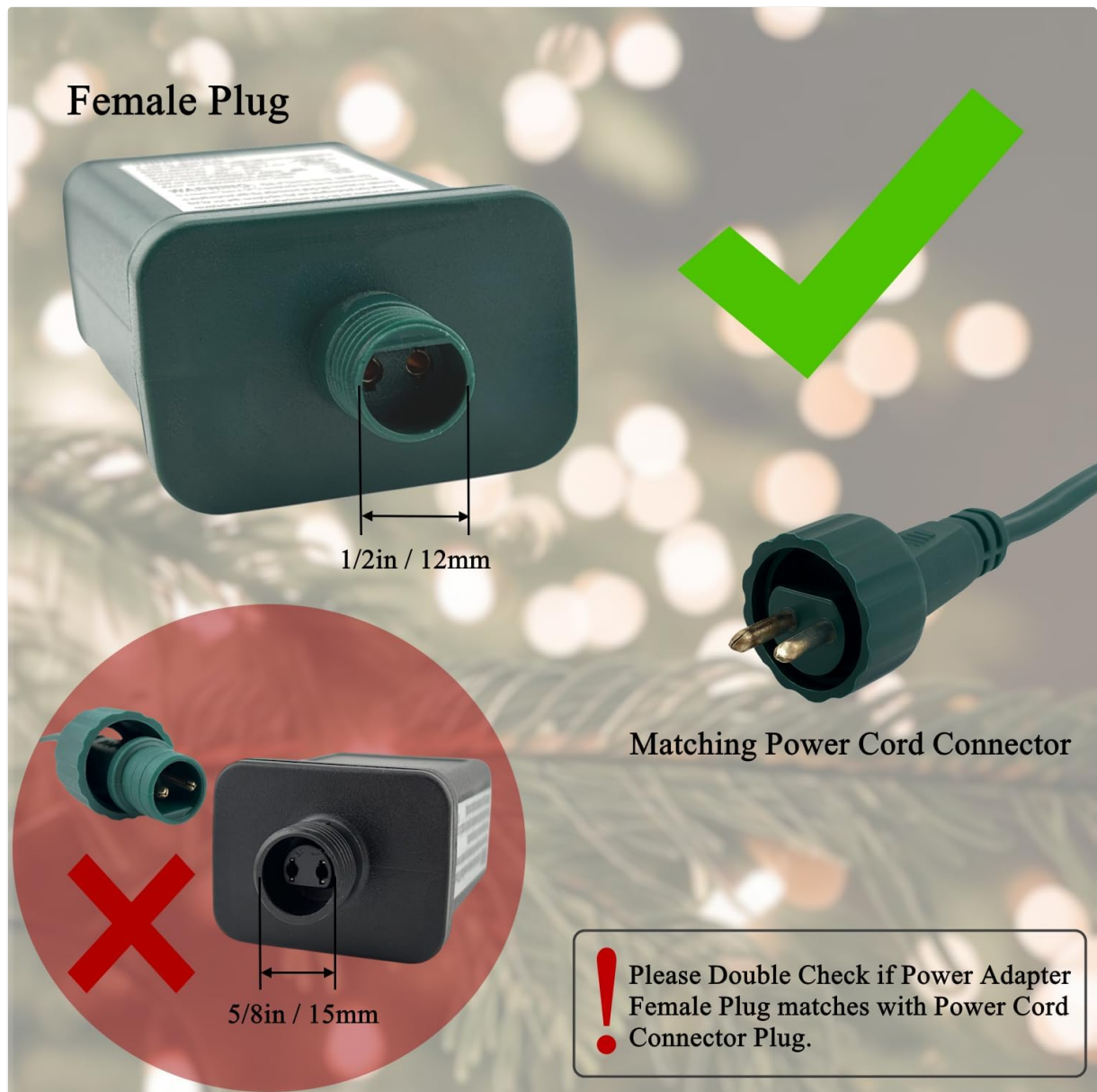
Figure 2: Visual guide for matching the female plug of your power adapter with the power cord connector plug. Ensure it is 1/2 inch (12mm) and not 5/8 inch (15mm).