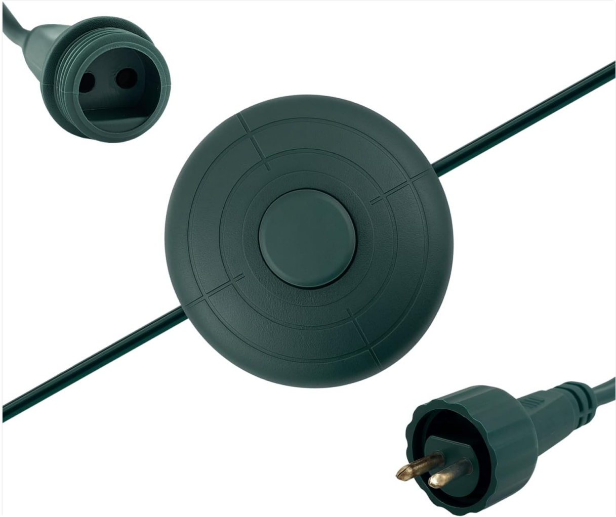
Figure 3: The SCREENTRONICS power cord components, showing the male plug, female connector, and the integrated foot switch for connection reference.