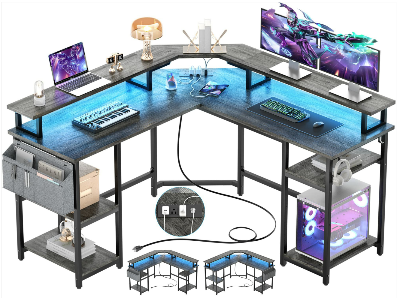
Image 1.1: Overview of the Aheaplus L Shaped Gaming Desk, showcasing its L-shape design, monitor stand, and integrated features.