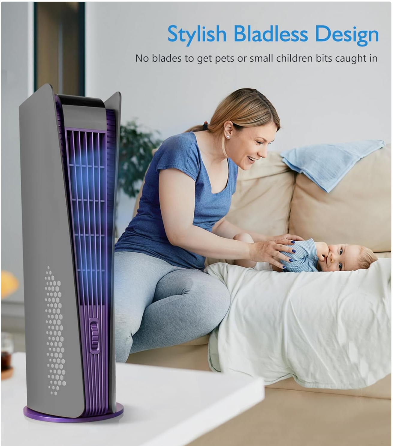
Figure 5: The bladeless design of the fan, emphasizing its safety for use around children and pets.

No blades to get pets or small children bits caught in