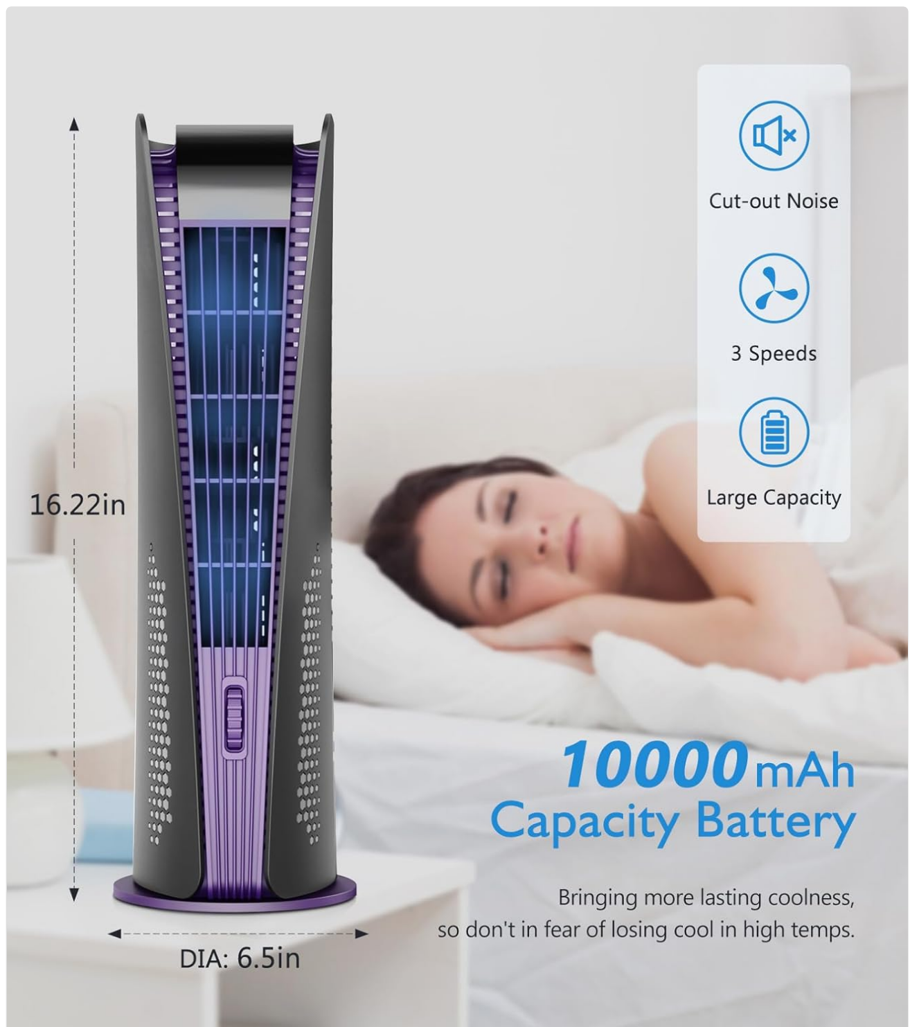
Figure 2: The fan's dimensions (16.22 inches tall, 6.5 inches diameter at base) and its 10000mAh battery capacity, highlighting its portability and long-

Before first use, fully charge the fan. Connect the provided USB to C-type cable to the USB-C port located at the base of the fan. Connect the other end of the cable to a compatible USB power source (e.g., computer USB port, USB wall adapter - not included). A full charge takes approximately 5 hours. The fan's HD LED display will indicate the battery level.