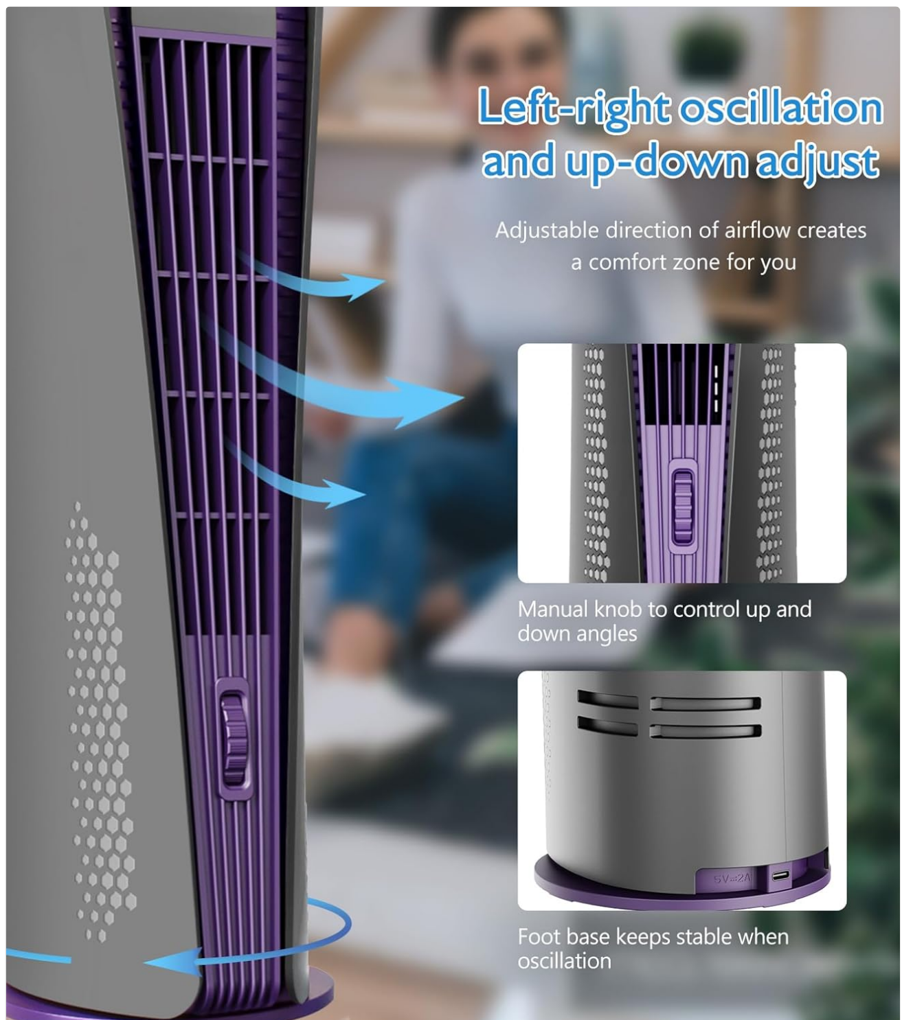
Figure 4: Illustration of the fan's left-right oscillation and the manual knob for adjusting the up-down airflow direction.

A manual knob located on the side of the fan allows for up-down adjustment of the airflow direction. This provides precise control over where the cool air is directed.