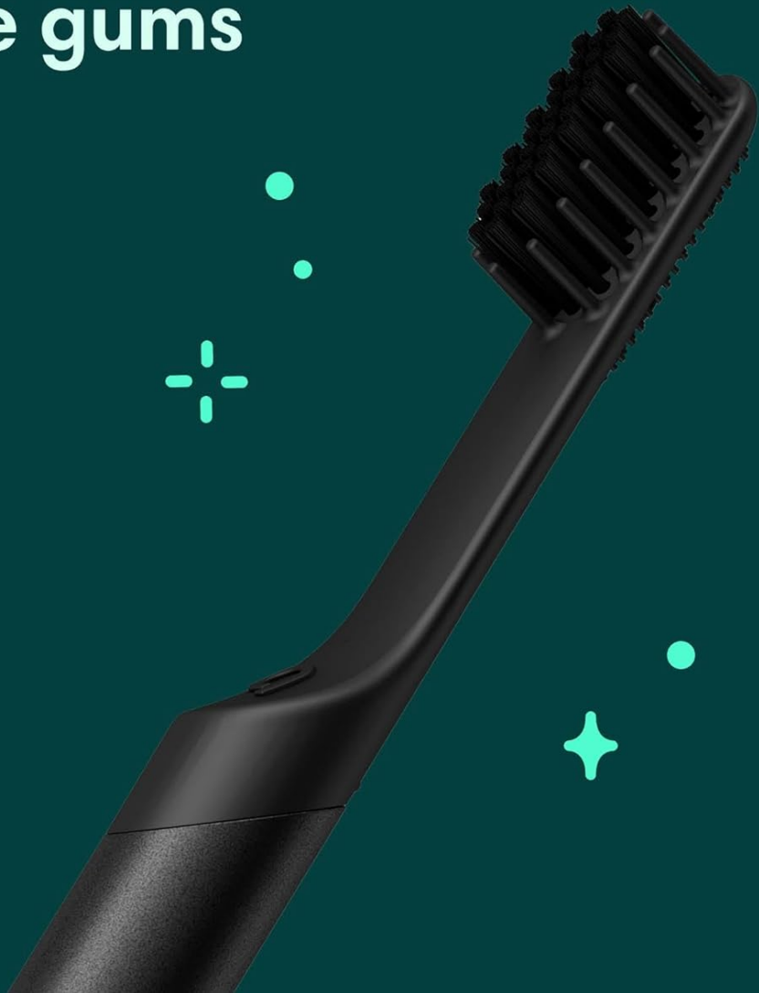
Image: A close-up of the Quip toothbrush head, highlighting its soft bristles and integrated tongue scraper, designed for gentle yet effective cleaning of teeth and gums.