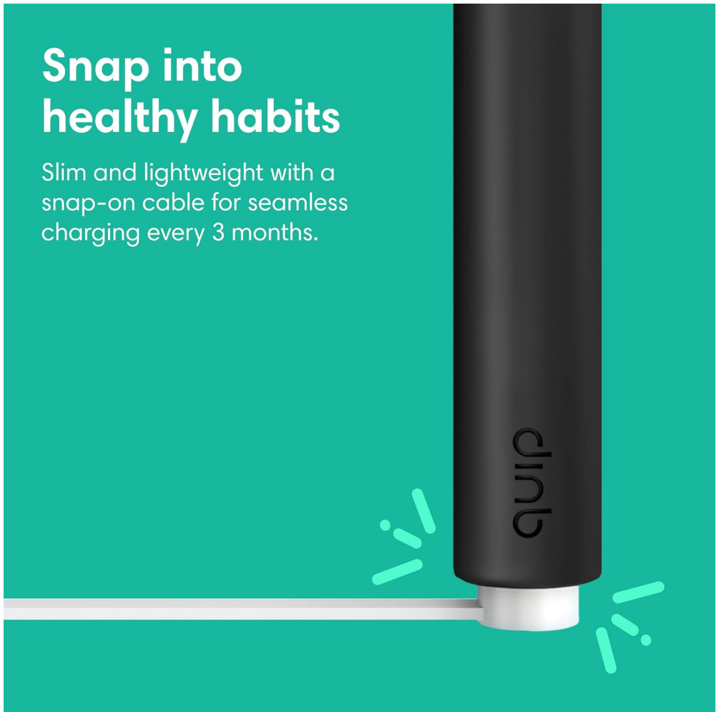
Image: The Quip toothbrush connected to its magnetic snap-on charging cable, emphasizing the ease of charging and its slim design.

Slim and lightweight with a snap-on cable for seamless charging every 3 months.