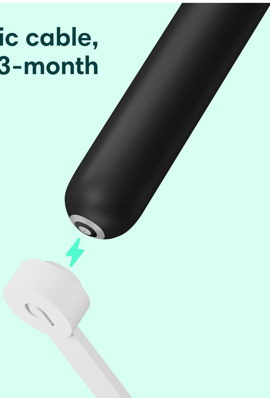
Image: A close-up view of the magnetic charging cable connecting to the base of the Quip toothbrush, illustrating the seamless and non-bulky charging design.