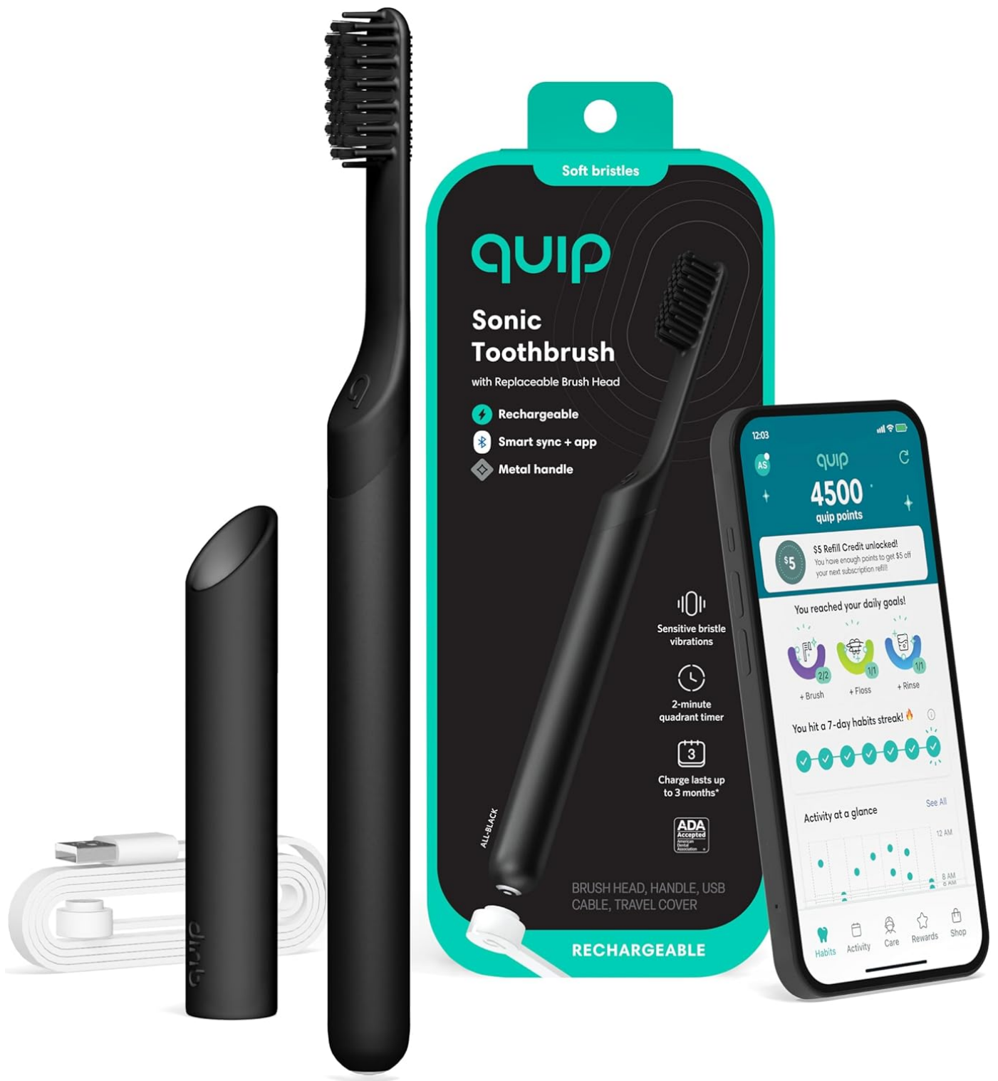
Image: The Quip Smart Sonic Toothbrush in all-black, displayed with its packaging, charging cable, travel cover, and a smartphone showing the connected Quip app interface. This image highlights the complete product package and its smart features.